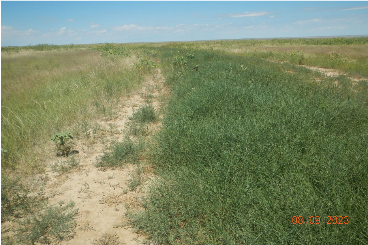
Photo 2. Facing northeast along the access road. The road was reclaimed however, there are undesirable weeds (Russian thistle - dark green) growing along the road that needs to be controlled.