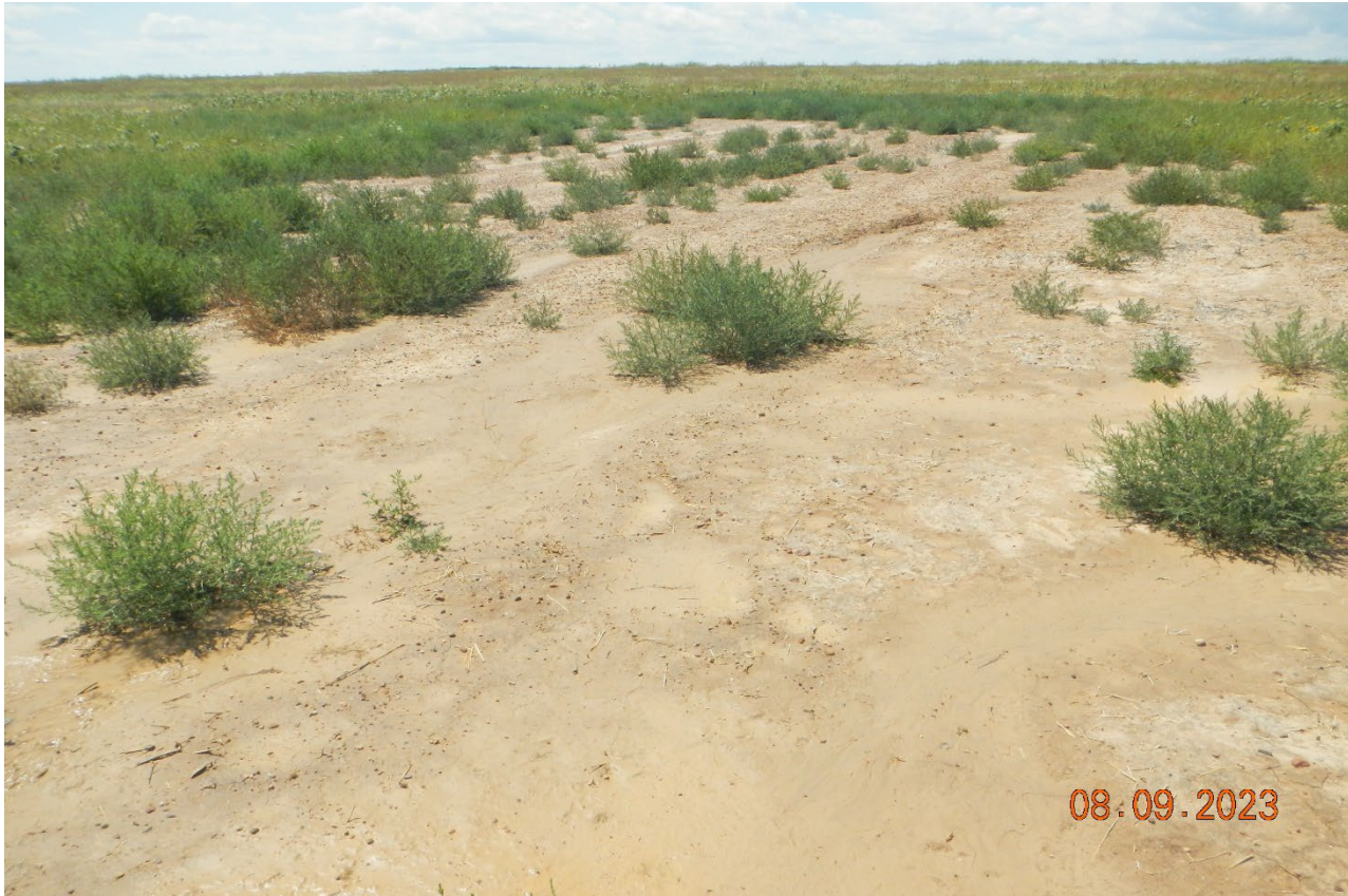
Photo 6. This area where the former tank battery was located is bare of vegetation and may have impacted soils.