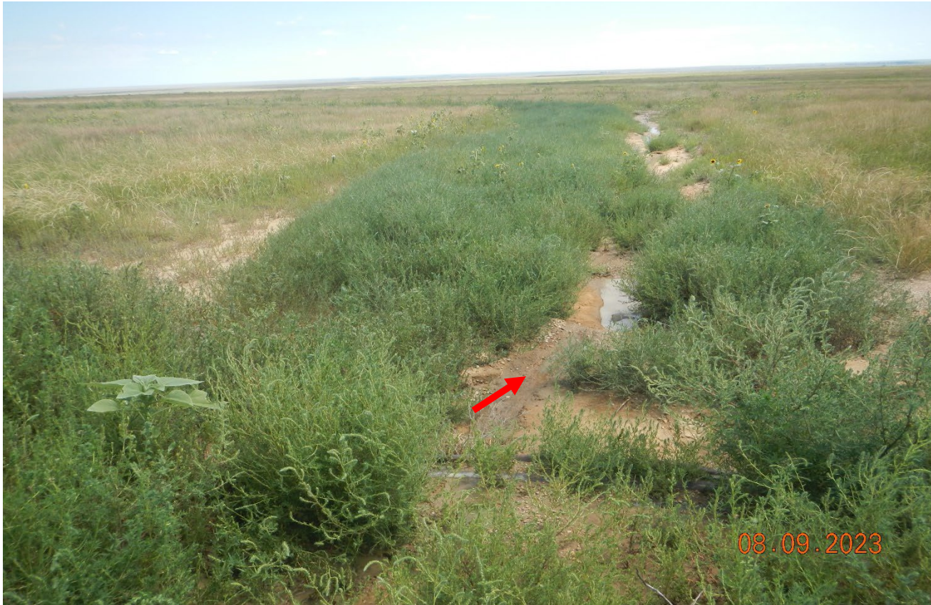
Photo 1. Facing east at the access road. The cattleguard has filled in with sediment and there is erosion along the road shown at red arrow. There is also undesirable weeds (Russian thistle - dark green) growing along the road that needs to be controlled.