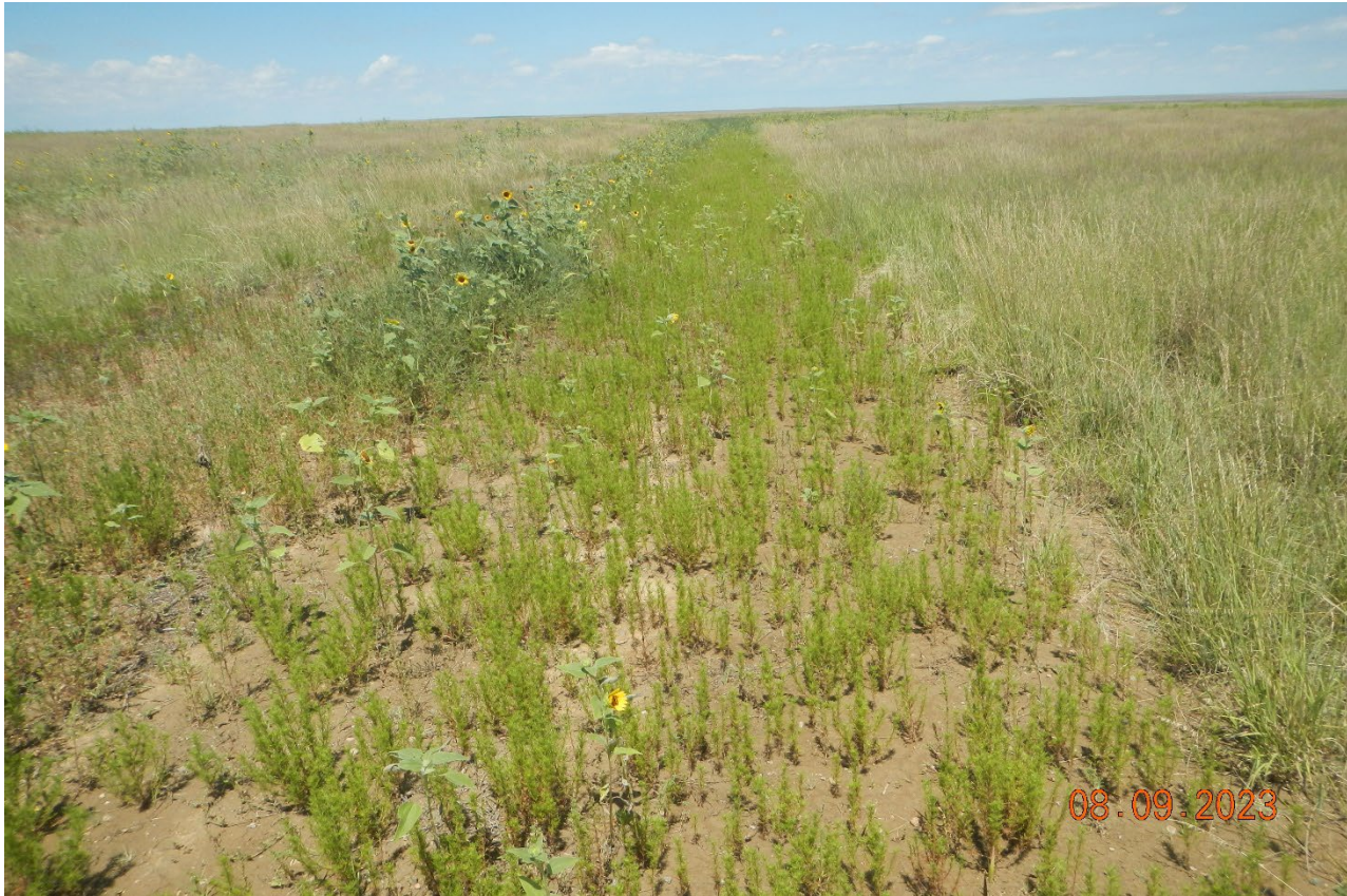
Photo 3. Facing northeast along the access road. The road was reclaimed however, there are undesirable weeds (Kochia) growing along the road that needs to be controlled.