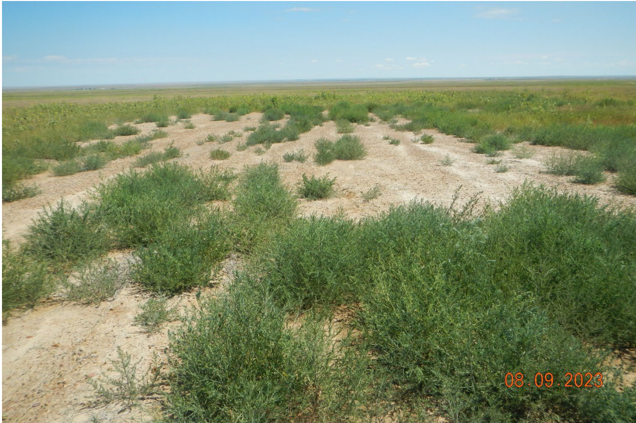
Photo 5. Facing east at the location. This area where the former tank battery was located is bare of vegetation and may have impacted soils.