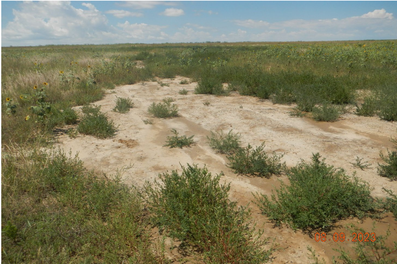
Photo 7. East of the location facing west. There appears to be impacted soils downhill east of the location.