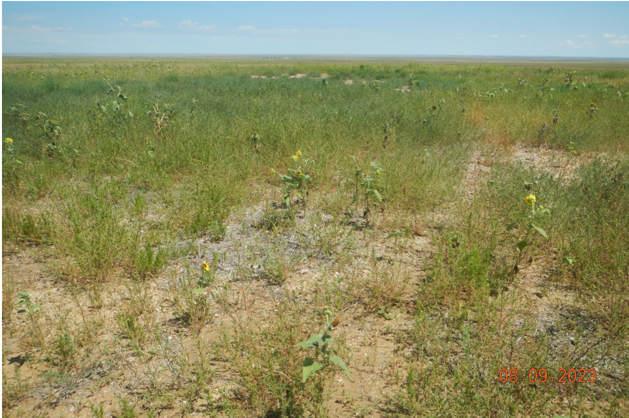
Photo 4. Facing northeast toward the location. The well has been plugged and abandoned and all equipment is removed. Reclamation was performed however desirable vegetation is not establishing and there are undesirable weed.