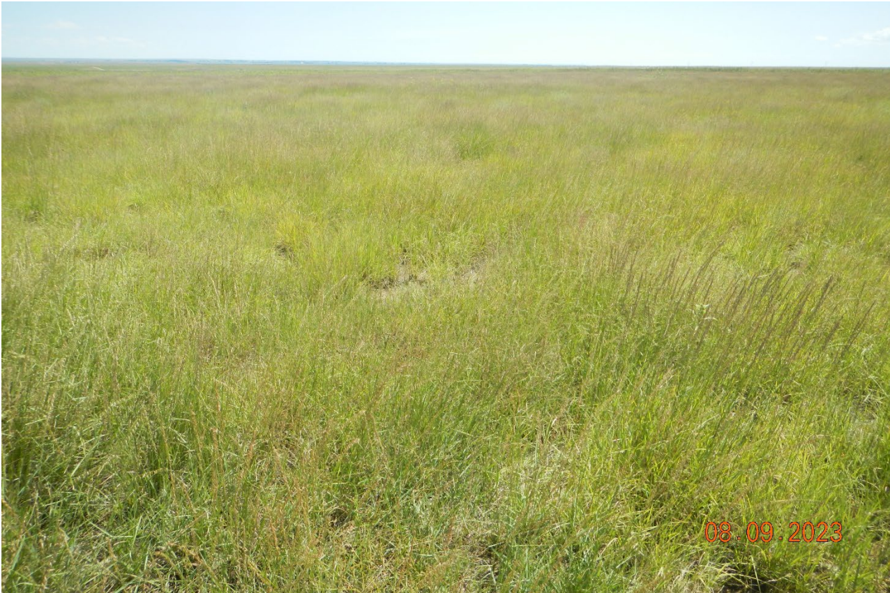
Photo 9. Facing south toward the surrounding undisturbed CRP grassland which shows uniform vegetation cover with little to no undesirable weeds.