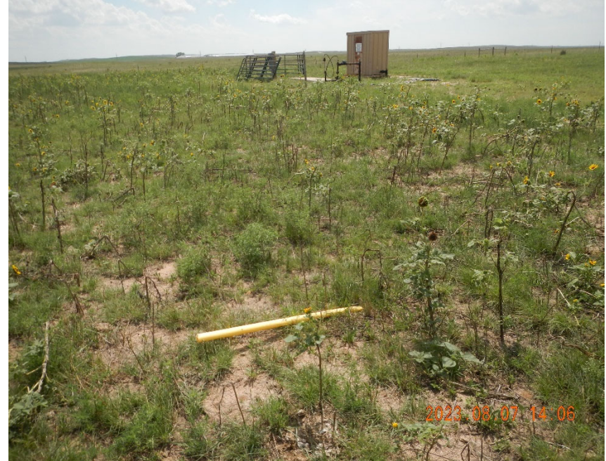
10. One of four located deadmen with marker down.