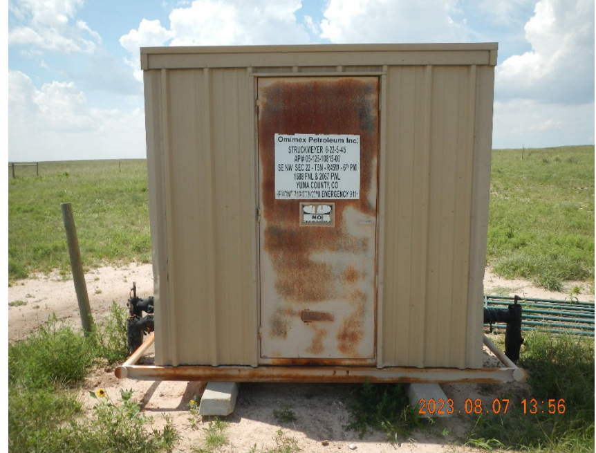
4. Meter Shed.