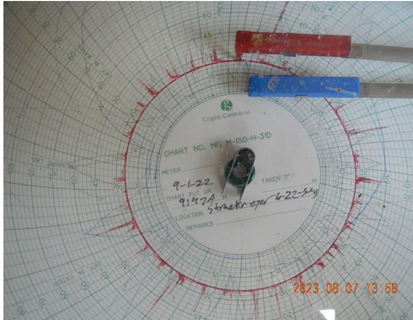
7. View of Chart in Meter Box at time of inspection.