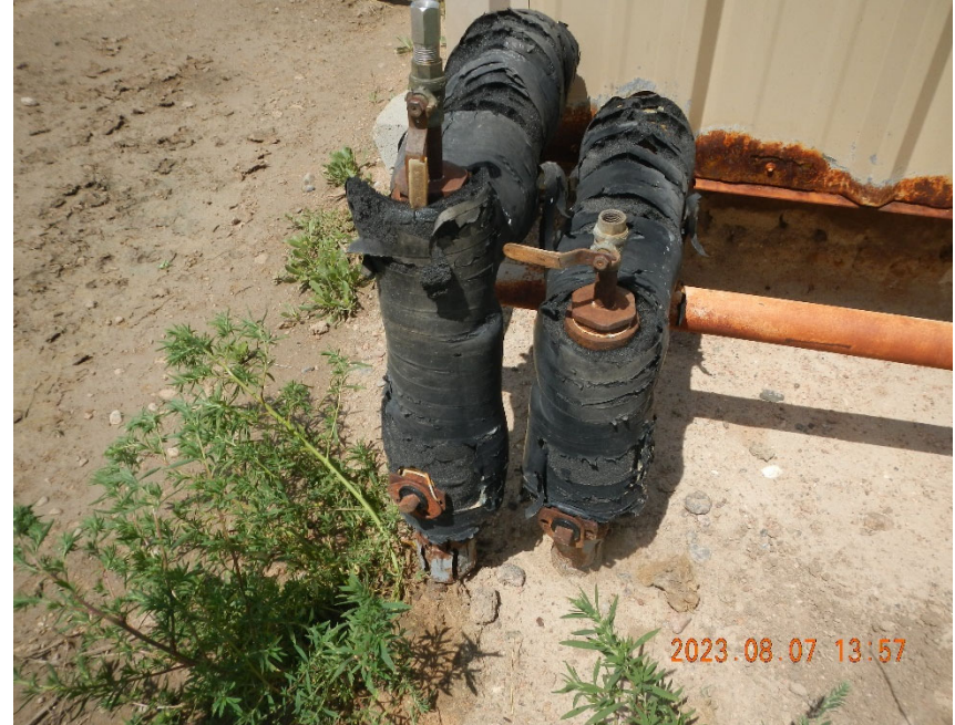
6. View of outlet valves from Gas Meter and Separator.