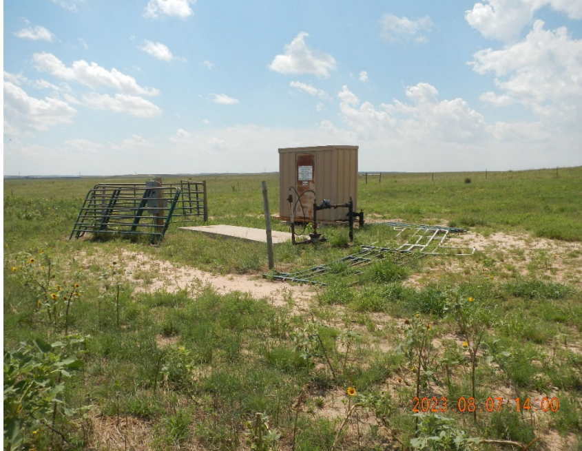
9. Location overview. Note disassembled fencing and vegetation.