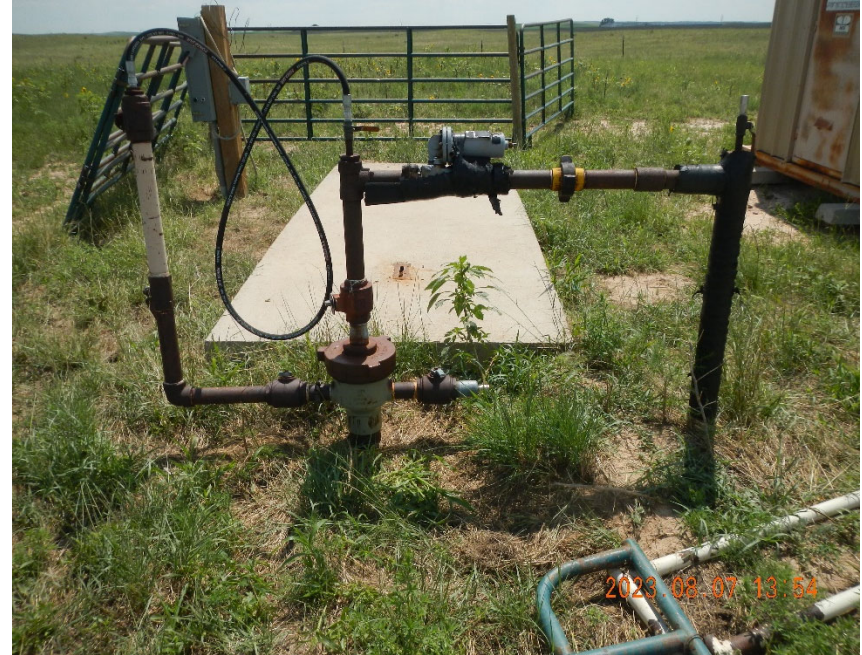
2. View of Wellhead. Note vegetation.