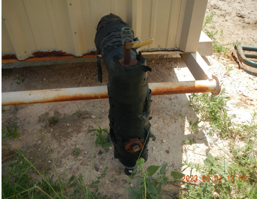
5. View of inlet valve from well to Meter Shed.