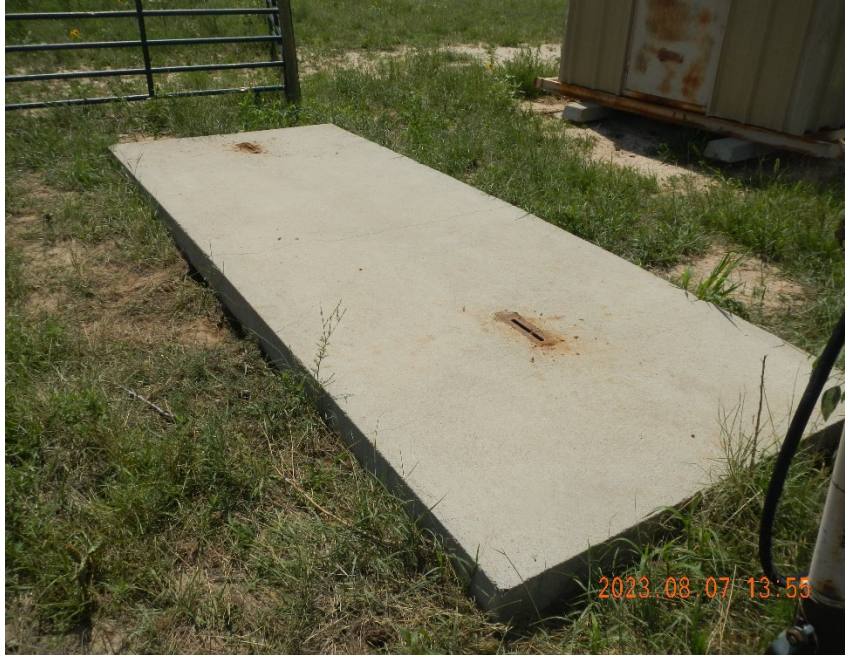
3. Concrete pad left on location after Pump Jack removed. Note vegetation.