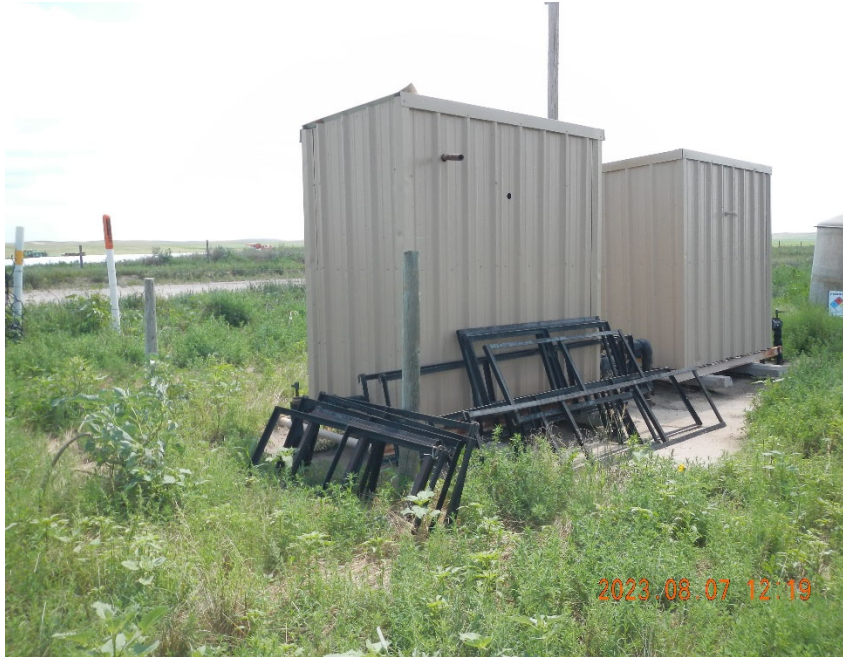
7. View of unused equipment left at remote Meter Shed.