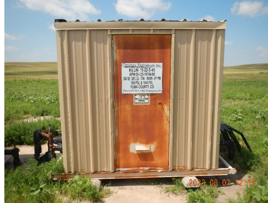
6. Remote Meter Shed.