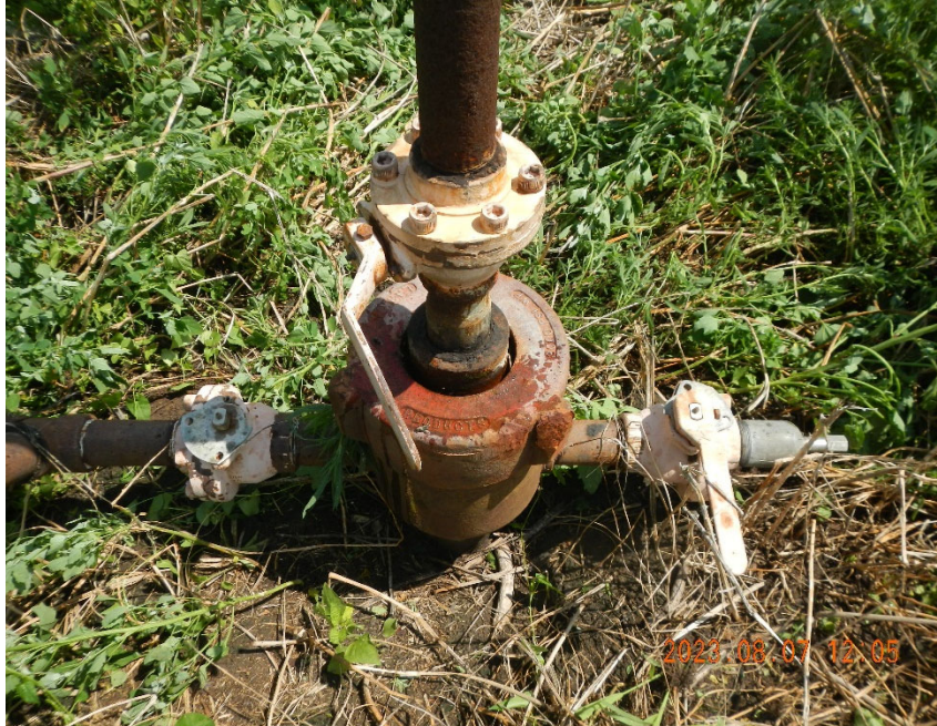
3. Additional view of Wellhead.