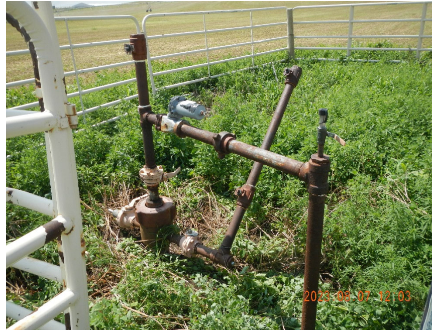
2. View of Wellhead. Note vegetation.