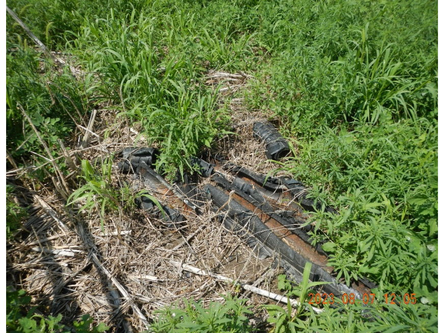
4. Production related debris at well location.