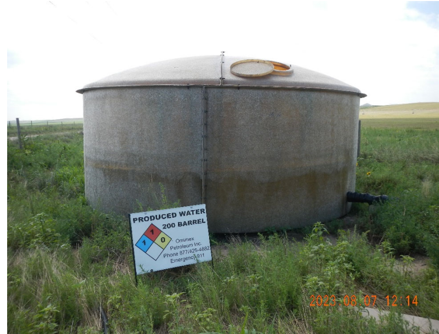
10. View of Produced Water Tank at remote. Gas Meter Run Note vegetation.