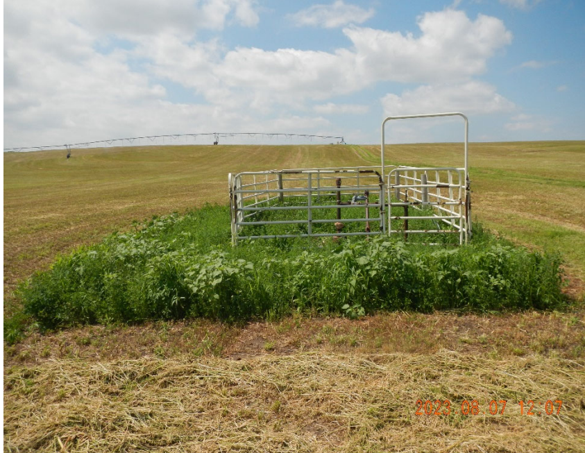
5. Well location overview. Note vegetation inside and around fencing.