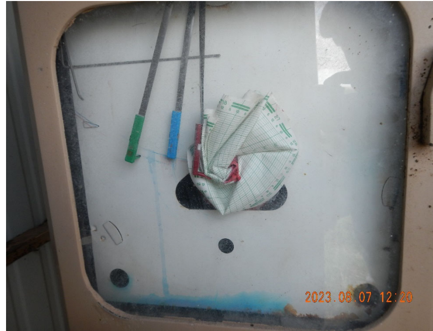
8. View of twisted up Chart inside Meter Box at time of inspection.