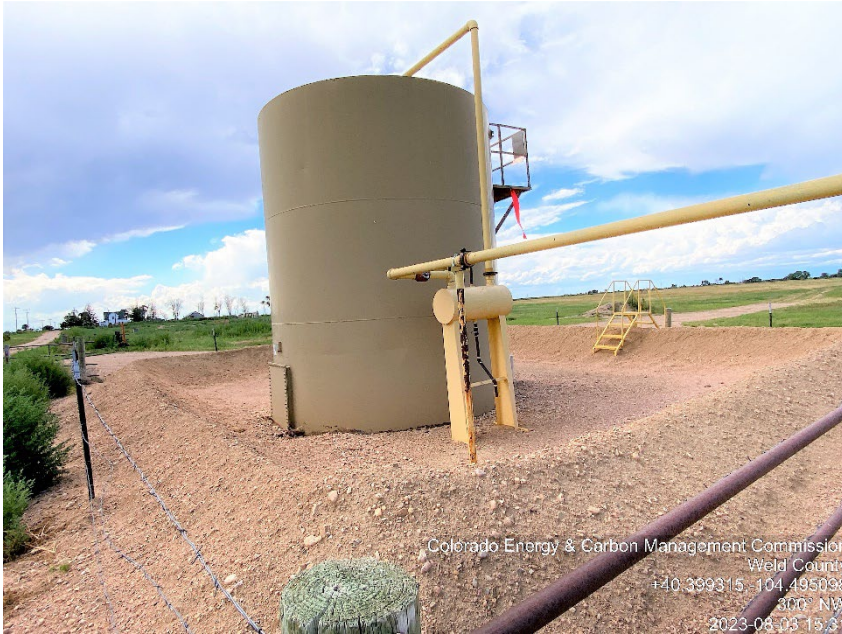
Photo #3 Lohr 32-13 Battery site Inactive | Shut-down Tank(s): SE corner