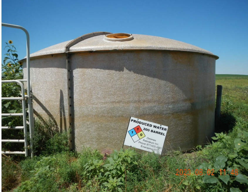
9. View of Produced Water Tank at remote Gas Meter Run site. Note vegetation growth.