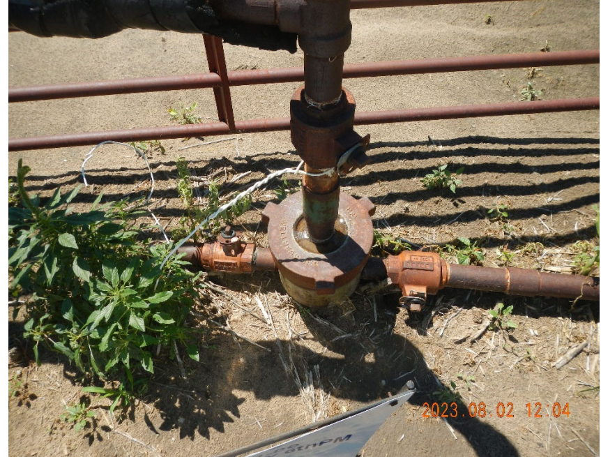
2. View of wellhead.