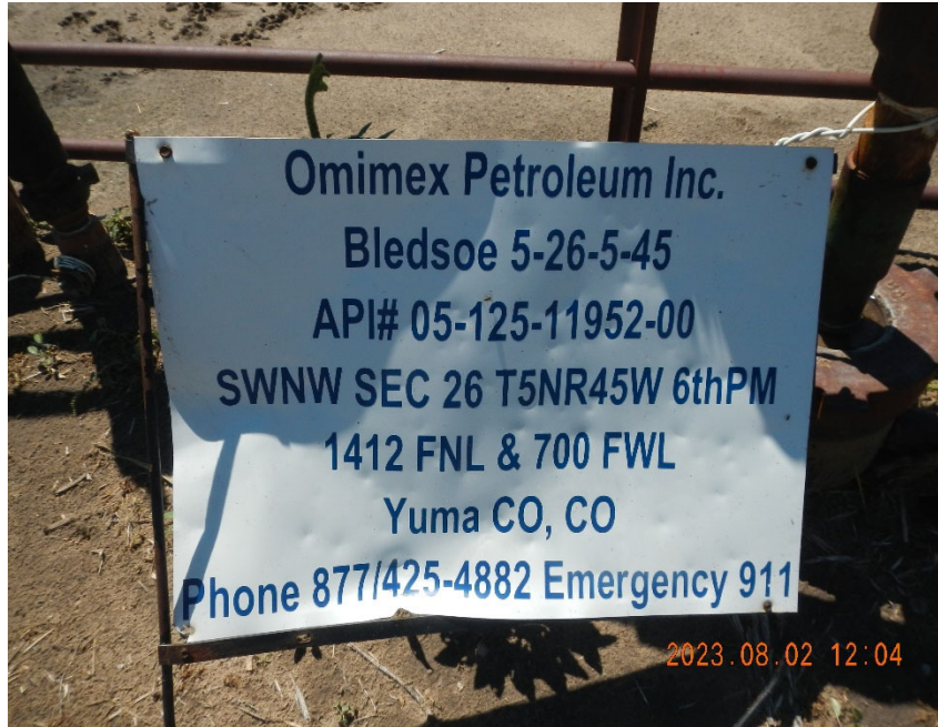
1. Well sign at well location.