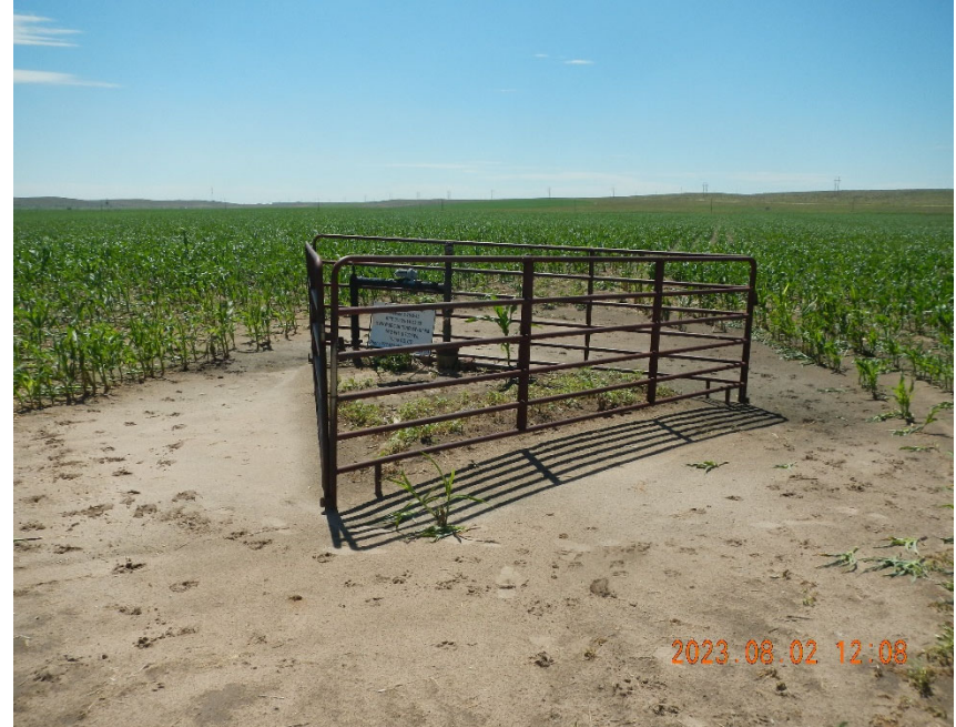
4. Well location overview.