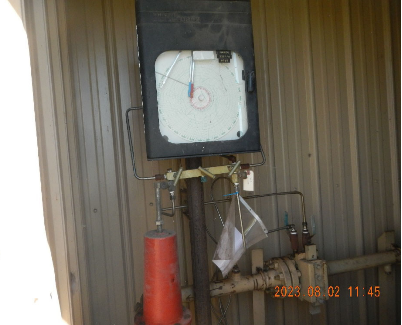
6. View of Gas Meter inside Meter Shed.