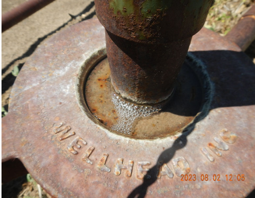
3. View of bubbles from gas leak at wellhead cap.