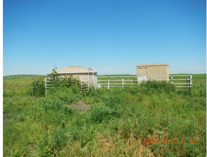
10. Overview of remote Gas Meter And Production Tank. Note vegetation growth.