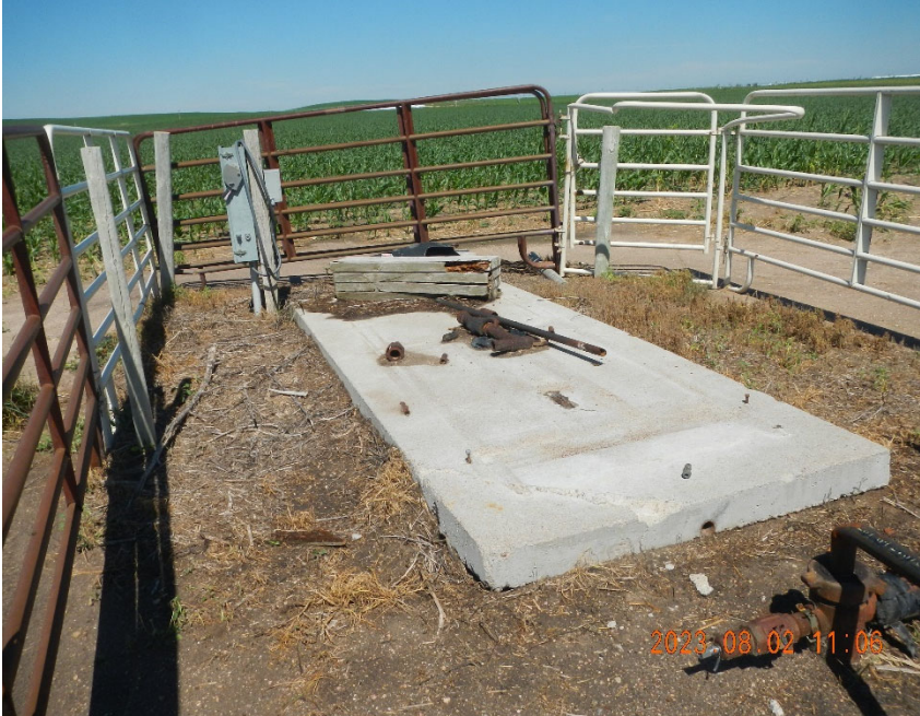
5. Cement pad, production related debris inside fencing.