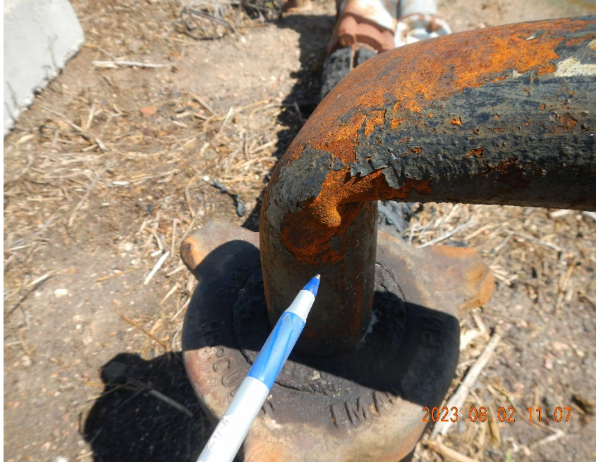
3. Split in tubing joint just above well cap.