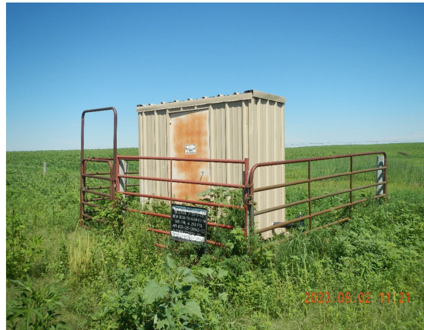
12. Remote Gas Meter Run overview.