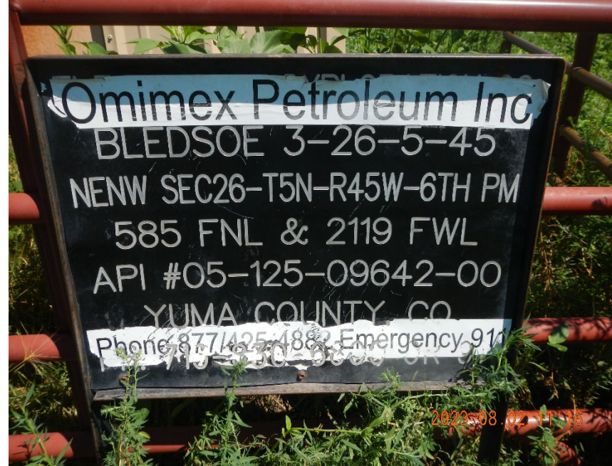
6. Well sign at remote meter shed.