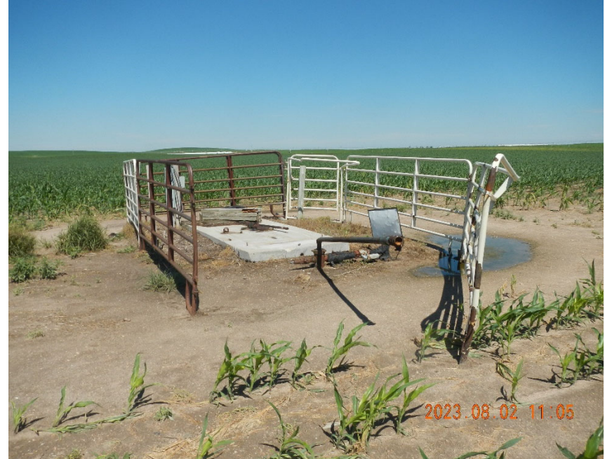
4. View of well site and damaged fencing.