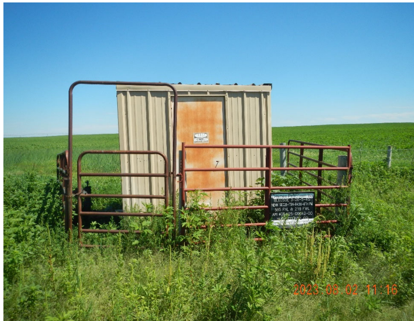
7. Remote meter shed. Note vegetation.