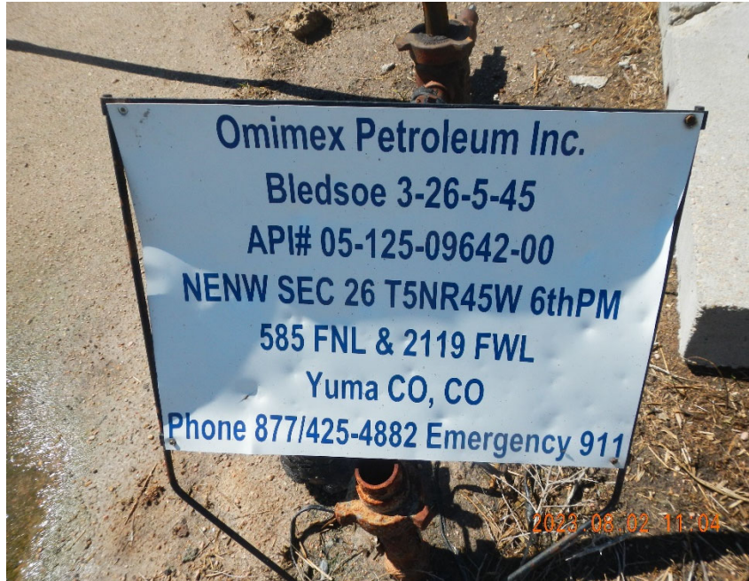
1. Well sign at well location.