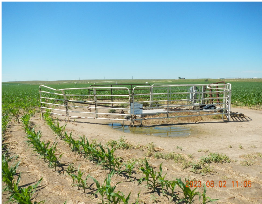
11. Well location overview.