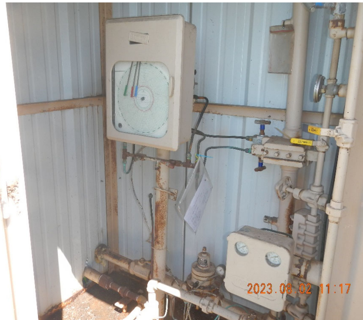
8. Gas Meter inside remote Meter Shed.