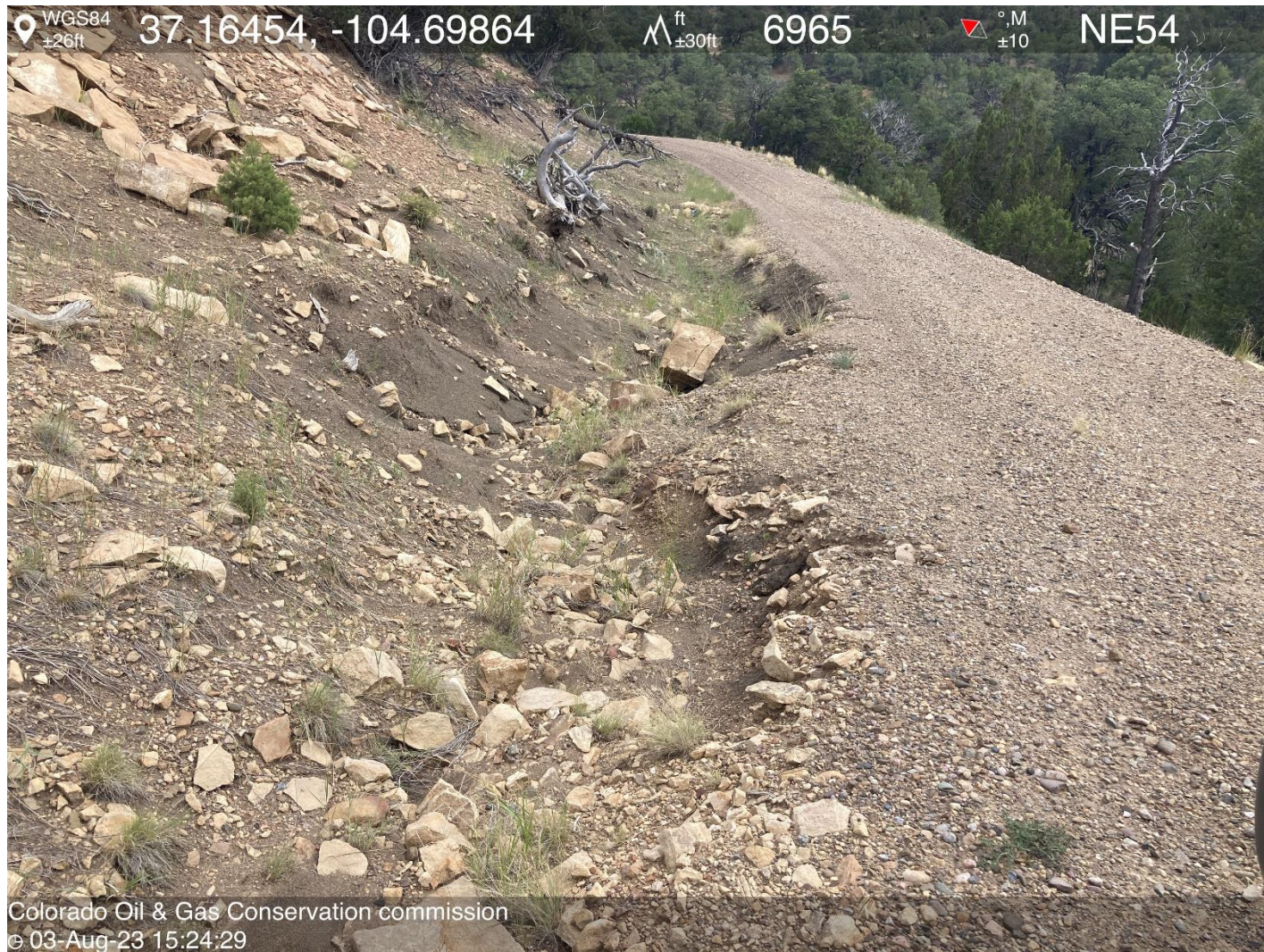
PHOTO 5: STORMWATER IS WASHING OUT DITCH AND ERODING INTO THE ROW EAST OF LOCATION. INSTALL STORMWATER PREVENTION AND MAINTAIN ACCORDING TO RULE 1002. CA DATE 9-3-2023.