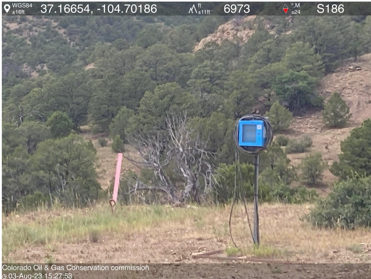
PHOTO 5: UNUSED EQUIPMENT (APPEARS TO BE SOME KIND OF TELEMETRY EQUIPMENT). REMOVE UNUSED EQUIPMENT PER RULE 606. CA DATE 9-3-2023.