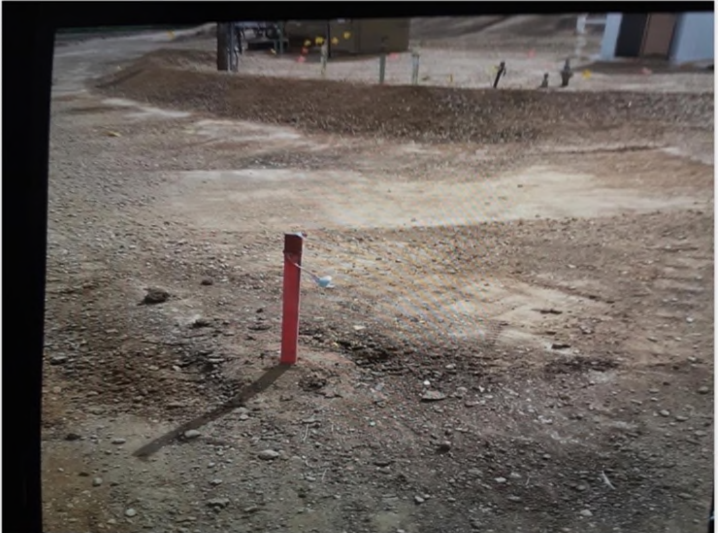
Photo Type Pre-Completion Photo Name Pre-Completion Photo Notes PhotoBlobID