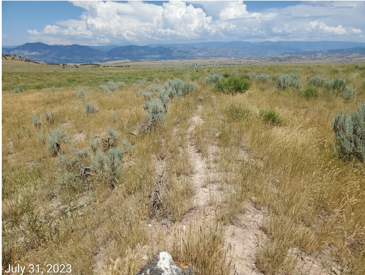
Photo 7: Apparent berm remaining on the southern perimeter of the disturbance.