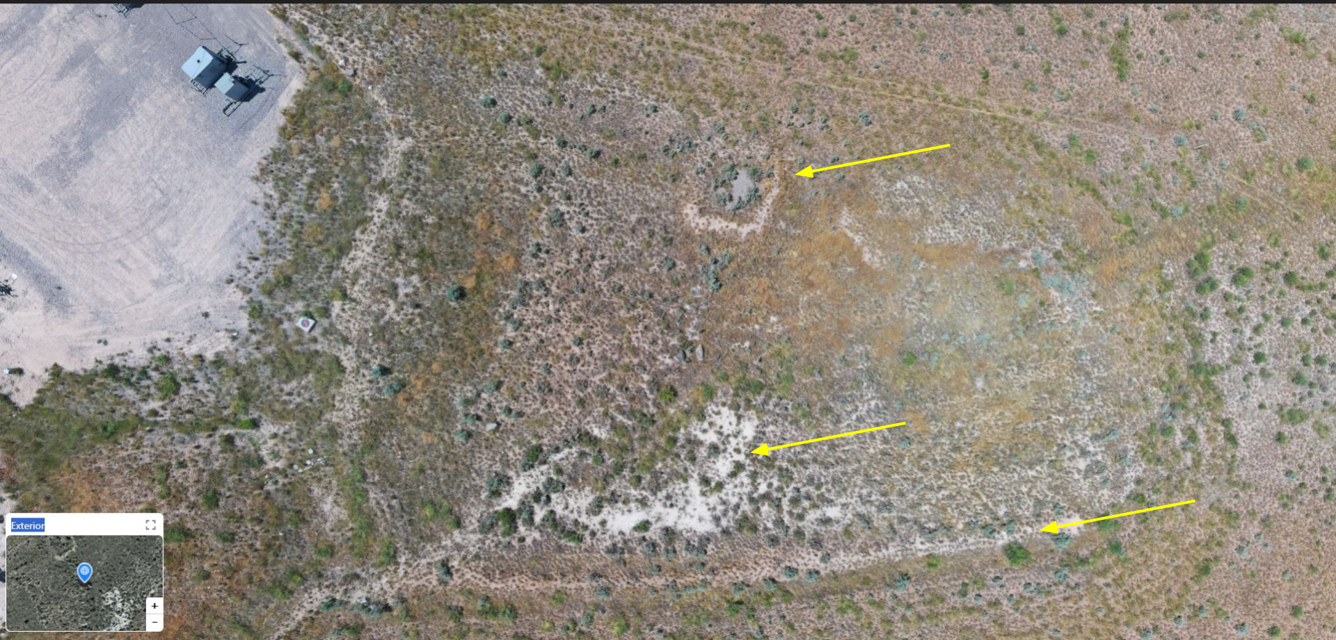
Photo 4: sUAS of the interim areas on the northeast end of the Location. Arrows within image show apparent berm remaining, potentially impacted soils, and gravel within a containment berm where equipment was previously Located.