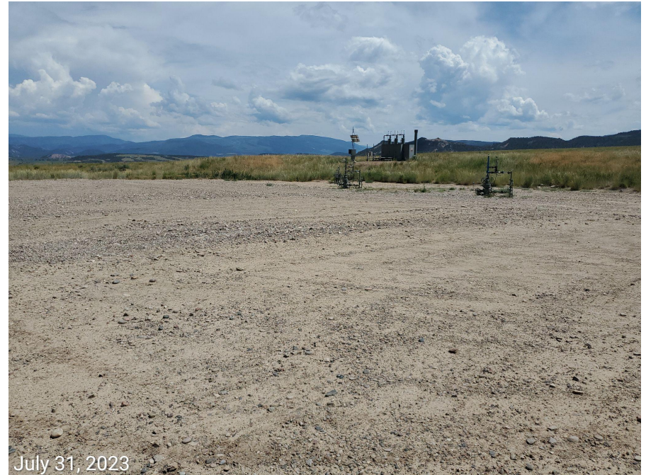
Photo 1: Photos 1-2 taken from the north end of the Location. Photos provide an overview of the location from east, southeast southwest to west.