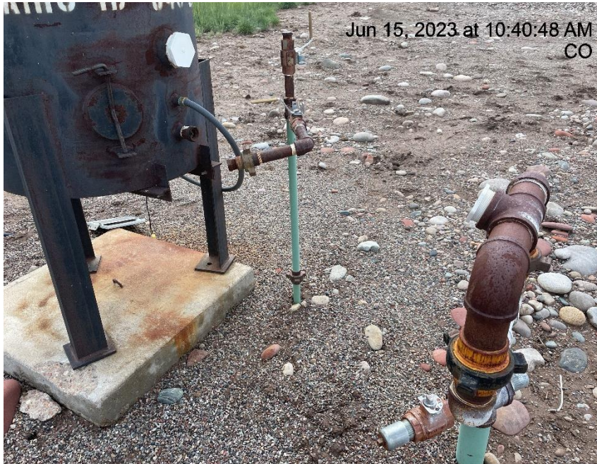
Photo # 595 From inspection 708900778 conducted on 06/15/2023 Unused equipment/ECD is disconnected