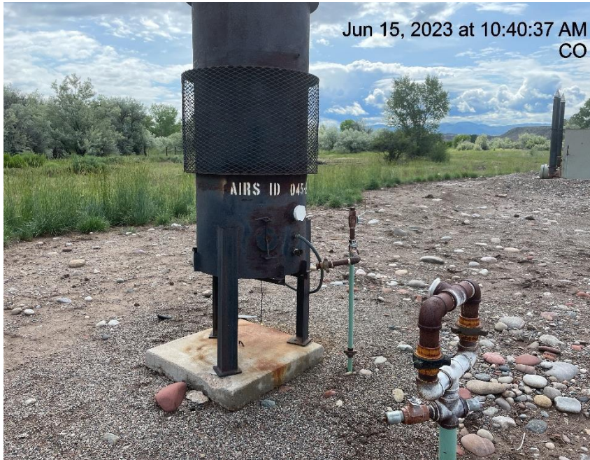
Photo # 594 From inspection 708900778 conducted on 06/15/2023 Unused equipment/ECD is disconnected