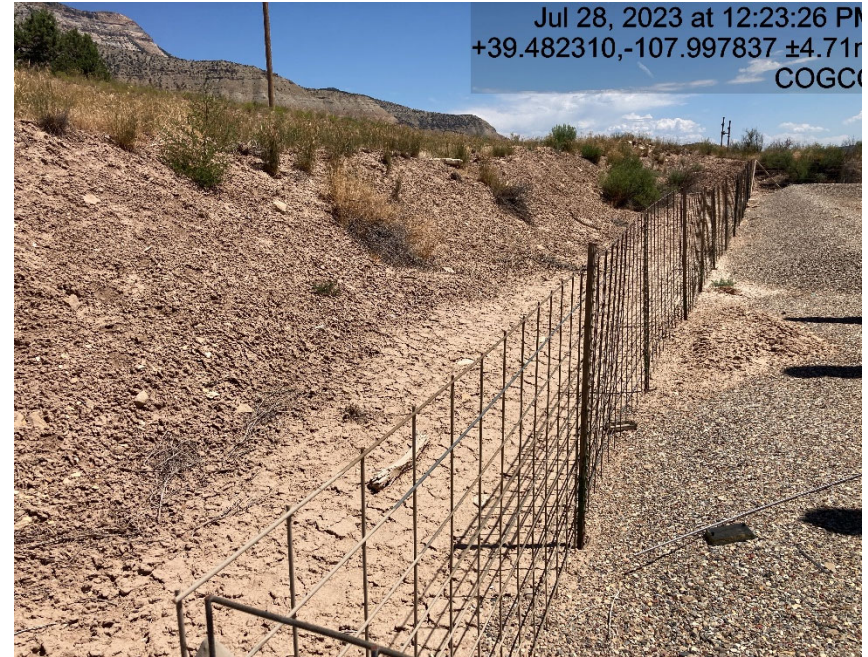
Areas of cut slope need stabilization