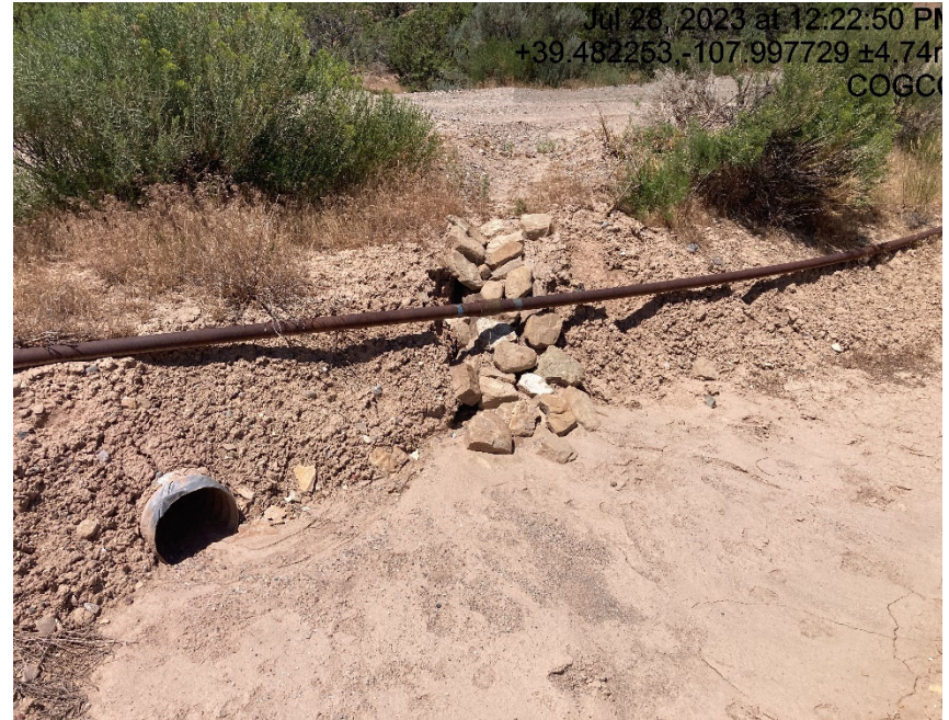
Sediment trap and BMP's need maintained