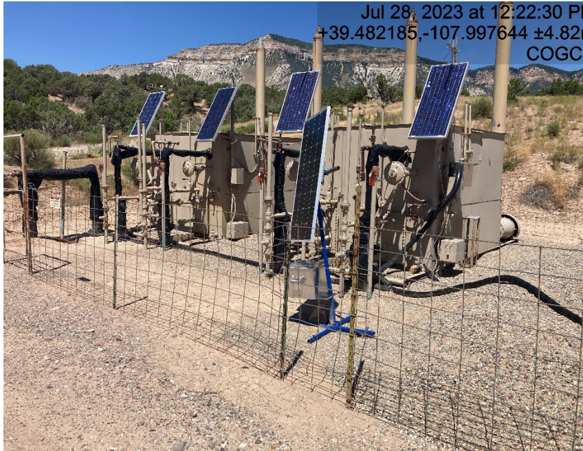
Separators and lack of access to calibration cards