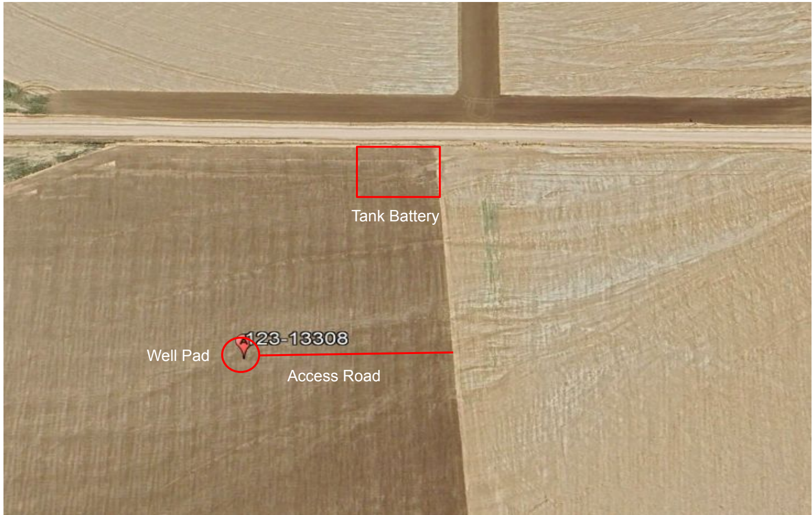
Photo 1. 2023 aerial imagery of the well pad, access road and tank battery (north is up).