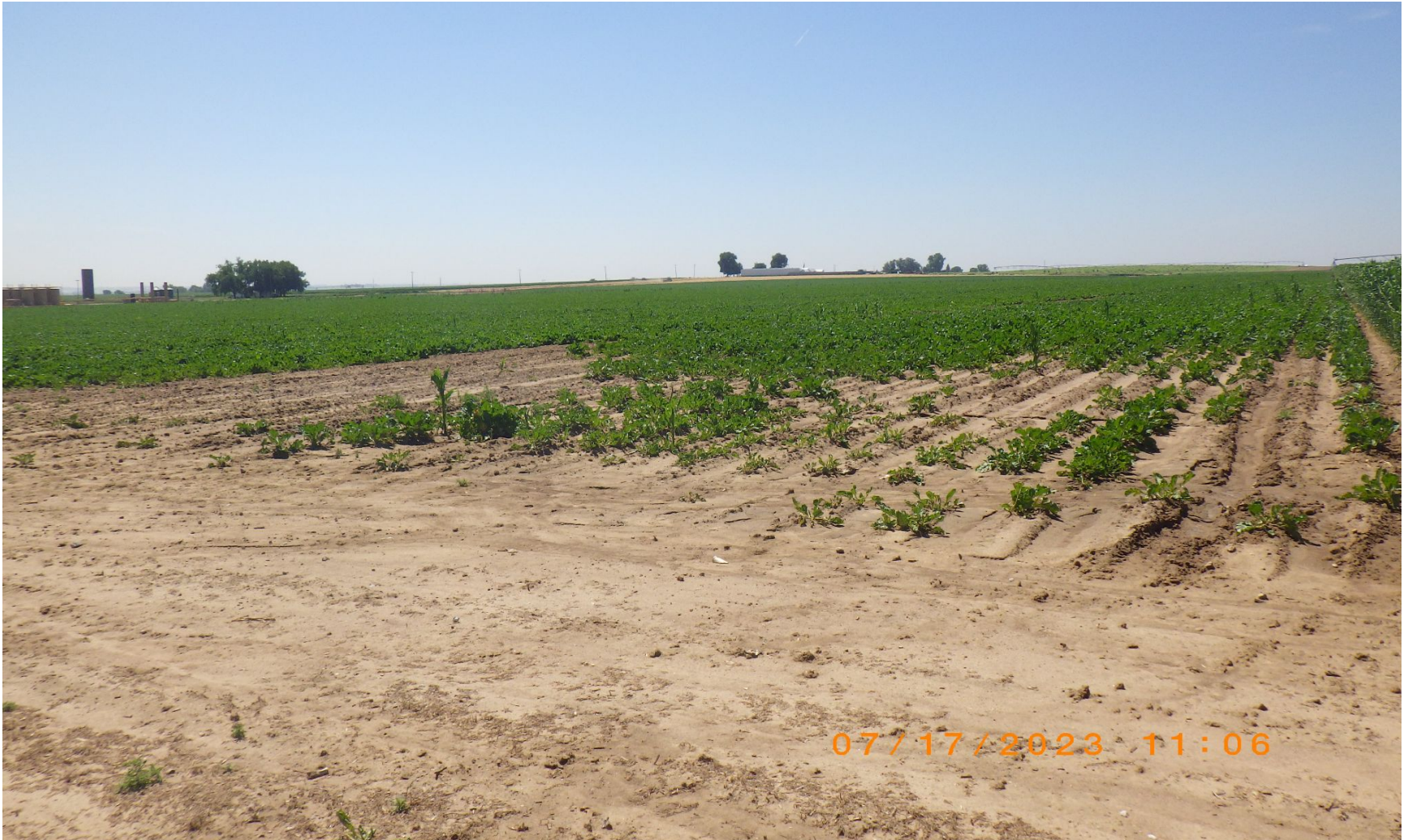
Photo 4. Overview photo of the tank battery taken at ground level from the northern edge facing south.