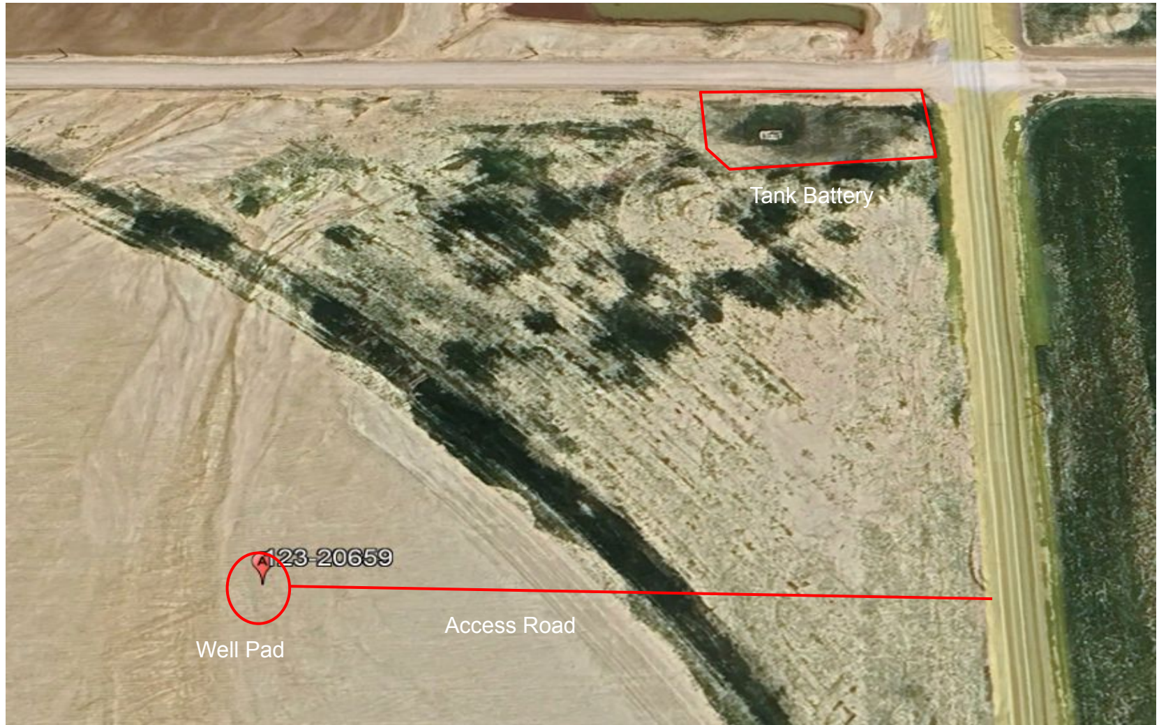
Photo 1. 2023 aerial imagery of the well pad, access road and tank battery (north is up).