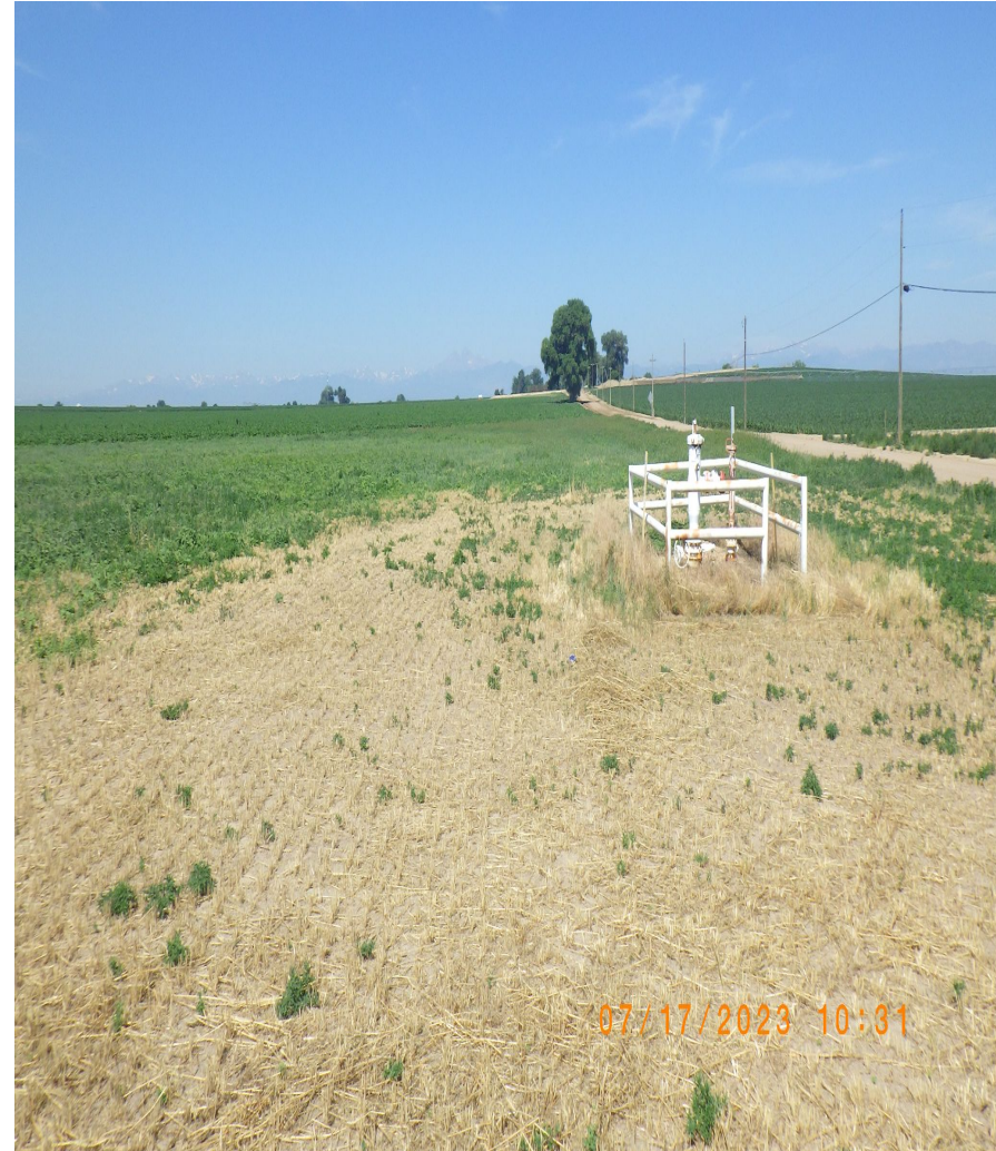
Photo 5. Cardinal photos taken from the middle of the tank battery. Left photo facing south, right photo facing west. Photo shows that the operator failed to remove risers at the location.