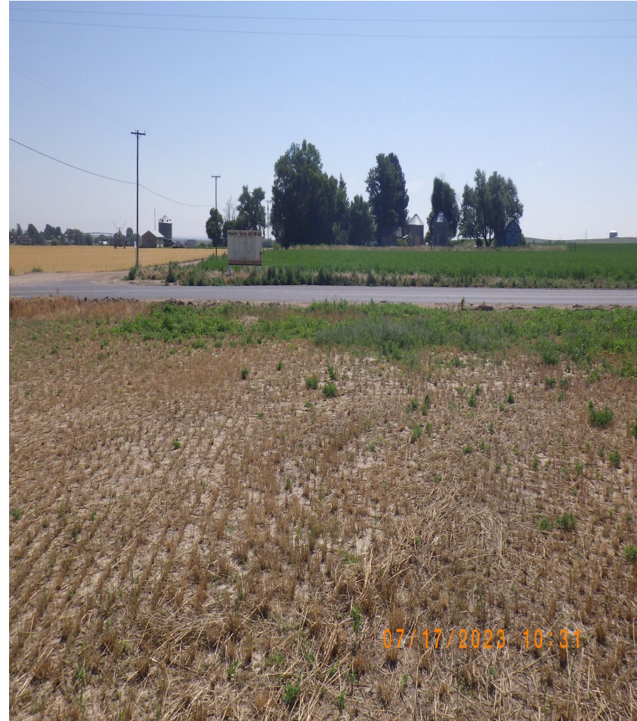
Photo 4. Cardinal photos taken from the middle of the tank battery. Left photo facing north, right photo facing east.