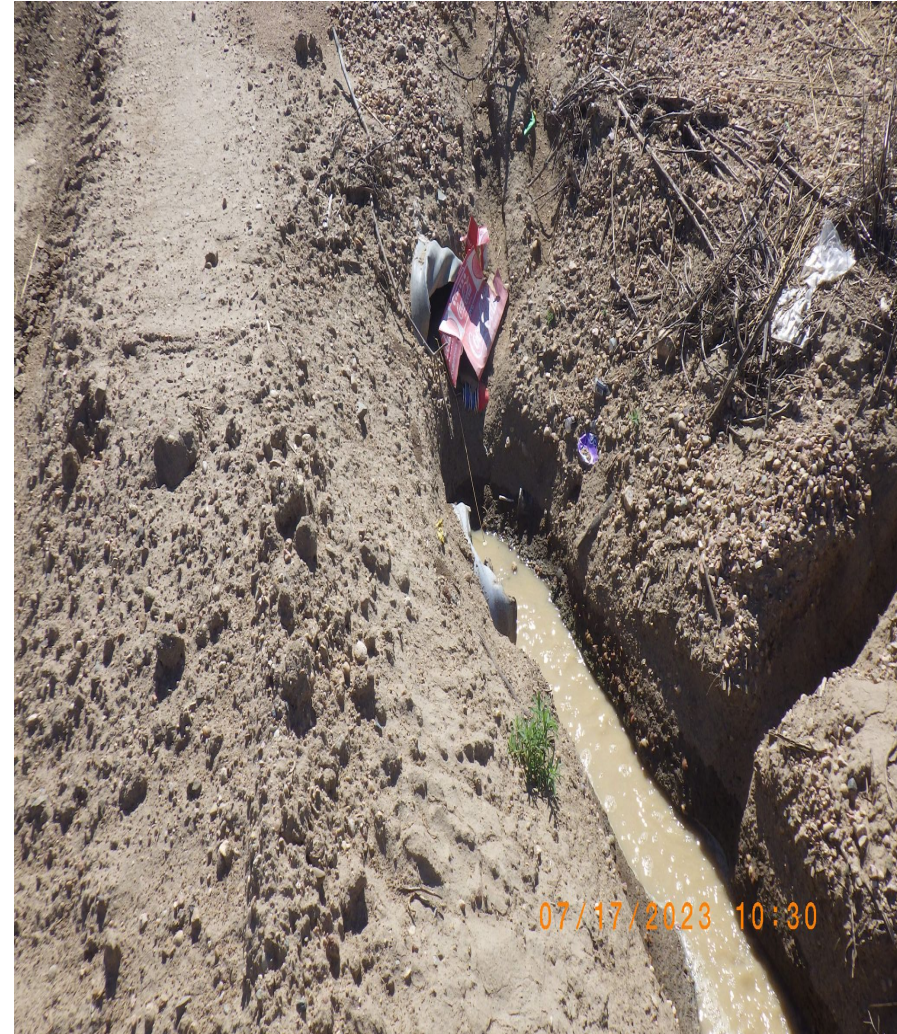
Photo 6. Photos of the tank battery access point and culvert. Photo shows that the operator failed to reclaim the access point and remove culverts.