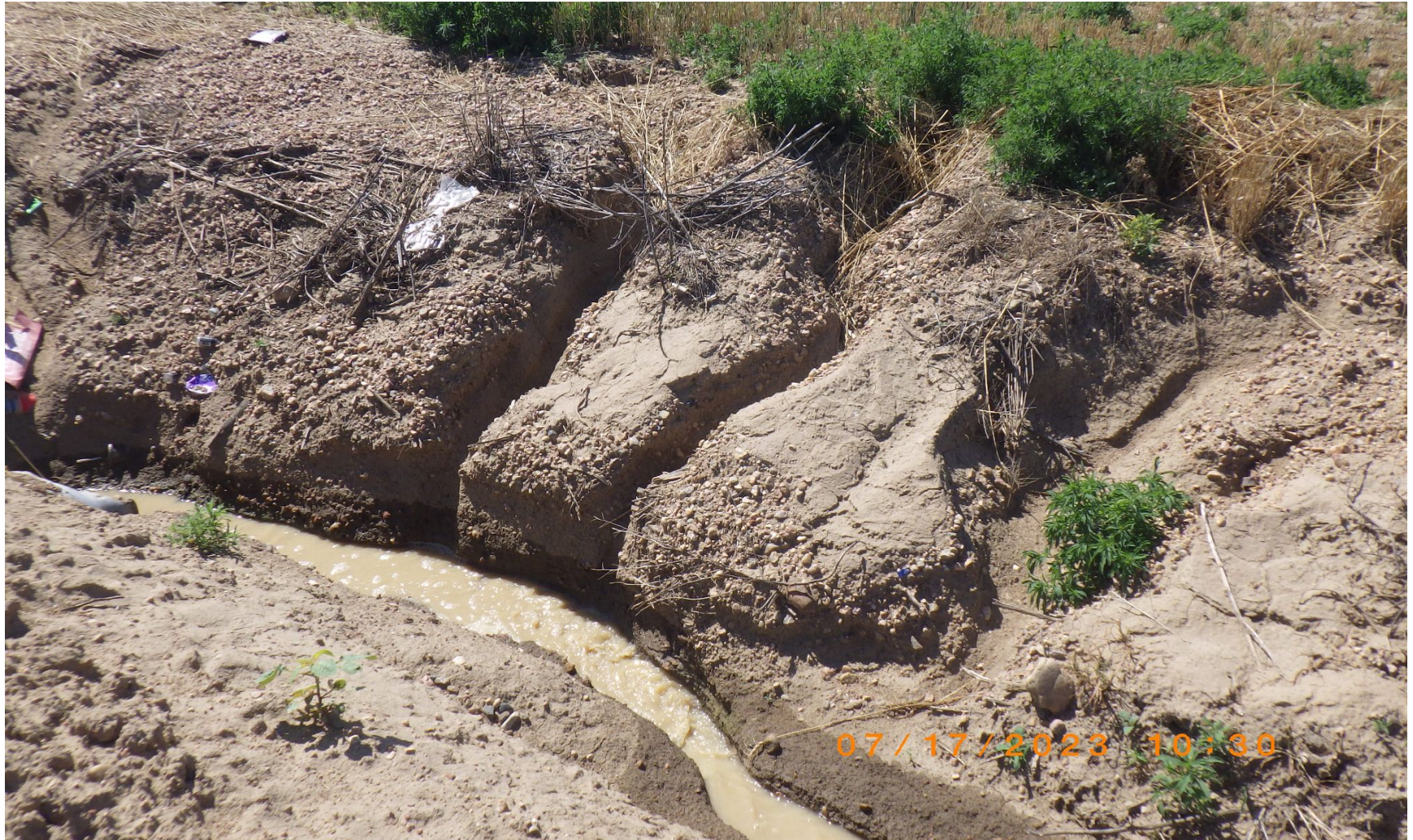
Photo 7. Stormwater erosion observed along the northern edge of the tank battery.