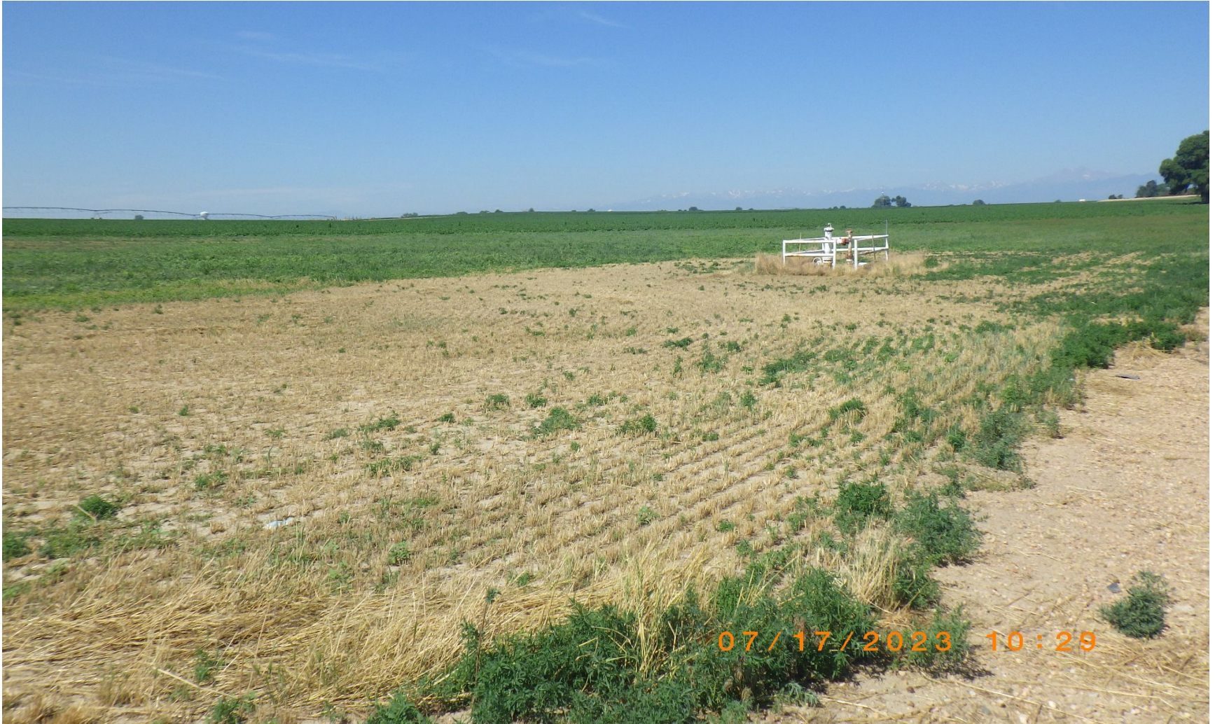
Photo 3. Overview photo of the tank battery taken at ground level from the northern edge facing southwest.