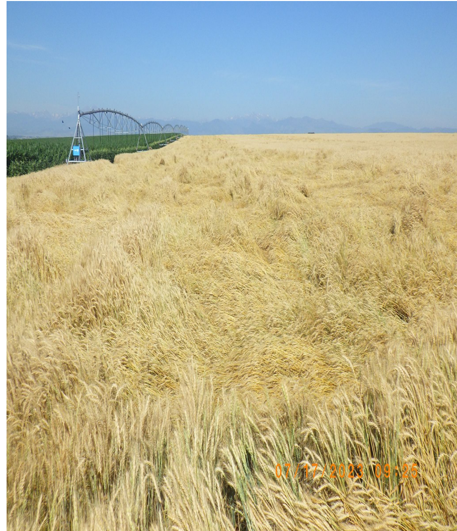
Photo 5. Cardinal photos taken from the middle of the well pad. Left photo facing south, right photo facing west. Note: photo shows that the well pad appears consistent with adjacent reference area (see photo 6).