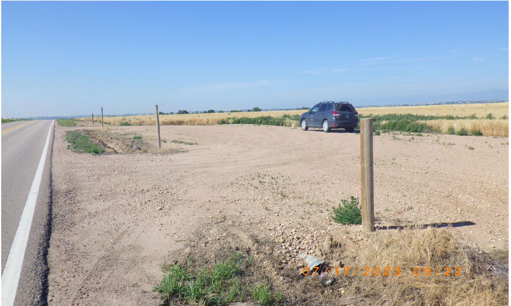
Photo 2. Overview photo of the tank battery. Photo shows that the operator has failed to perform final reclamation activities. Gravel, access points and culverts remain on location.