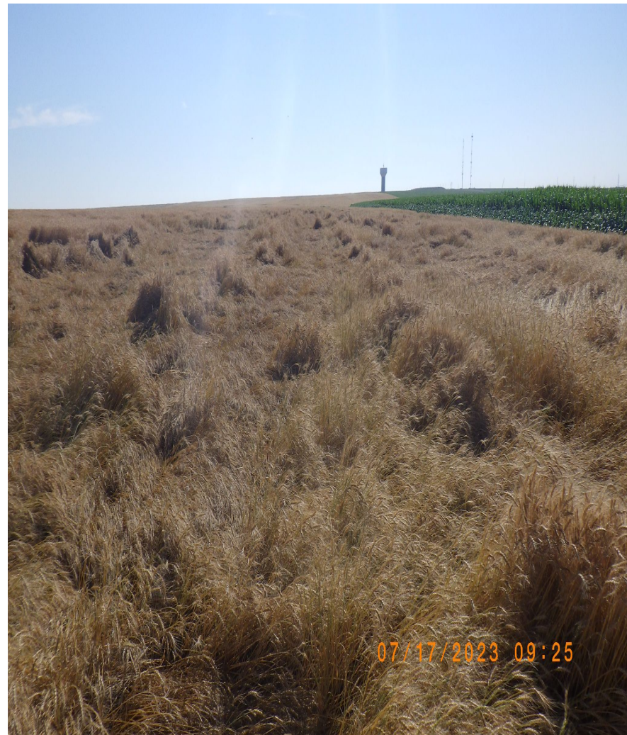
Photo 4. Cardinal photos taken from the middle of the well pad. Left photo facing north, right photo facing east.