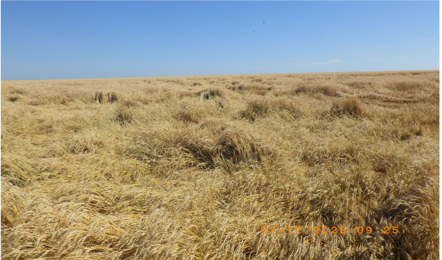
Photo 3. Overview photo of the well pad taken at ground level from the southern edge facing north.