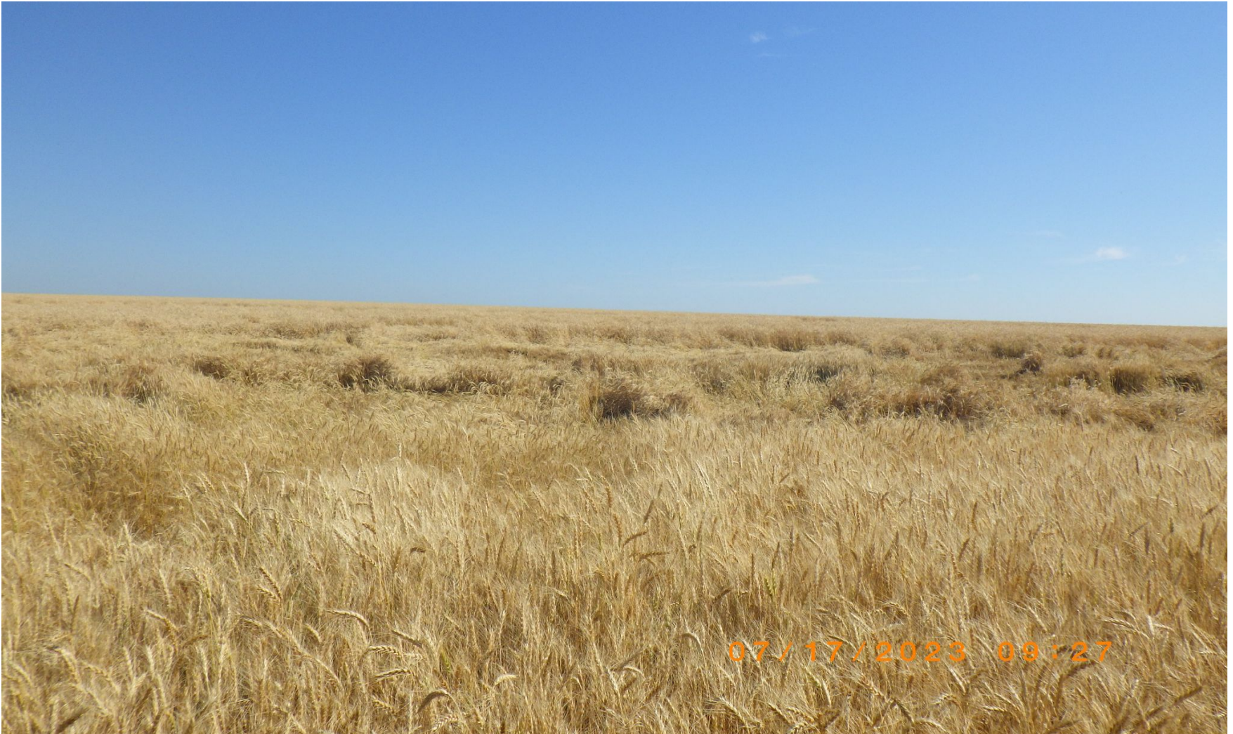
Photo 6. Reference area.