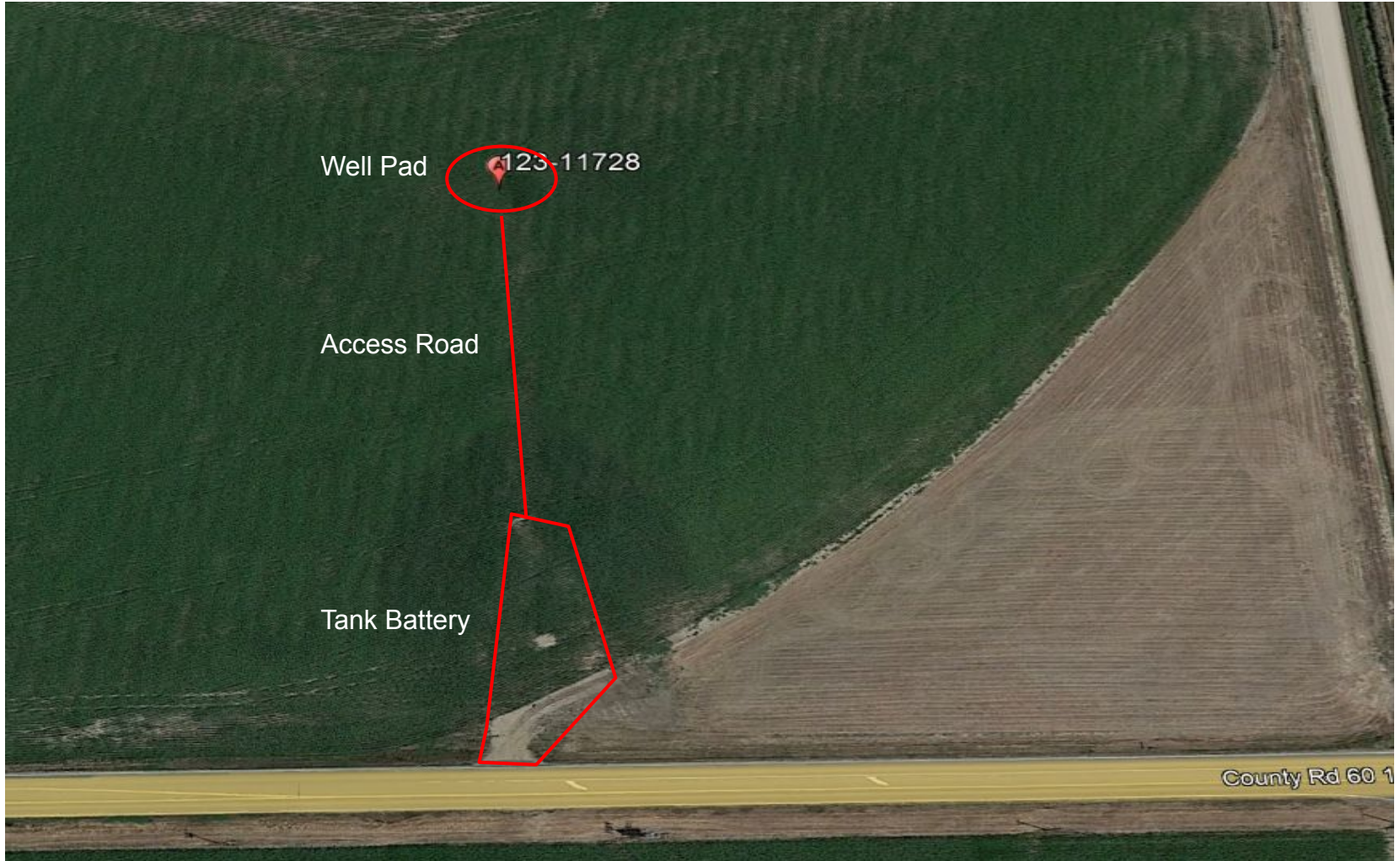
Photo 1. 2023 aerial imagery of the well pad, access road and tank battery (north is up).