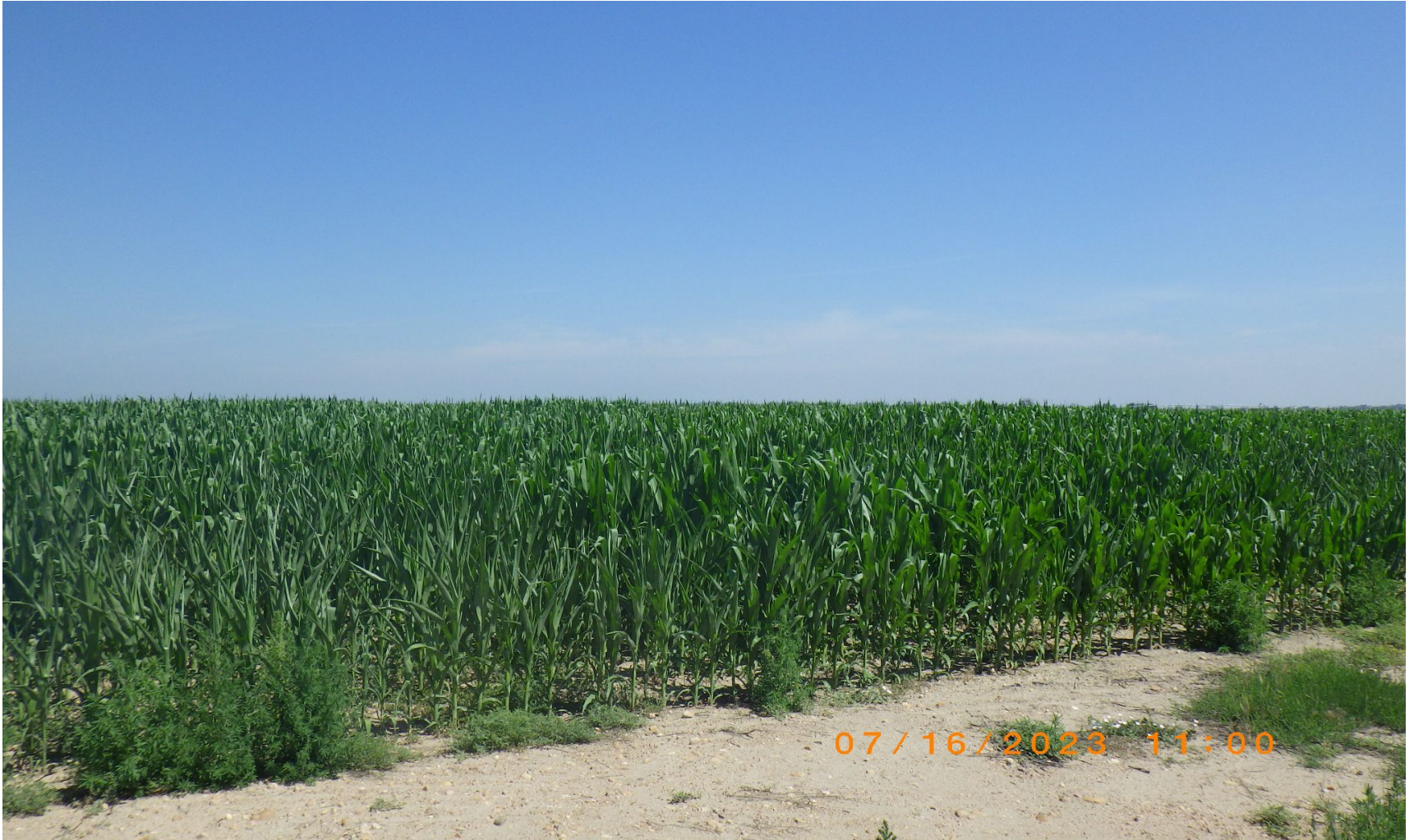
Photo 3. Ground photo of the well pad access field taken from the southern edge of the tank battery.