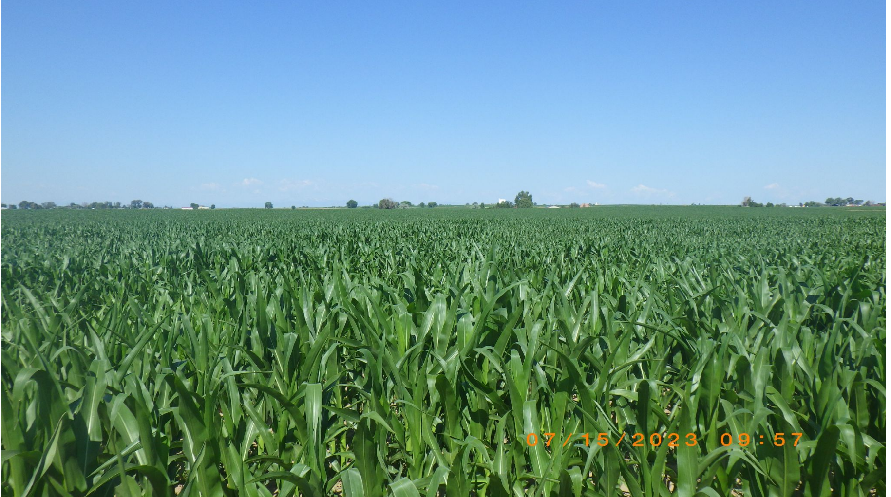
Photo 3. Overview photo of the well pad and tank battery crop field taken at ground level from the eastern edge of the tank battery facing west.