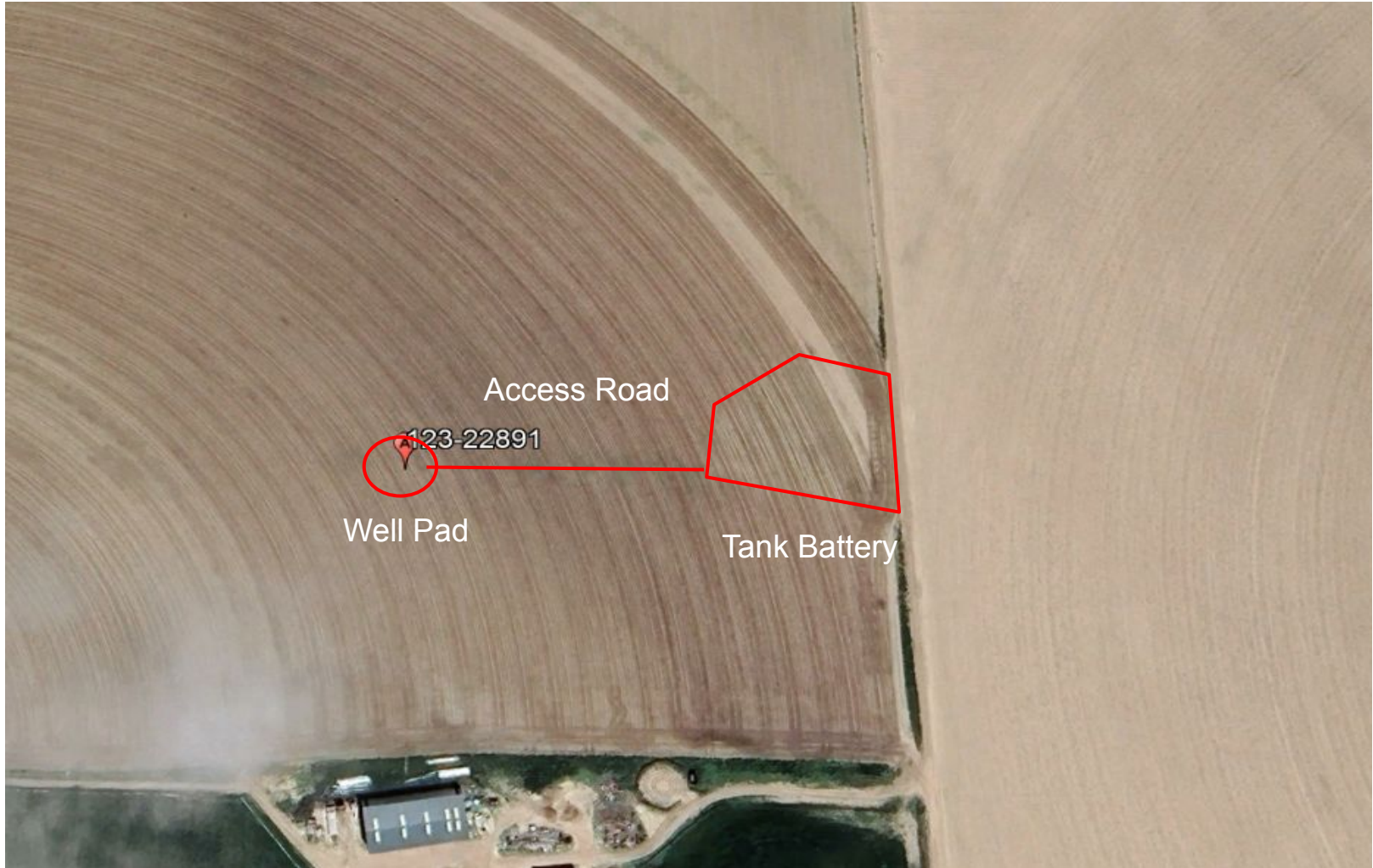
Photo 1. 2023 aerial imagery of the well pad, access road and tank battery (north is up).