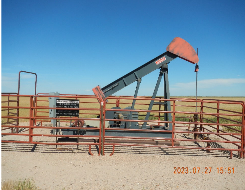
3. Well location overview.