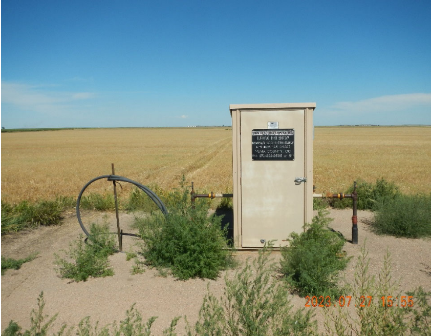
5. Remote Gas Meter location overview.