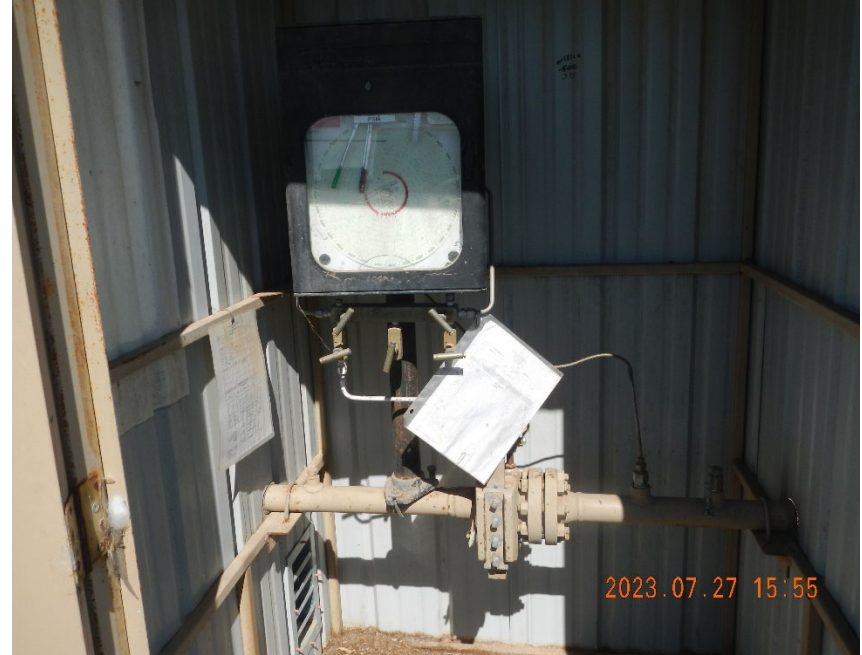
6. View of Gas Meter Run inside Meter Shed.