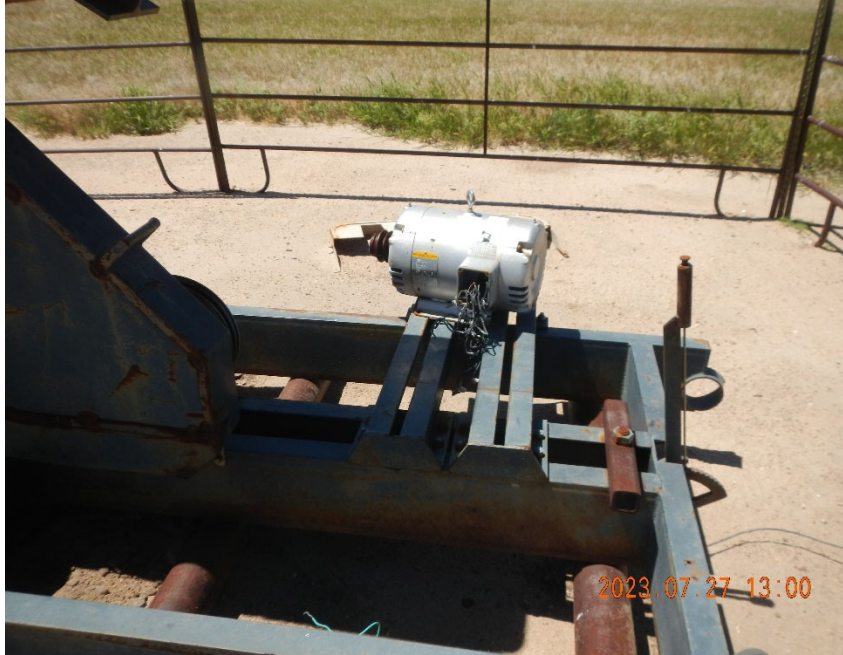
3. Electric motor wired to power but not mounted to Pump Jack base.