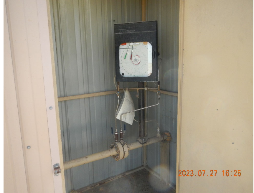
8. Gas Meter Run inside Meter Shed.