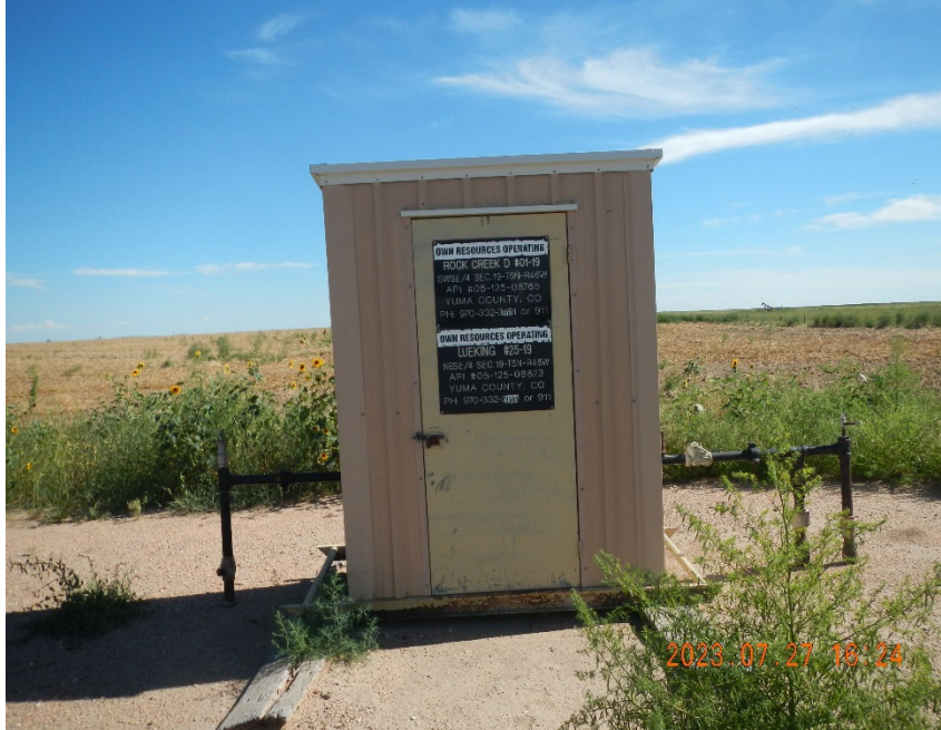
7. View of remote Gas Meter Run.