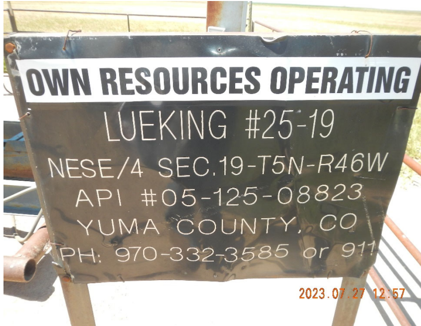
1. Well sign at well location.