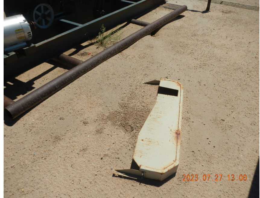
4. Pump Jack belt guard on ground inside fencing.