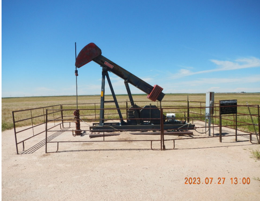
5. Location overview.