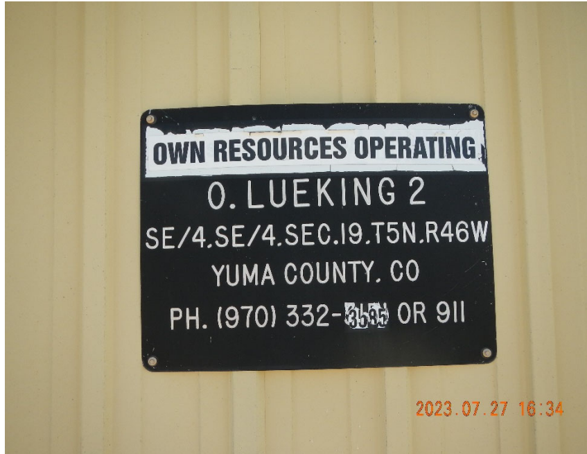
5. Well sign at remote Gas Meter Run.