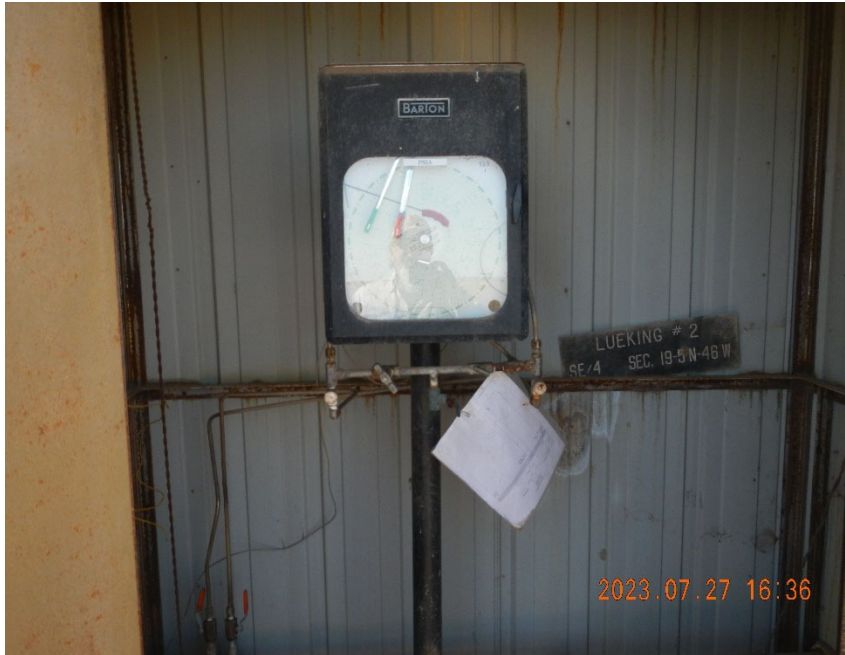
7. Gas Meter Run inside Meter Shed.