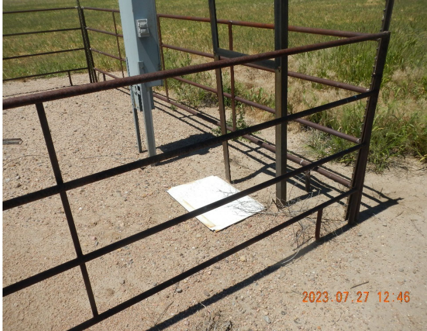
1. Well sign out of sign bracket and facedown on the ground.