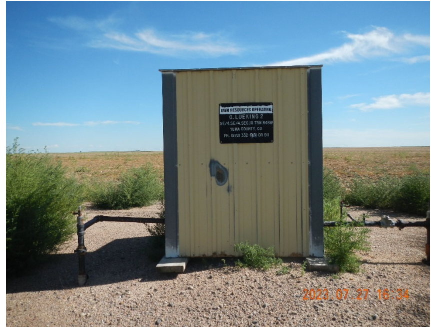
6. Meter Shed.