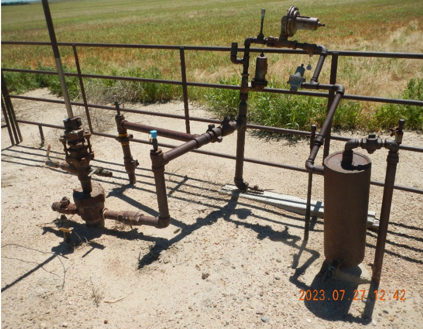
3. View of Wellhead.