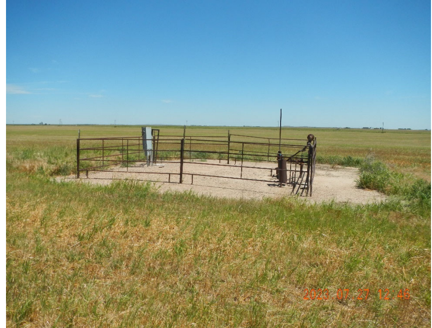
4. Location overview.