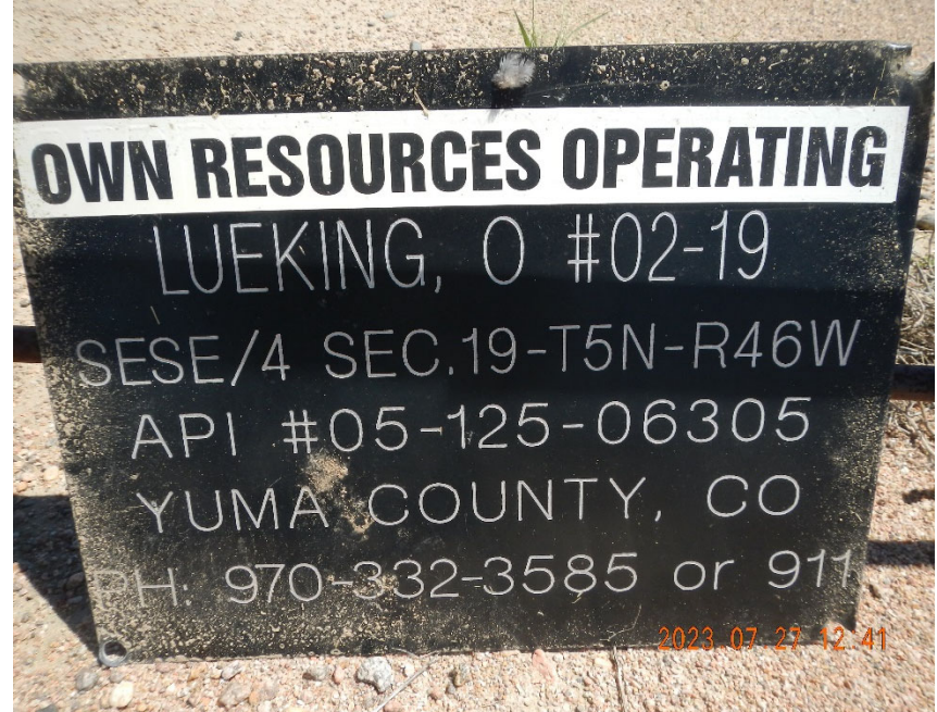
2. Well sign photo propped against fence by inspector.