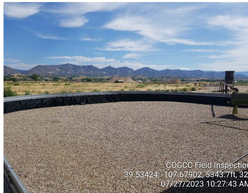
Photo #4 – View into north end of tank battery secondary containment area.