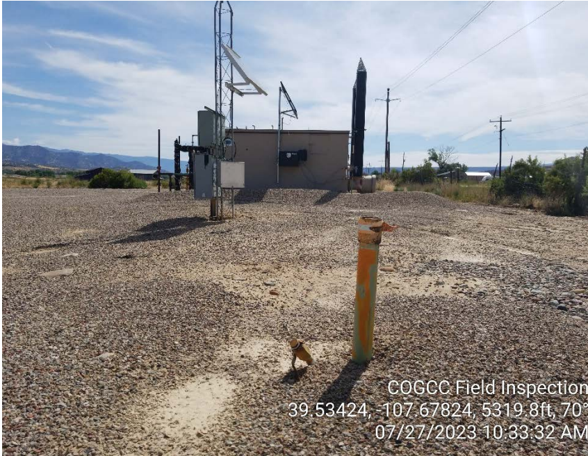
Photo #11 – Marked, unused flowline risers located west of separators.