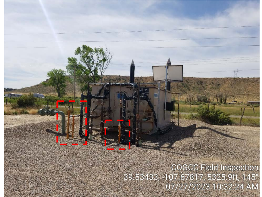
Photo #10 – Separators in southeast corner of pad. Red boxes denote locations of unused flowline risers.