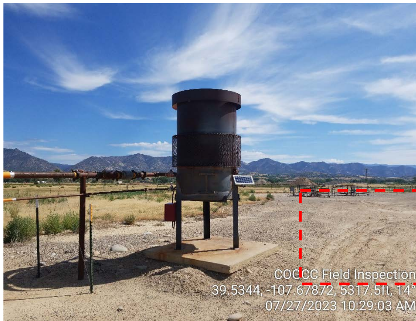
Photo #5 – Emissions Control Device. Note, red box denotes stabilization and compaction issues remaining from previous inspection (doc #707800316).