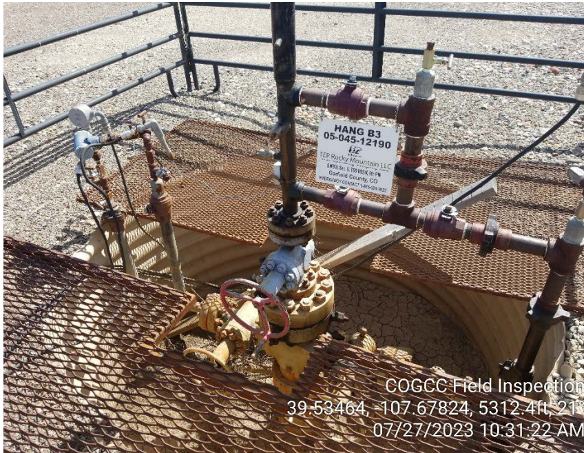
Photo #7 - Hangs B3 wellhead, note absence of fluid inside of well cellar.