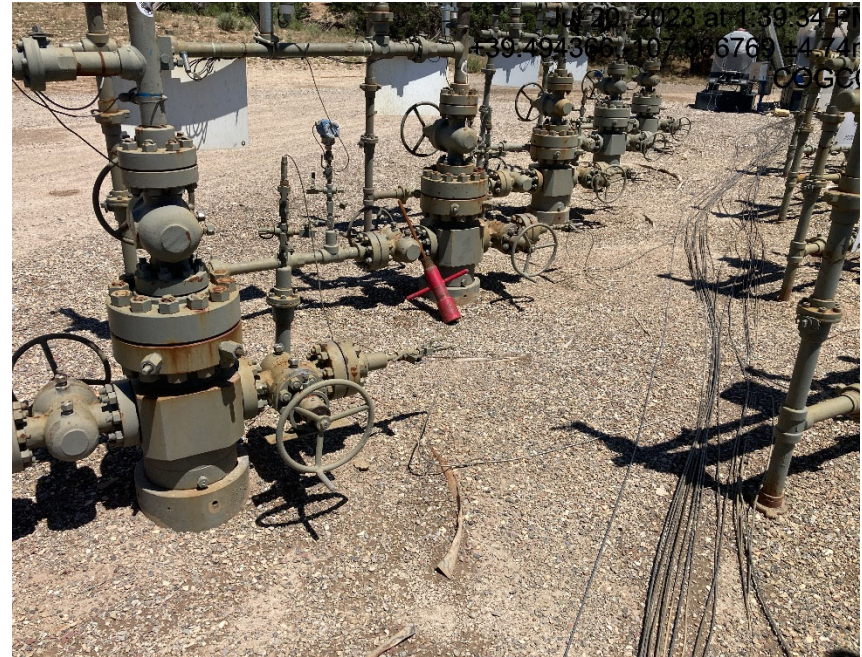
Debris/ unused equipment