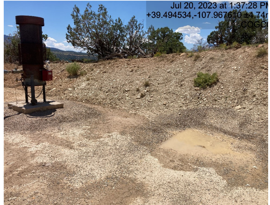
Cut slope not stabilized nor BMPs in place