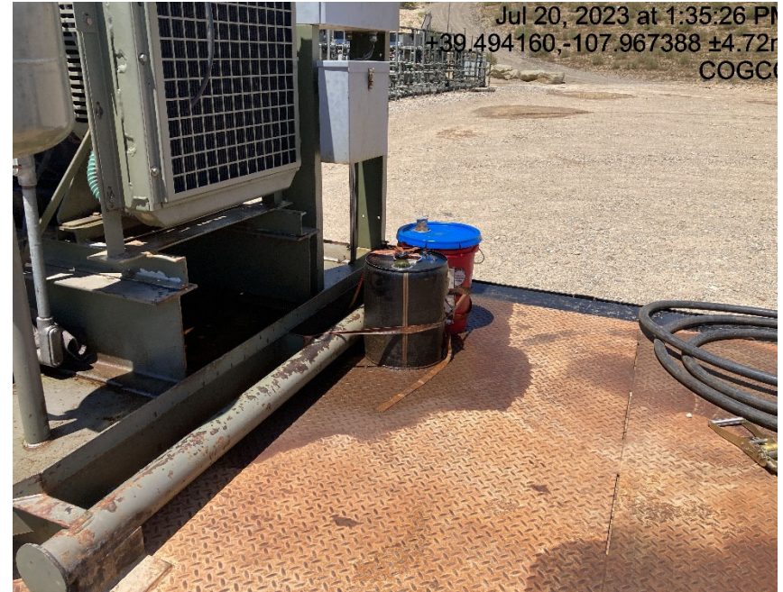
Leaking buckets of unknown fluid