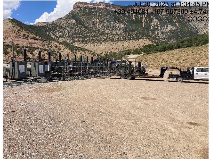
Separators and calibration cards not conspicuous