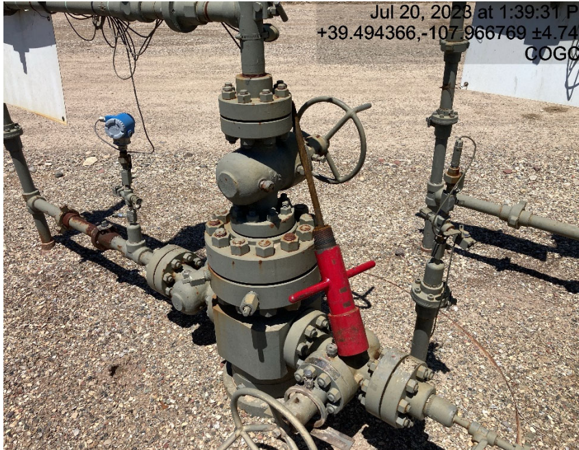
Debris/ unused equipment