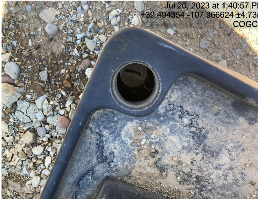
Chemical containment full of fluid