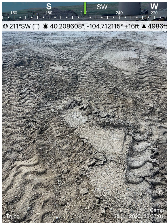
Background Sample Location