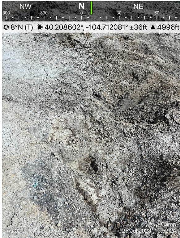
AST 02 Excavation