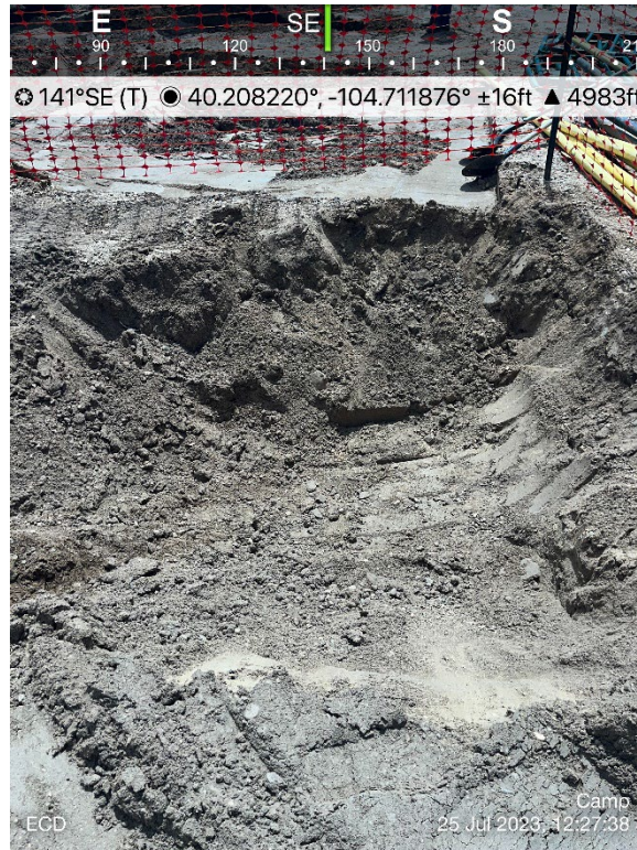
Emissions Control Device (ECD) Footprint