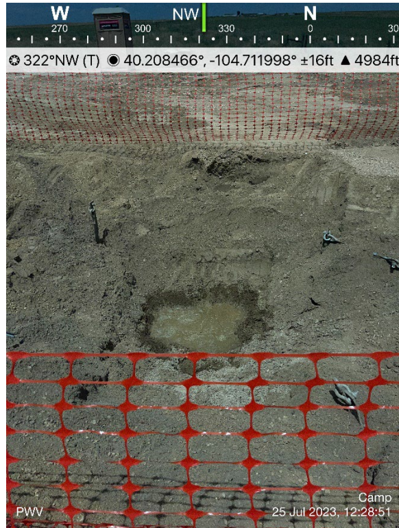
Produced Water Vessel (PWV) Excavation Rainwater Present in Excavation