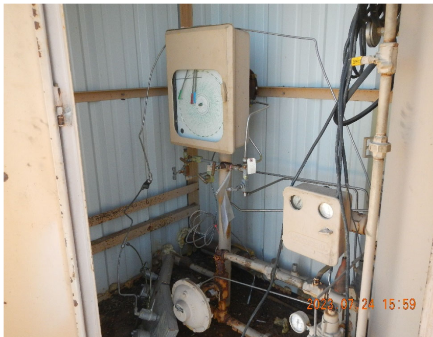
5. View of Gas Meter Run inside Meter Shed.