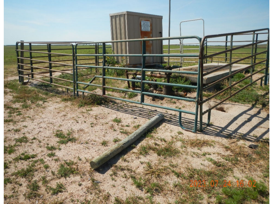
10. Fence post outside of fencing.