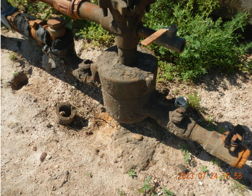
3. Closer view of wellhead.