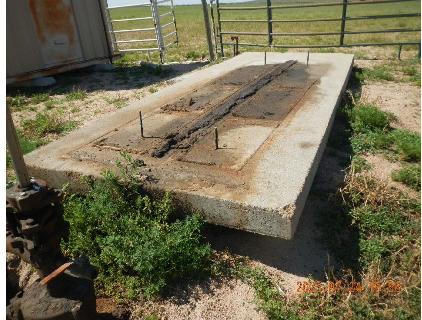
4. Concrete pad with lube oil staining and accumulated strip down center. Impacted soils around pad.