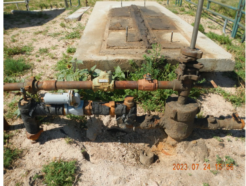
2. View of wellhead. Note impacted soils around wellhead and lube oil staining on cement pad.