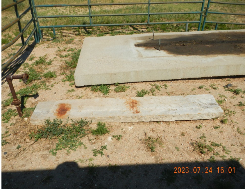
9. Wooden cribbing plank and cement pad inside fencing.