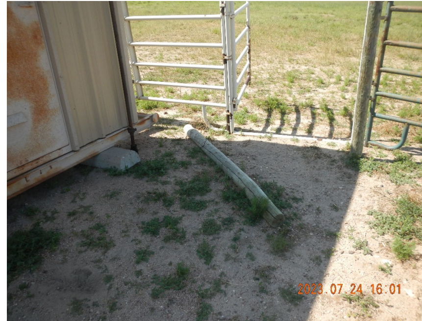
8. Fence post inside fencing.