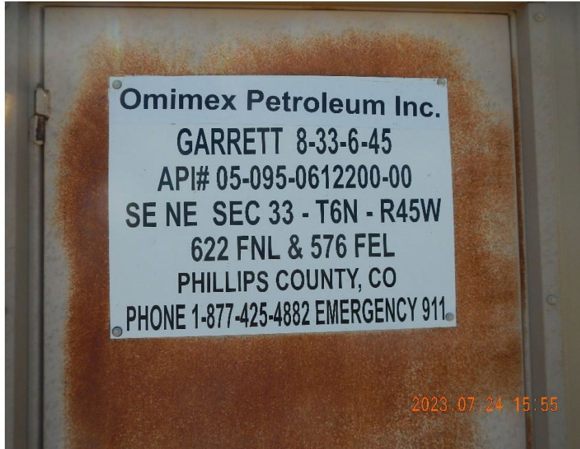
1. Well sign located on Meter Shed door.