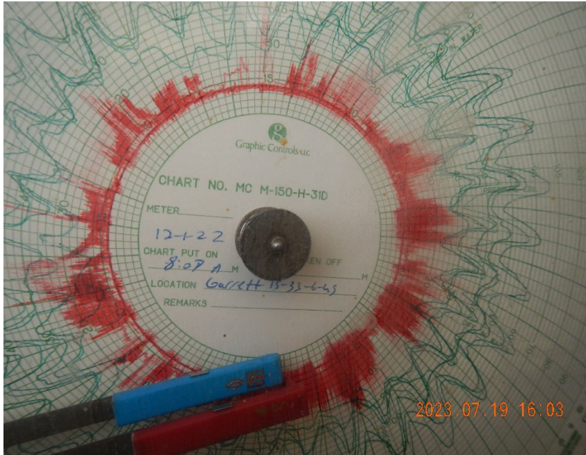
7. Meter chart in meter box at time of inspection dated 12-1-22.