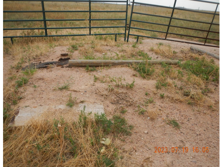
8. Additional view inside well site fencing. Stained soils, production related debris, concrete pad.