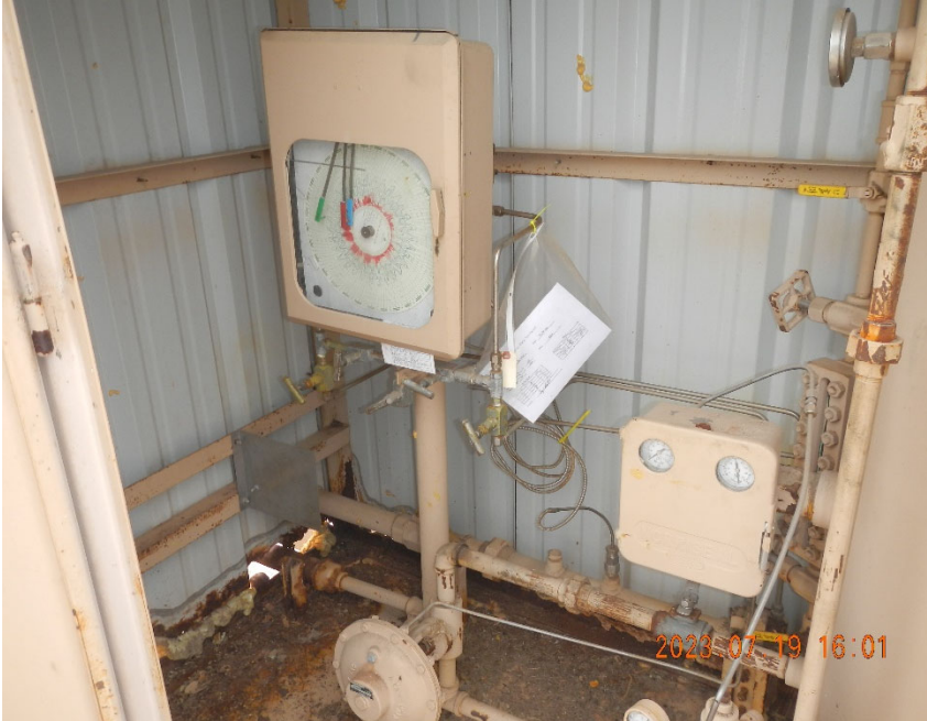
5. View of gas meter run inside meter shed.