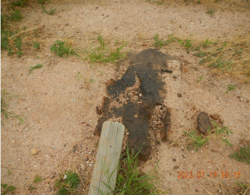
9. Oily staining inside well fencing.