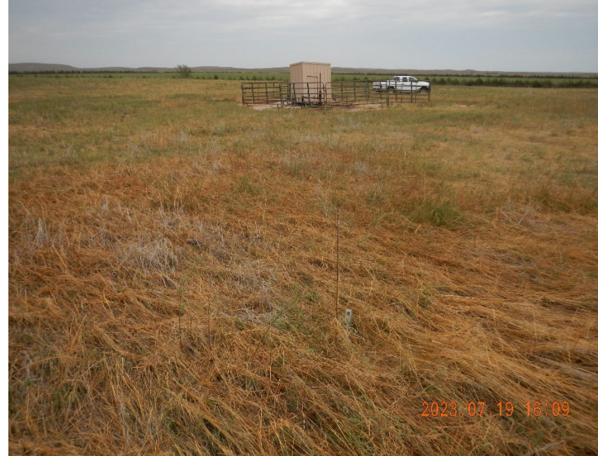
10. One of the four anchors located that require additional marking to comply with rule.