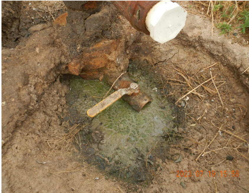
3. Water that has collected around base of wellhead with oily sheen.