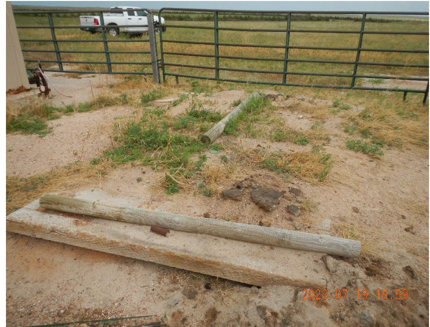
4. Concrete pad with lube oil staining and chunks as identified in pervious inspection still present. Note debris and trash inside fencing.