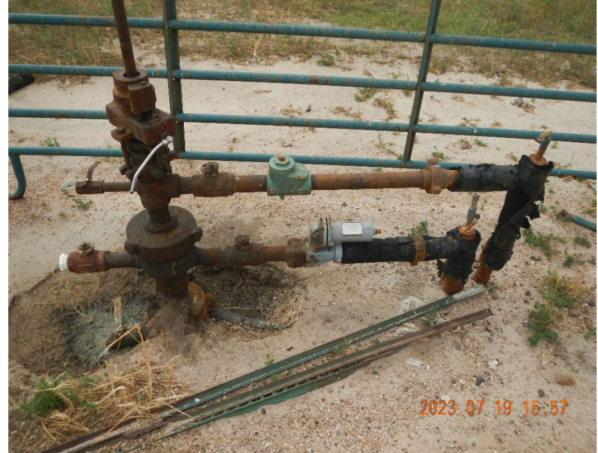
2. View of wellhead. Note soil staining around base of wellhead. Note T Post left at site.