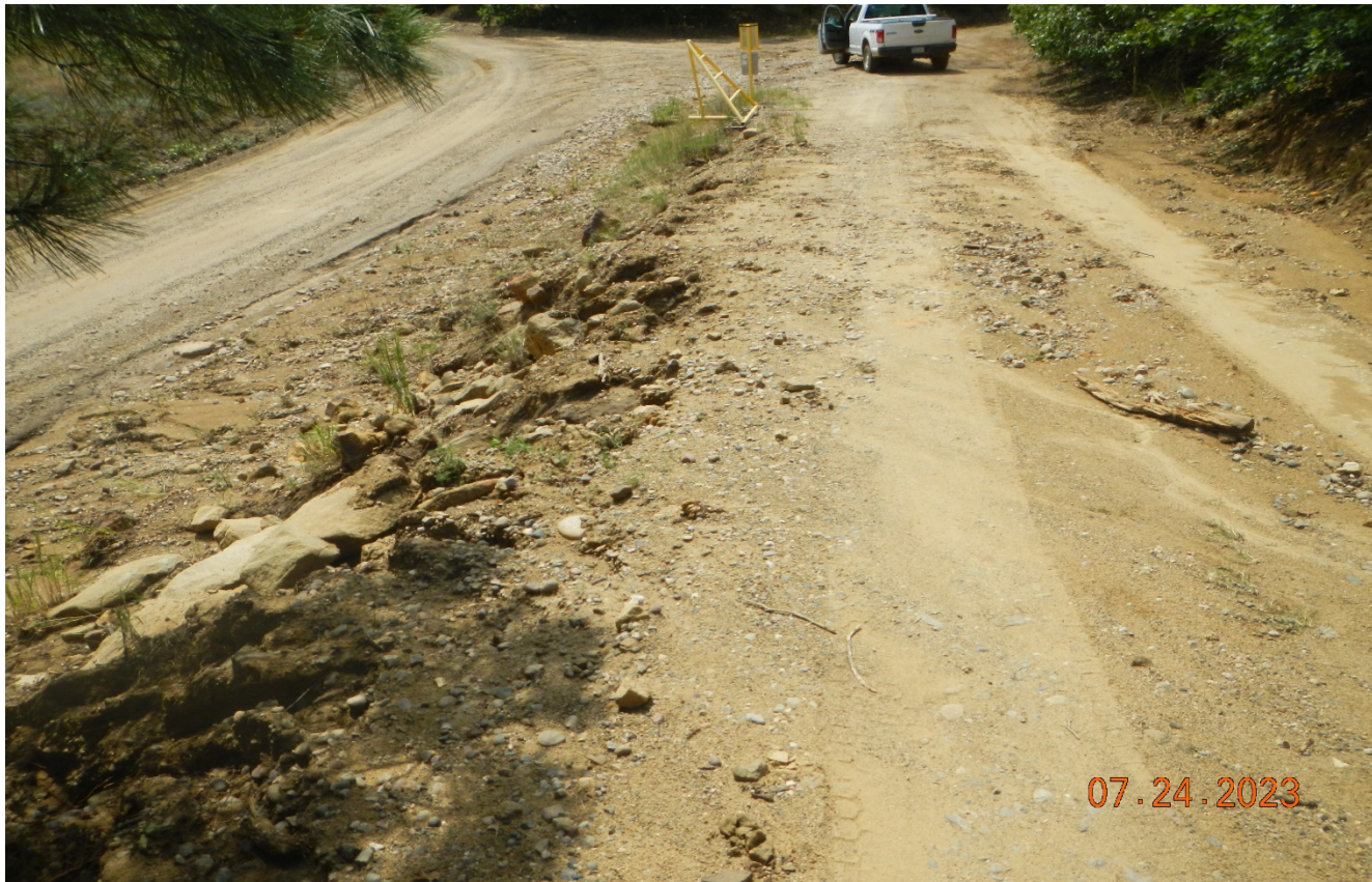
Photo 2. Facing back at the access road where erosion is occurring off the roadside.