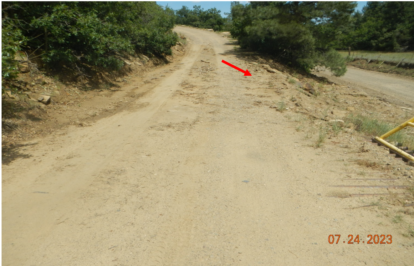
Photo 1. Facing east at the access road. There is erosion across the road at red arrow transporting sediment towards the County Road. The cattle guard is filled in with sediment.