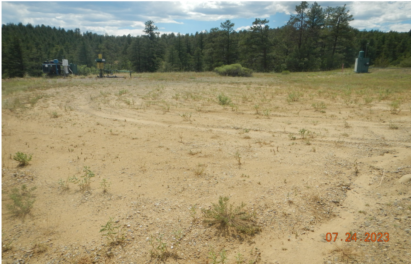
Photo 3. Facing west toward the location.