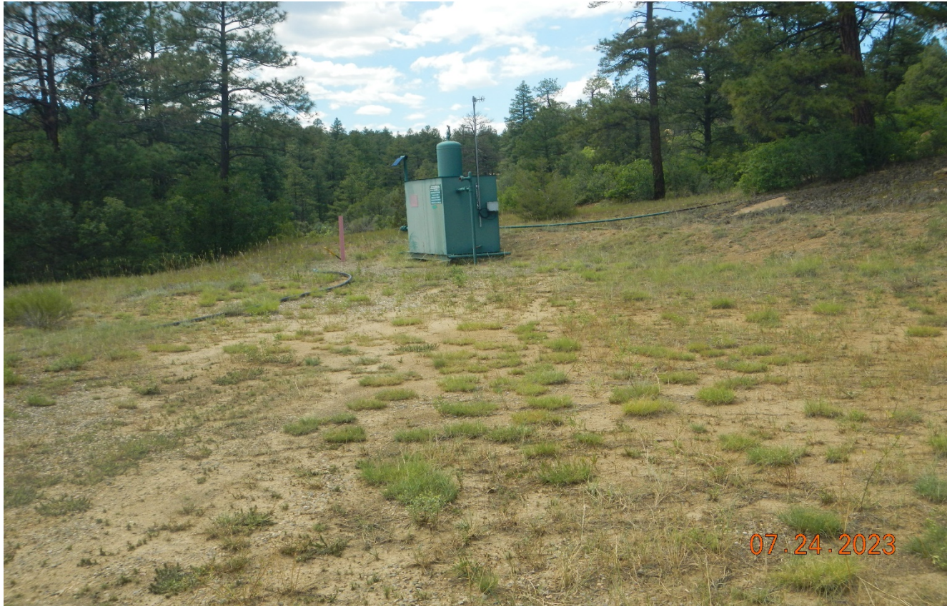
Photo 5. Well sign posted at meter shed.