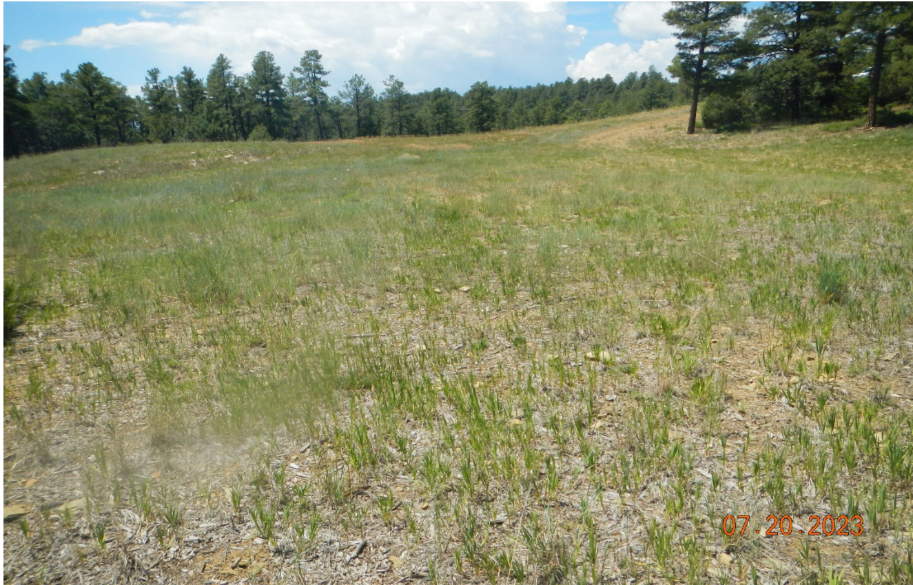
Photo 9. Northeast side of the location facing southwest. Perennial vegetation is well established in this area.