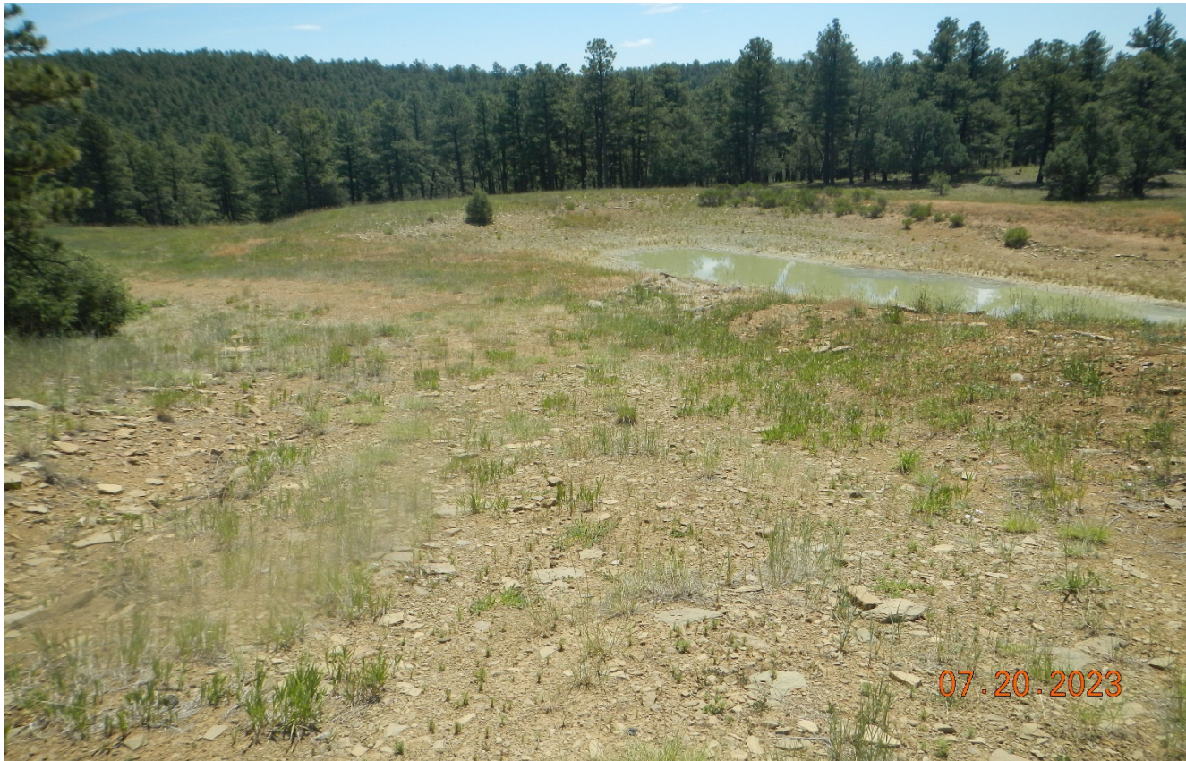
Photo 3. Facing southeast toward the location and pit that remains.