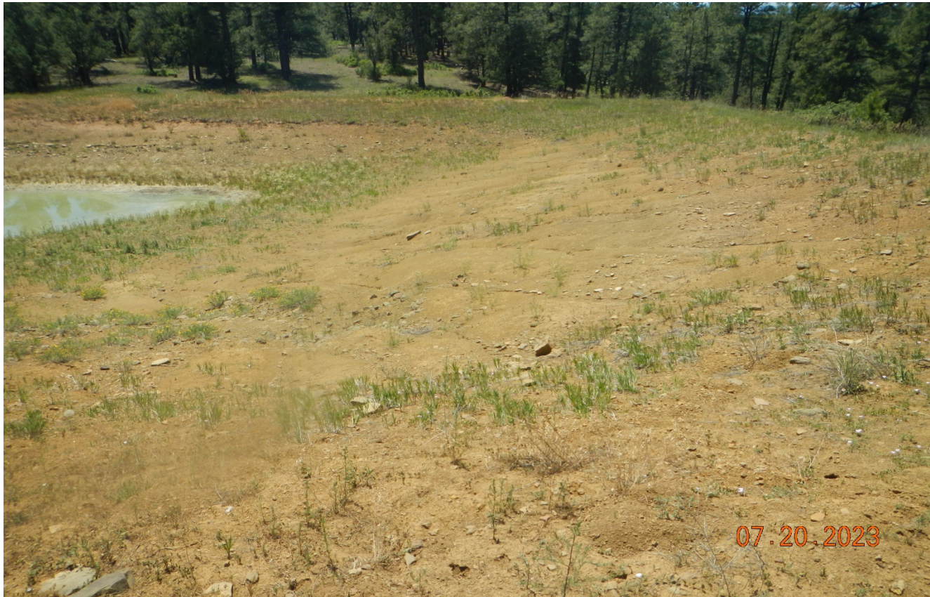
Photo 4. The west side of the pit is bare of vegetation and has signs of erosion. This area needs to be reseeded and stabilized.