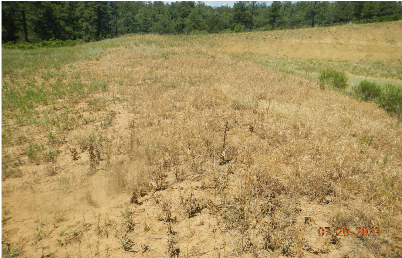
Photo 7. South side of the pit facing west. There are noxious weeds in this area that are wilted and appear to have been controlled. There is Canada thistle and Cheat grass in this area. This area needs to be reseeded.