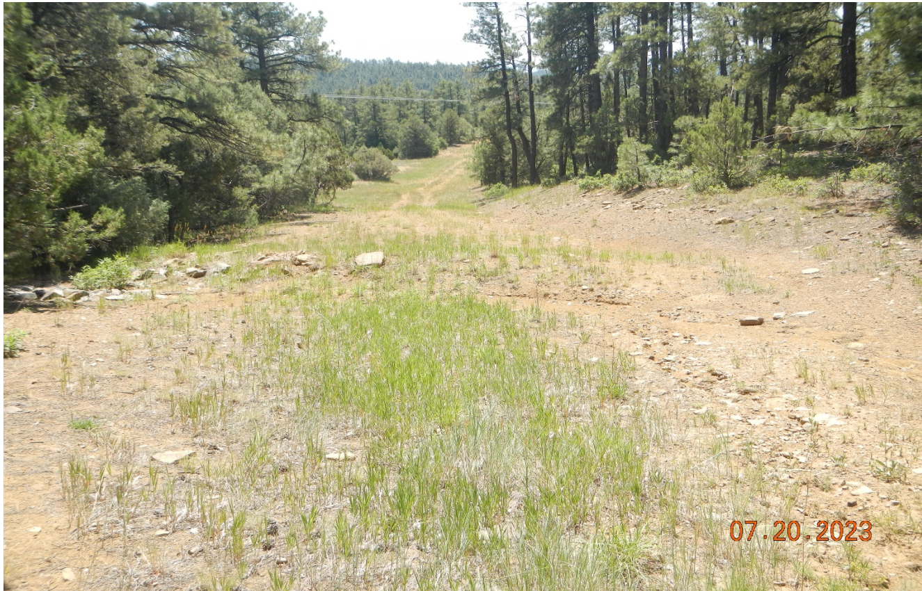
Photo 1. Facing southeast along the access road.