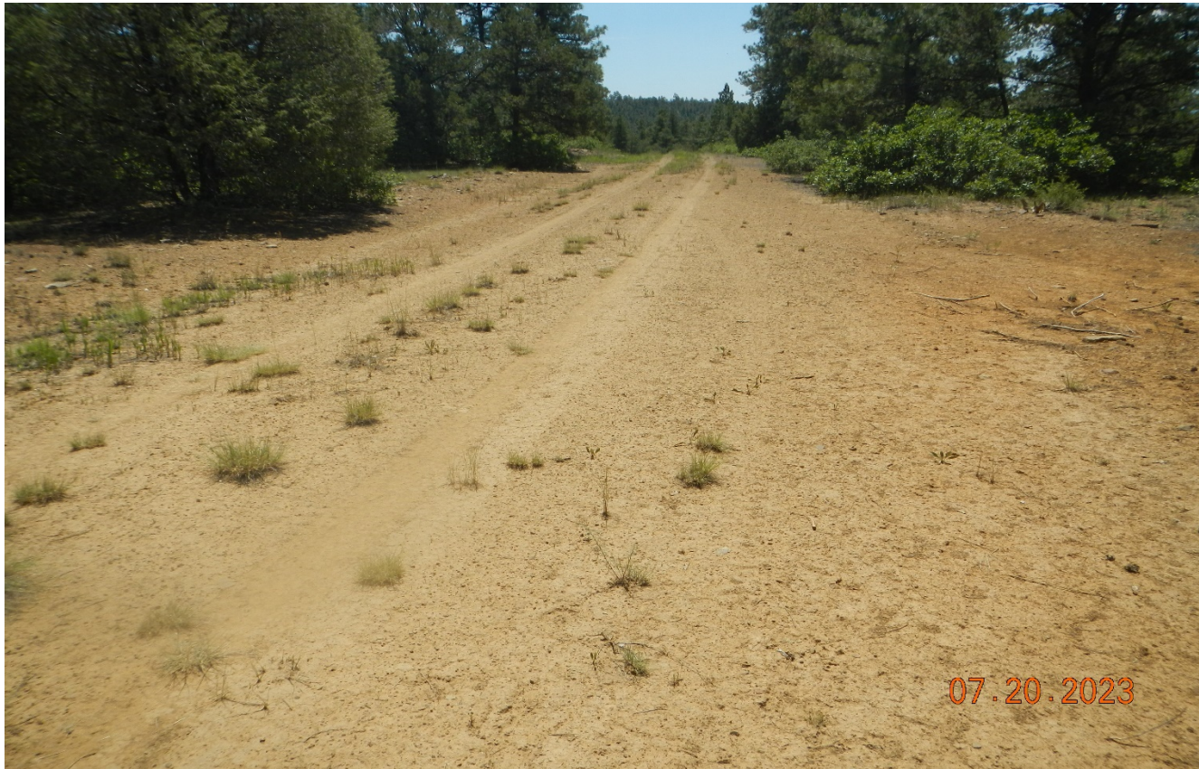
Photo 1. Facing southeast along the access road. This area of the road side is bare of vegetation and could use additional reseedling. Lat/Long:37.245,-104.654