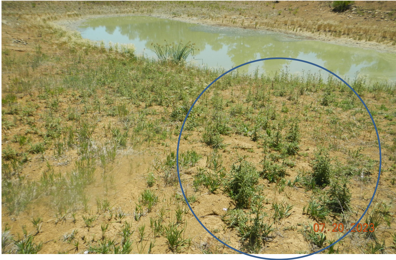
Photo 5. There are noxious weeds along the northwest side of the pit. Observed Canada thistle and Houndstongue in this area.