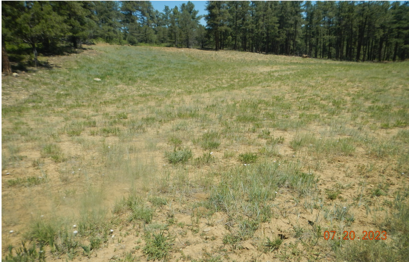
Photo 8. Facing north towards the location. Perennial vegetation is well established in this area.