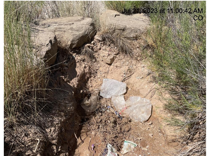
Photo # 3654 Culvert needs maintenance - Culvert appears to have sediment & trash built up on one end which is reducing culvert capacity. (culvert is near entrance to location)