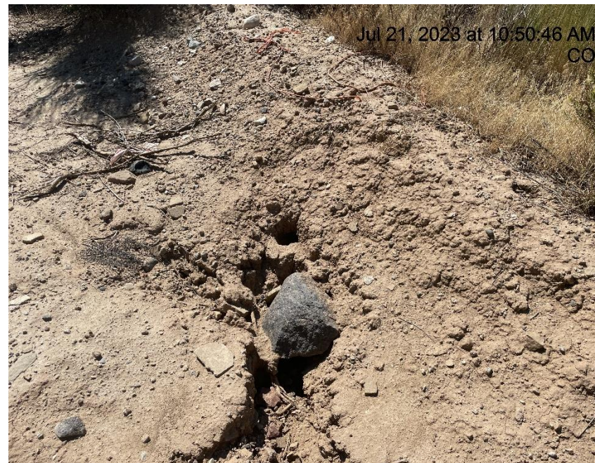
Photo # 3637 Erosion/Tunnel erosion (S/SW corner of location behind production units)