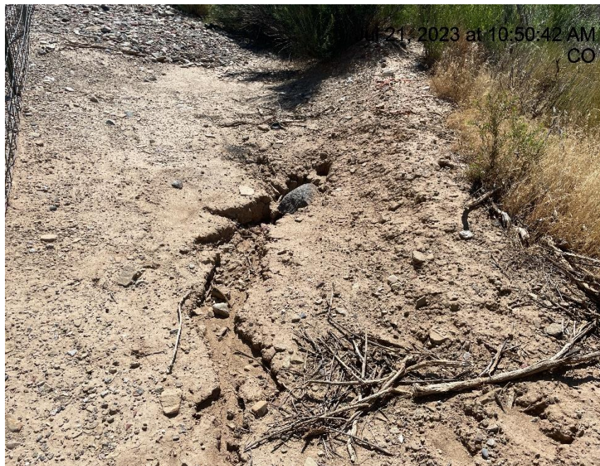
Photo # 3636 Erosion/Tunnel erosion (S/SW corner of location behind production units)