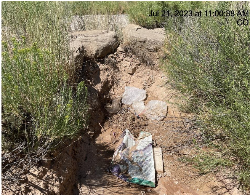
Photo # 3653 Culvert needs maintenance - Culvert appears to have sediment & trash built up on one end which is reducing culvert capacity. (culvert is near entrance to location)