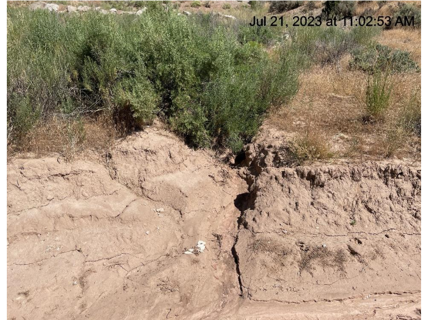
Photo # 3658 Erosion & transport of sediment (S/SE area of location near culvert)