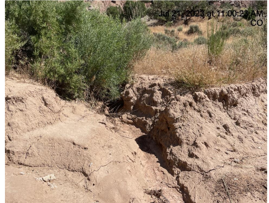
Photo # 3651 Erosion & transport of sediment (S/SE area of location near culvert)