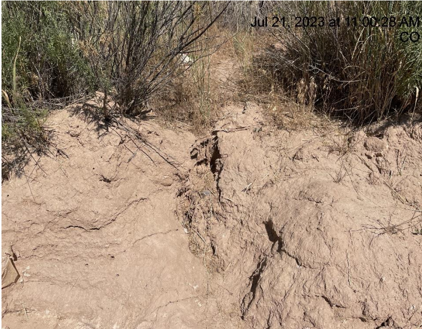
Photo # 3652 Erosion & transport of sediment (S/SE area of location near culvert)