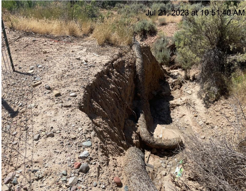
Photo # 3640 Wattles need maintenance - ditch has eroded & wattles have fallen into ditch (SW corner of location behind production units)