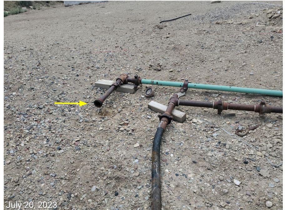
Photo 5: Photos examples showing uncapped/exposed lines observed at separator equipment.