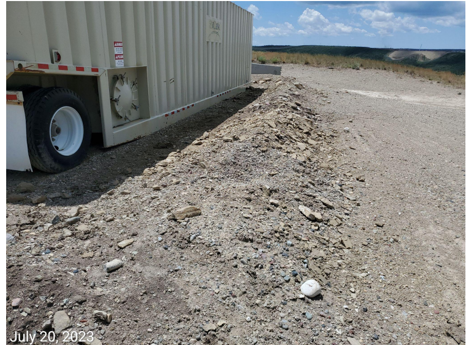
Photo 2: Secondary containment berm at 500 bbl produced water tank inadequate in size to contain in spill. BMP also does not appear to be sufficiently consolidated/impervious to contain a spill.