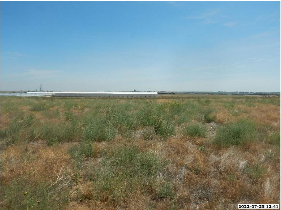
LOCATION PICTURE OF LABRISA 11-35HZ WELL PAD - CAMERA VIEW EAST