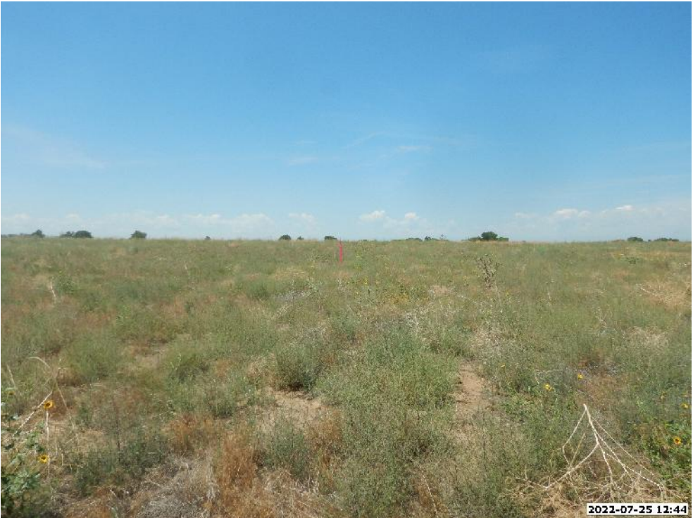
LOCATION PICTURE OF LABRISA 11-35HZ WELL PAD - CAMERA VIEW WEST