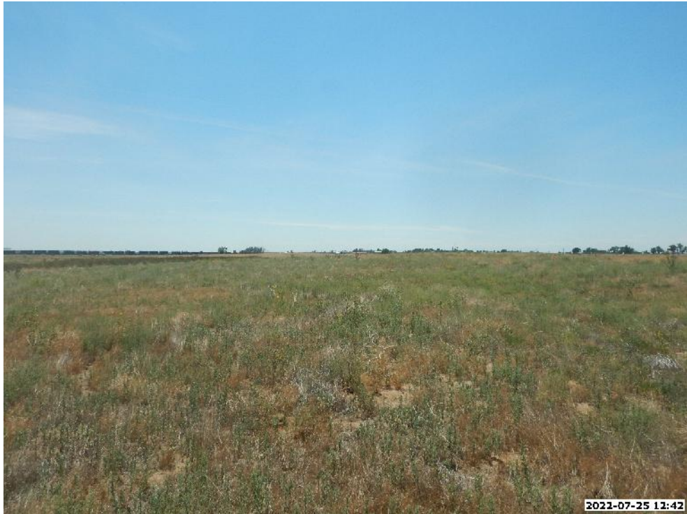
LOCATION PICTURE OF LABRISA 11-35HZ WELL PAD - CAMERA VIEW SOUTH