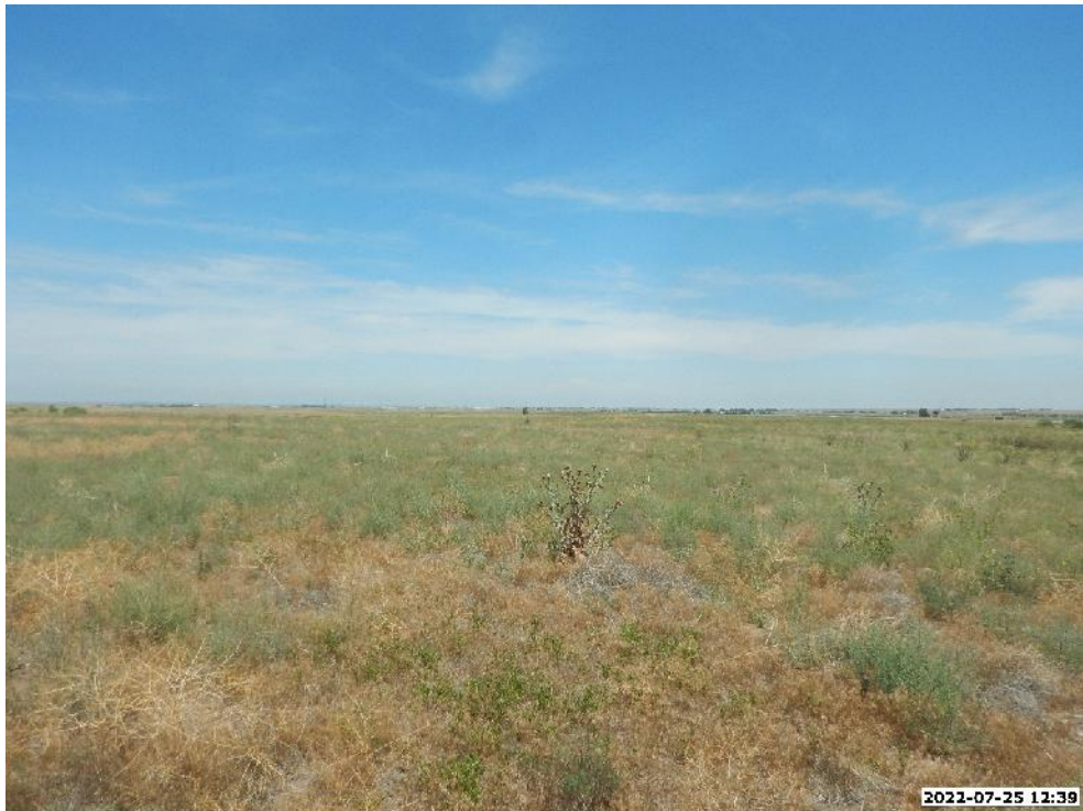
LOCATION PICTURE OF LABRISA 11-35HZ WELL PAD - CAMERA VIEW NORTH

E1/2 SW1/4 SECTION 35, TOWNSHIP 2 NORTH, RANGE 65 WEST, 6TH P.M., WELD COUNTY, COLORADO