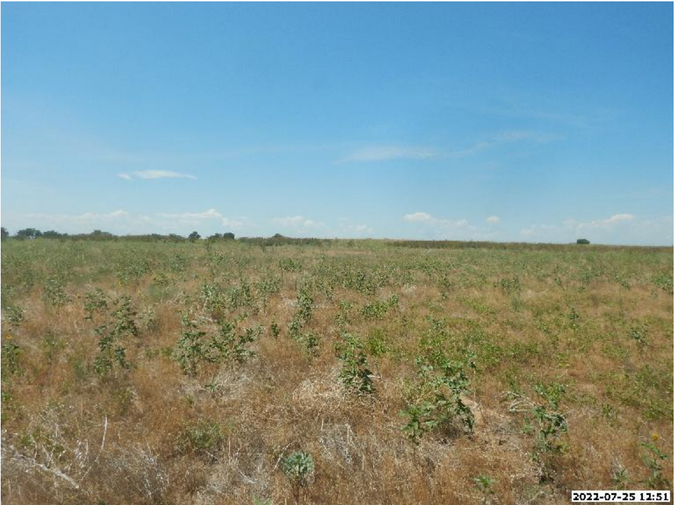
LOCATION PICTURE OF LABRISA 11-35HZ FACILITY PAD - CAMERA VIEW WEST