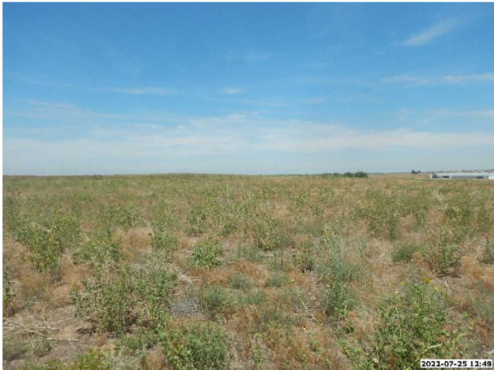
LOCATION PICTURE OF LABRISA 11-35HZ FACILITY PAD - CAMERA VIEW NORTH

E1/2 SW1/4 SECTION 35, TOWNSHIP 2 NORTH, RANGE 65 WEST, 6TH P.M., WELD COUNTY, COLORADO