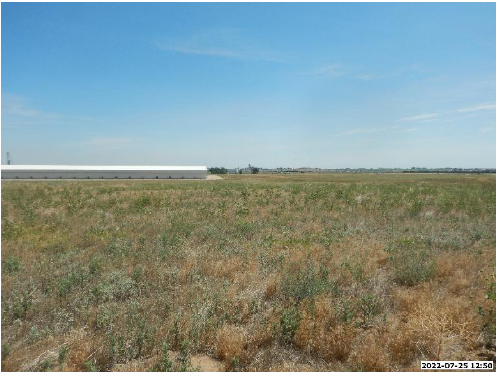
LOCATION PICTURE OF LABRISA 11-35HZ FACILITY PAD - CAMERA VIEW EAST