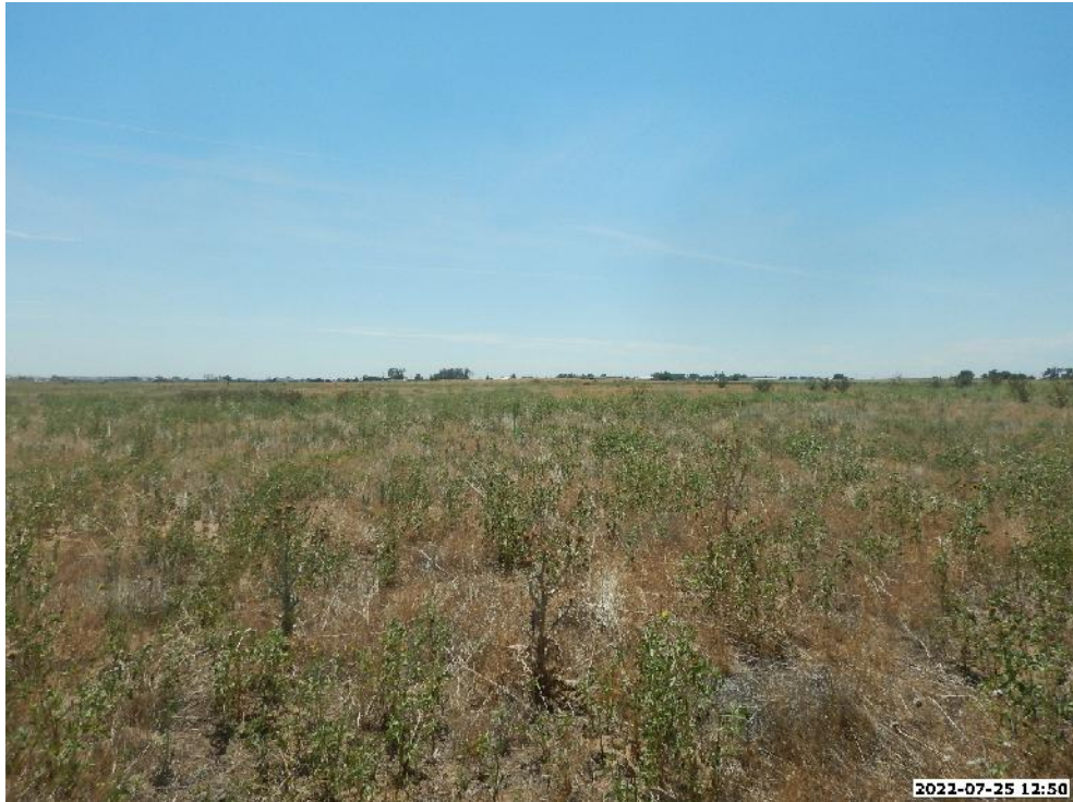
LOCATION PICTURE OF LABRISA 11-35HZ FACILITY PAD - CAMERA VIEW SOUTH