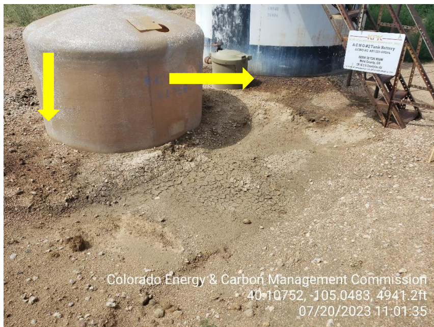
Photo 9 Stained soil inside berm.