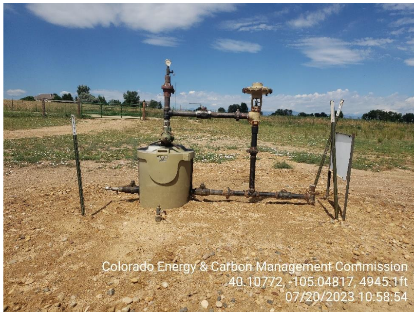
Photo 5 WH stained soil has been removed.