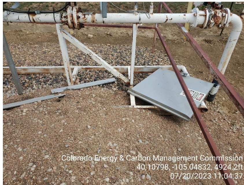
Photo 16 Gas Meter Run door and frame on the ground/trash.