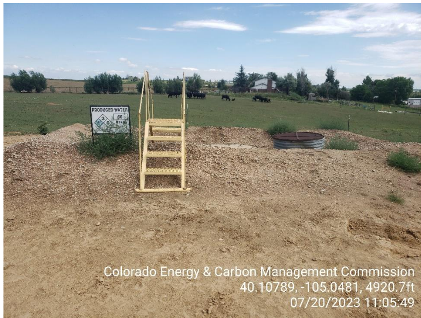
Photo 17 PWV not in use, Tin Horn not in use.