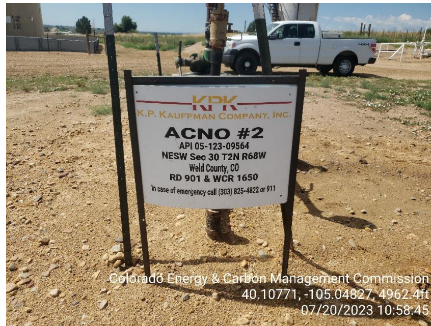
Photo 4 WH sign