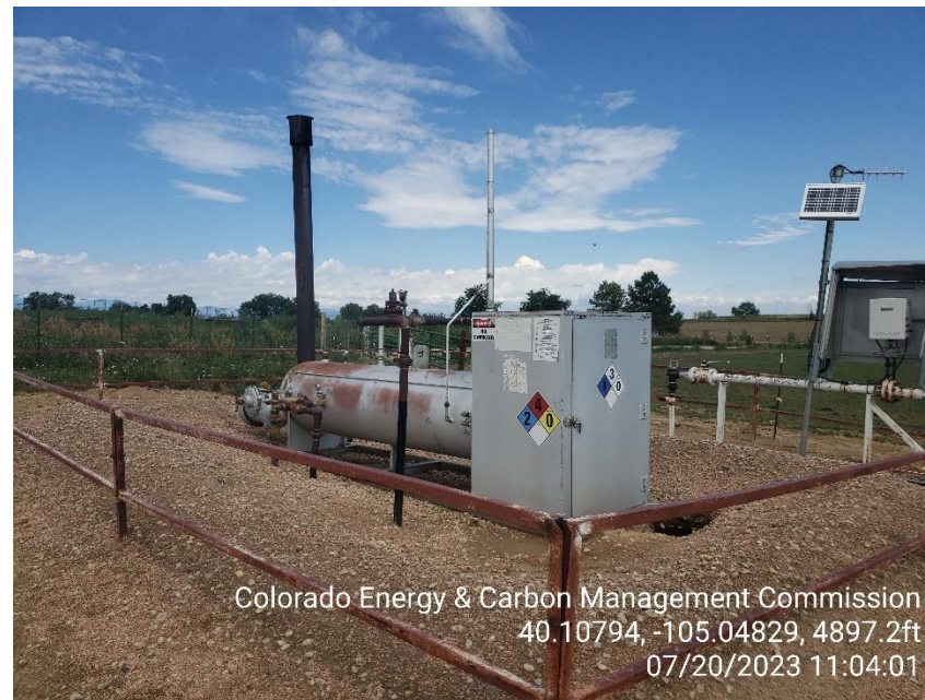
Photo 14 Horizontal heated separator.