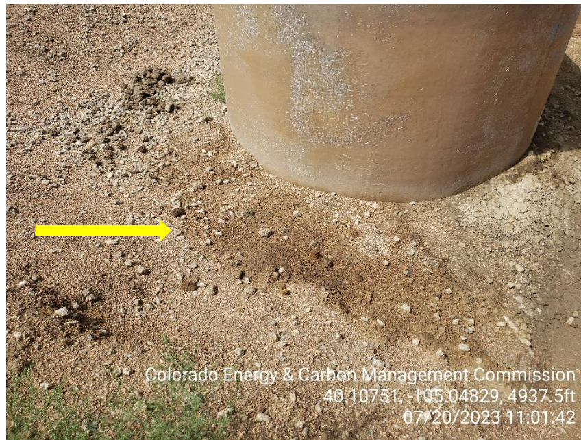
Photo 10 Stained soil inside berm.