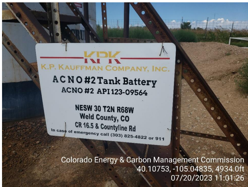
Photo 7 TB sign.