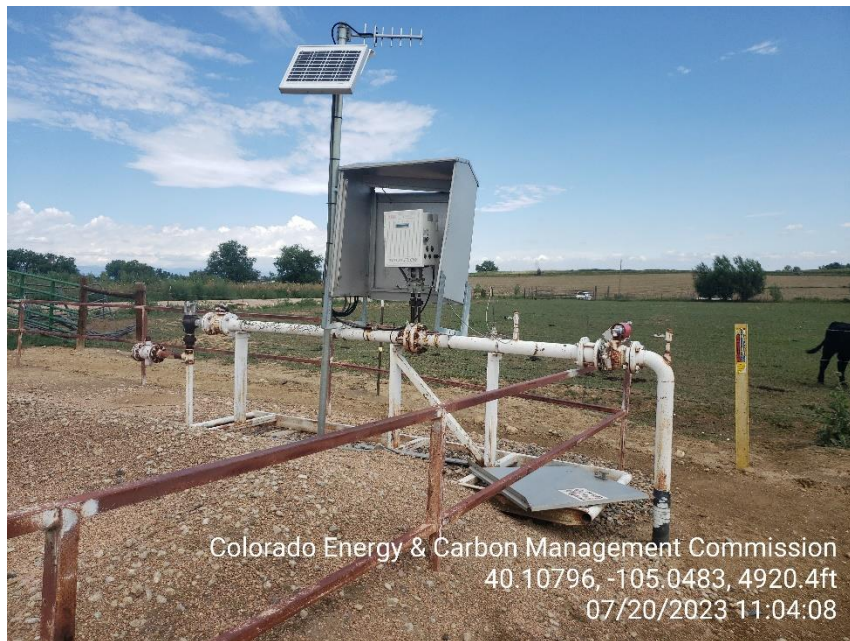
Photo 15 Gas Meter Run.