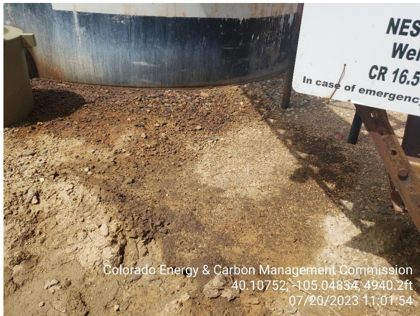
Photo 11 Stained soil inside berm.