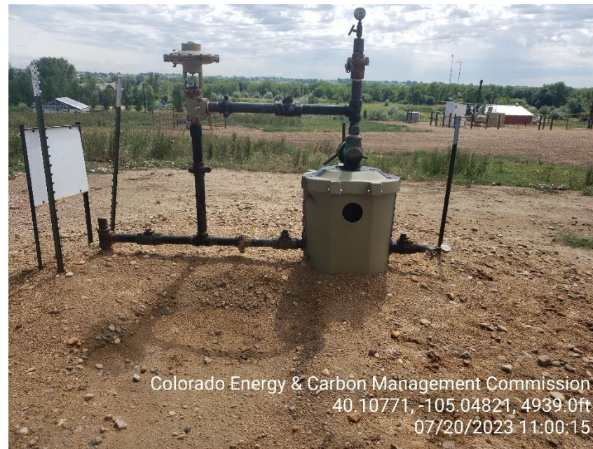
Photo 6 WH stained soil has been removed.