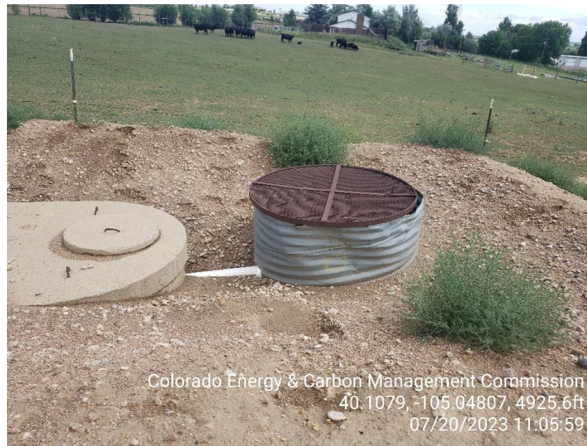
Photo 18 PWV not in use, Tin Horn not in use.