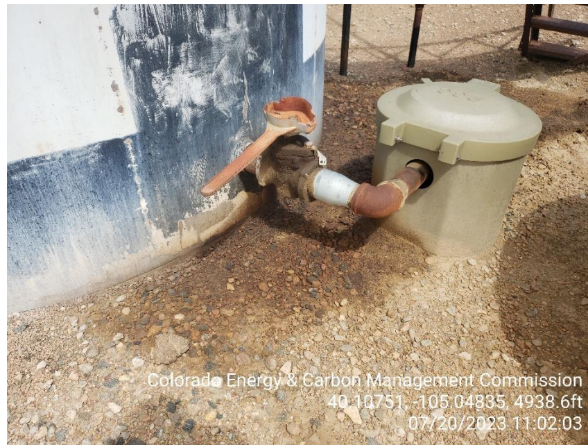
Photo 12 Stained soil inside berm.