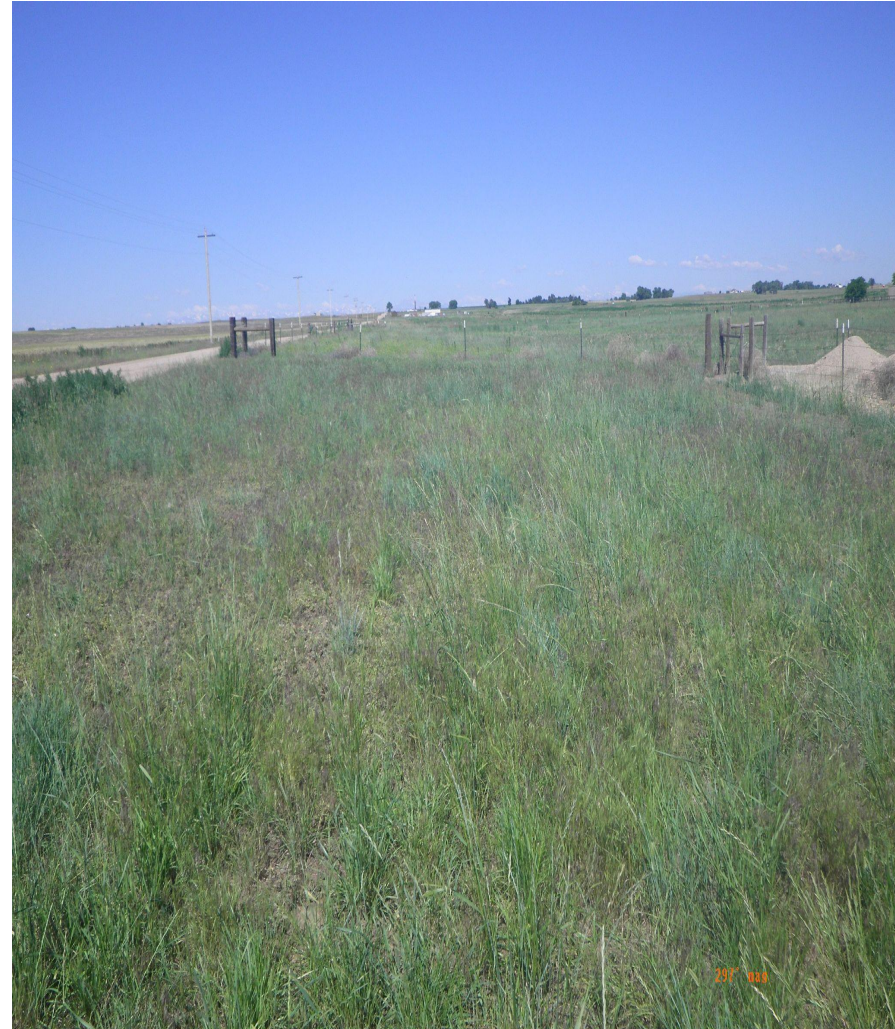
Photo 7. Cardinal photos taken from the middle of the tank battery. Left photo facing south, right photo facing west. Note: