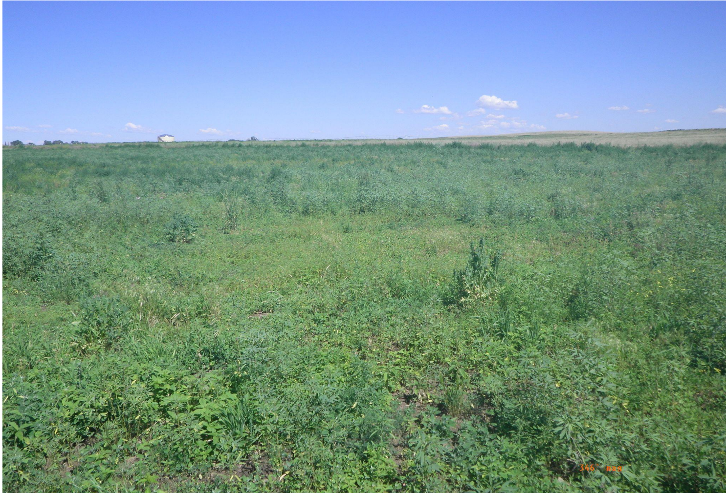
Photo 2. Overview photo of the well pad taken at ground level from the eastern edge facing west.