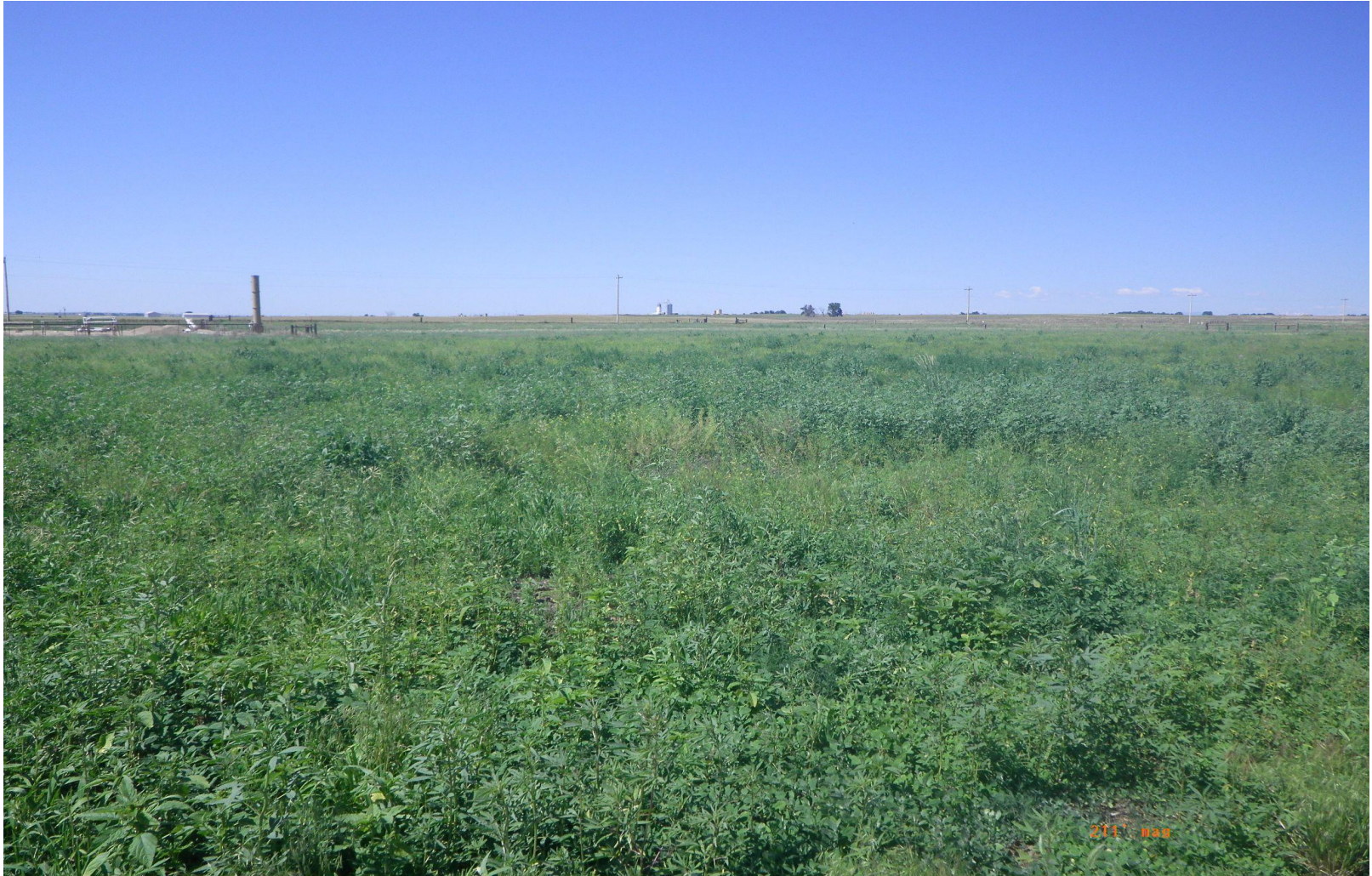
Photo 4. Well pad reference area.