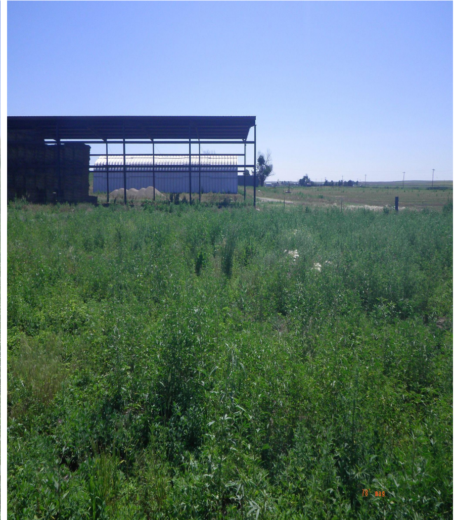
Photo 3. Cardinal photos taken from the middle of the well pad. Left photo facing north, right photo facing east.