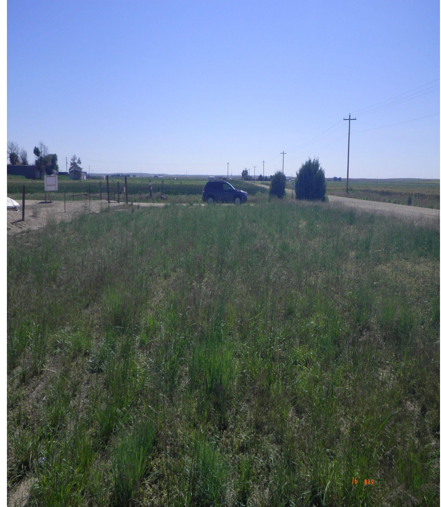
Photo 6. Cardinal photos taken from the middle of the tank battery. Left photo facing north, right photo facing east.