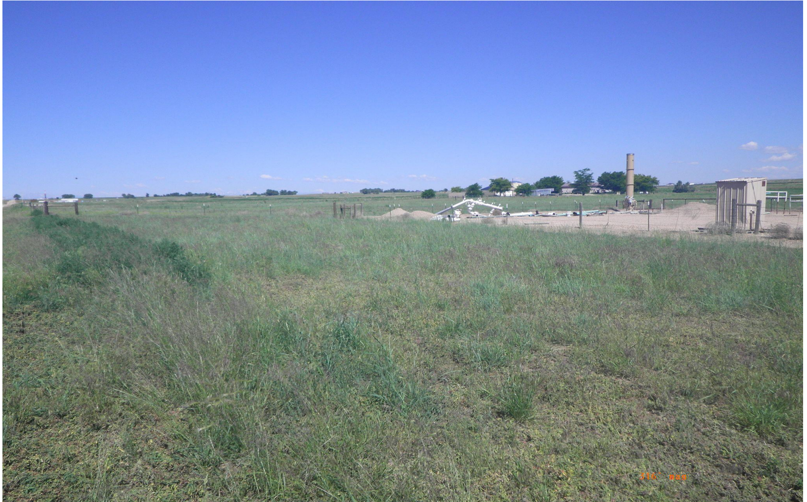
Photo 5. Overview photo of the tank battery taken at ground level from the eastern edge facing west.