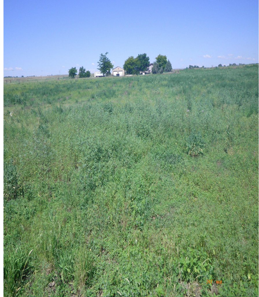
Photo 3. Cardinal photos taken from the middle of the well pad. Left photo facing south, right photo facing west. Note: well pad appears consistent with reference area (see photo #4).