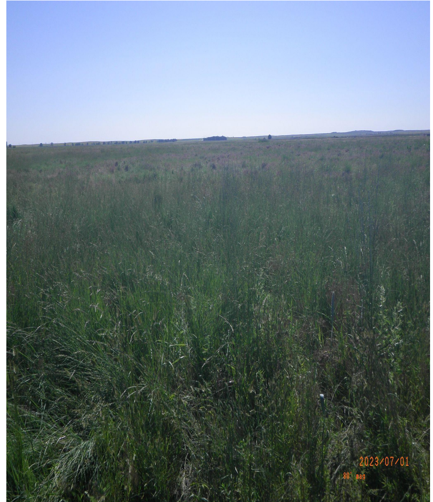
Photo 4. Cardinal photos taken from the middle of the well pad. Left photo facing north, right photo facing east.