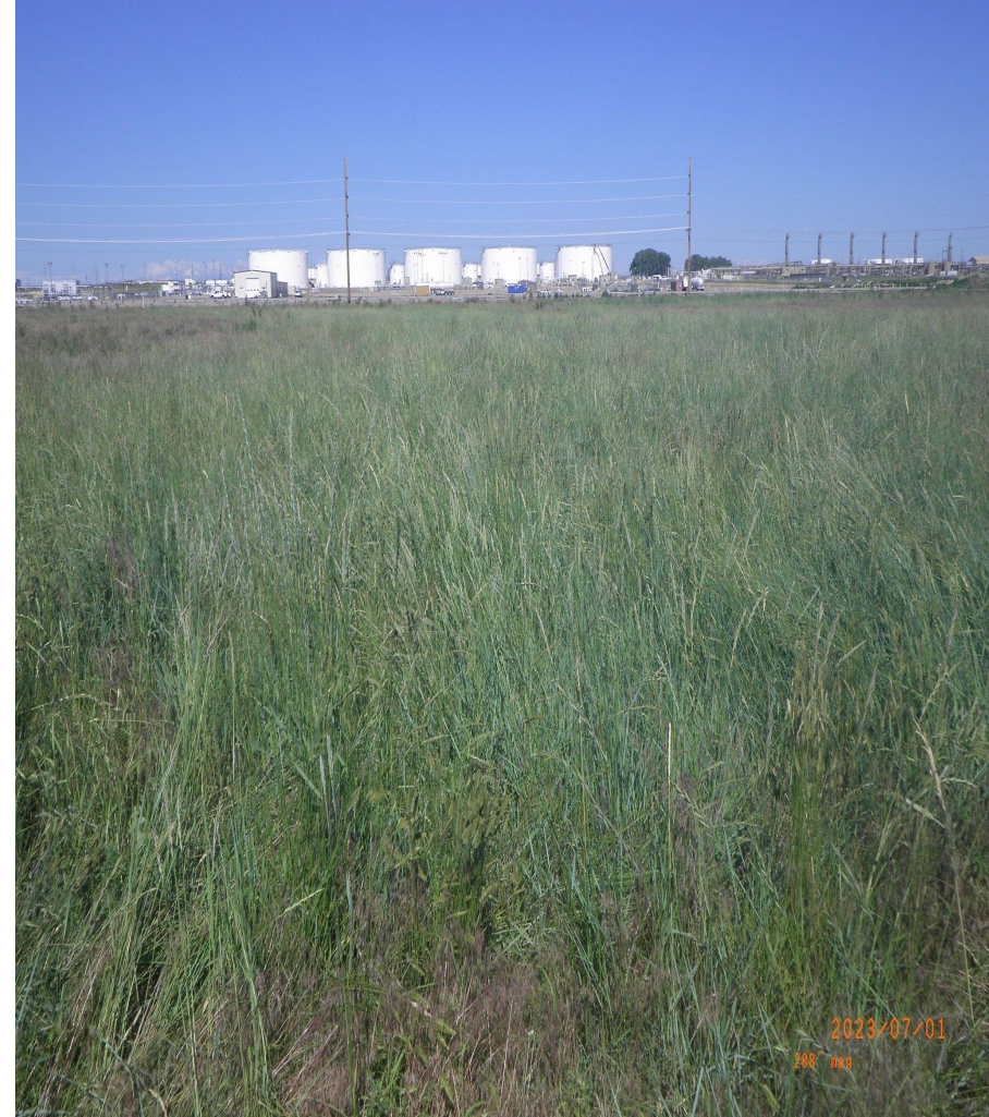
Photo 5. Cardinal photos taken from the middle of the well pad. Left photo facing south, right photo facing east. Note: well pad appears consistent with reference area (see photo #6).