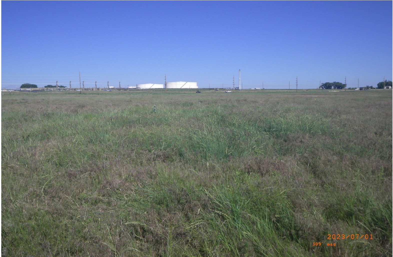
Photo 6. Well pad reference area.