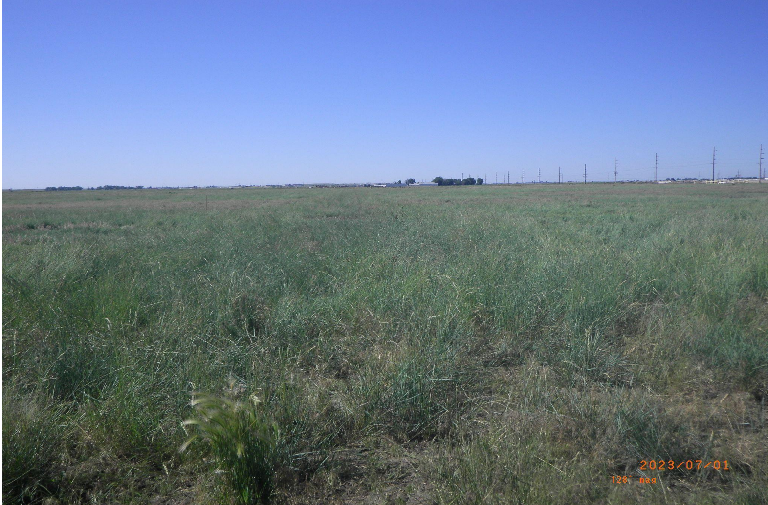
Photo 2. Overview photo of the access road taken from the northern edge facing south towards the well pad.