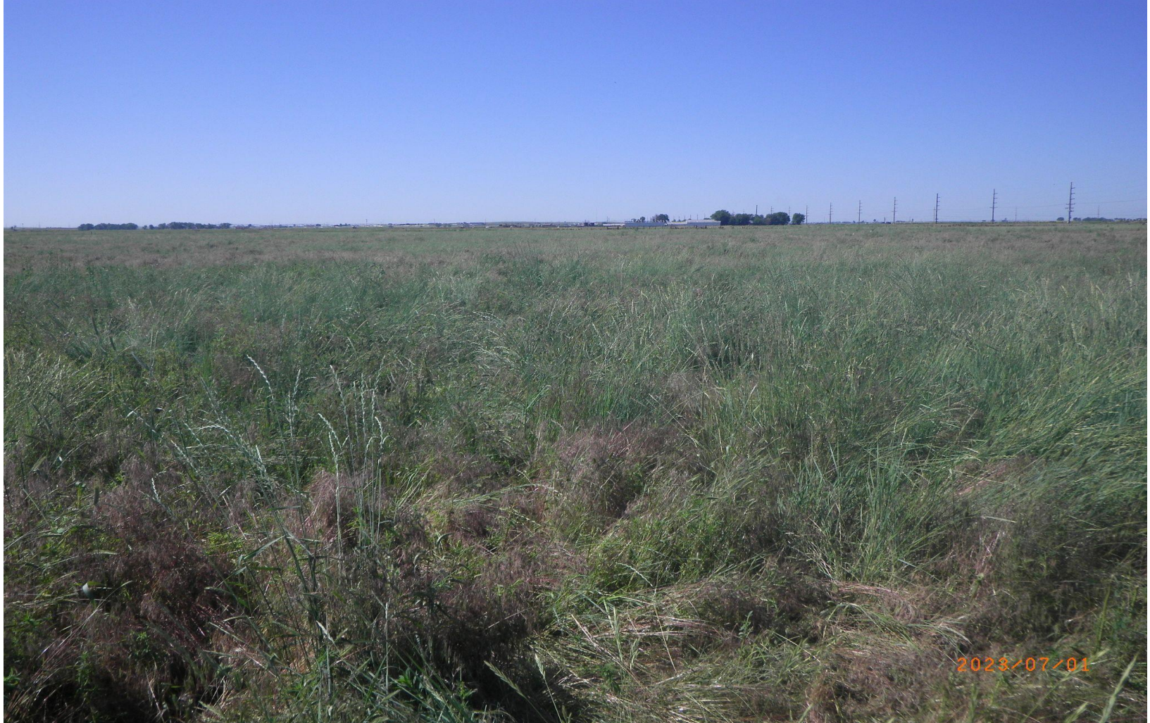
Photo 3. Overview photo of the well pad taken at ground level from the northern edge facing south.