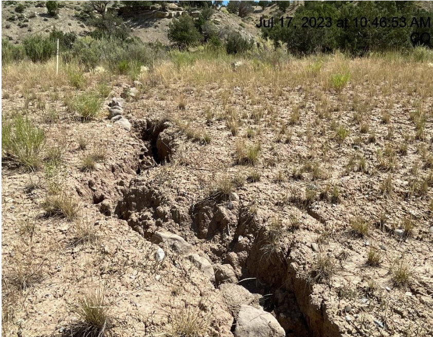
Photo # 3282 Gulley erosion/insufficient BMP's (N/NE area of location)