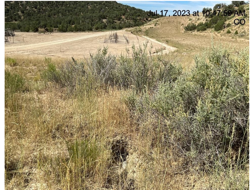
Photo # 3287 Tunnel erosion through berm allowing stormwater through leading to the gulley erosion in previous 4 photos