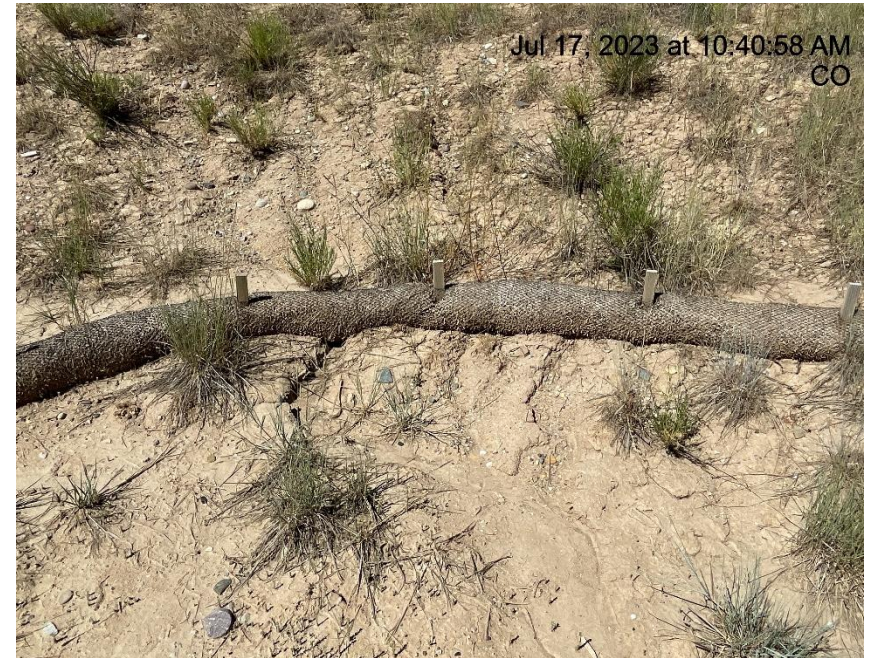
Photo # 3246 BMP's being undercut by stormwater flow (N/NW area of location)