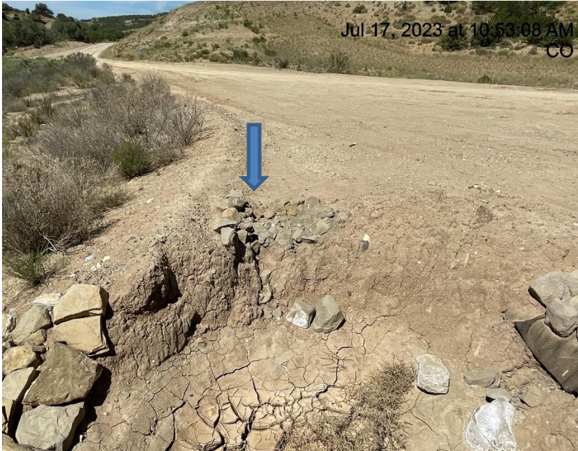
Photo # 3301 BMP's being undercut by stormwater flow (south side of location)