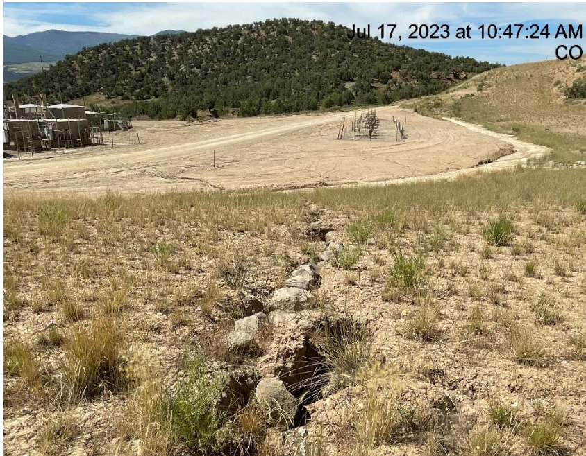
Photo # 3286 Gulley erosion/insufficient BMP's (N/NE area of location)