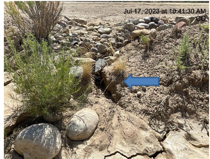
Photo # 3248 BMP's being undercut by stormwater flow (N/NW area of location)