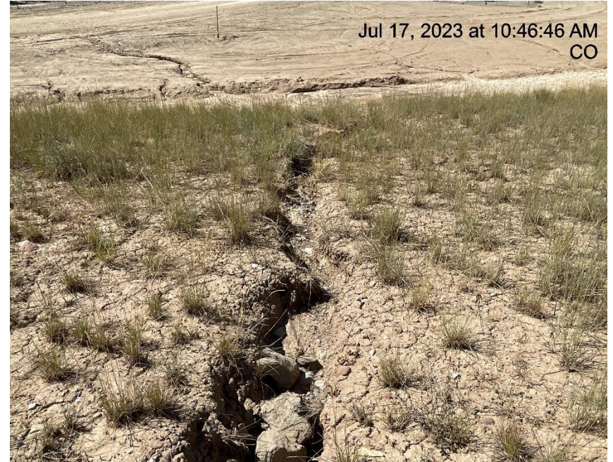
Photo # 3281 Gulley erosion/insufficient BMP's (N/NE area of location)