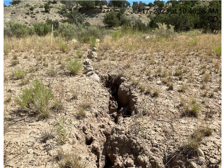
Photo # 3283 Gulley erosion/insufficient BMP's (N/NE area of location)