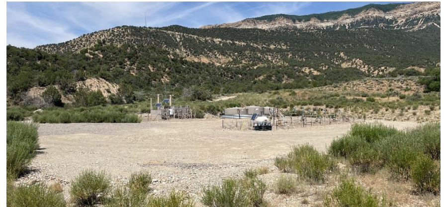
South East corner of location.