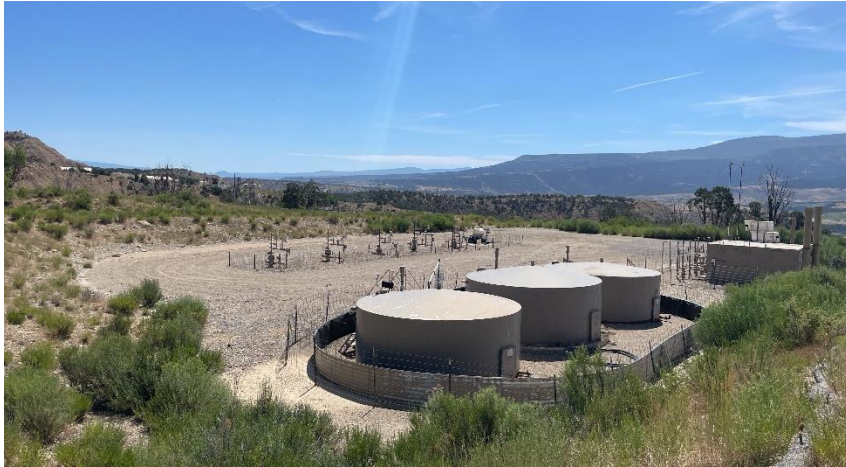
North West corner of location.