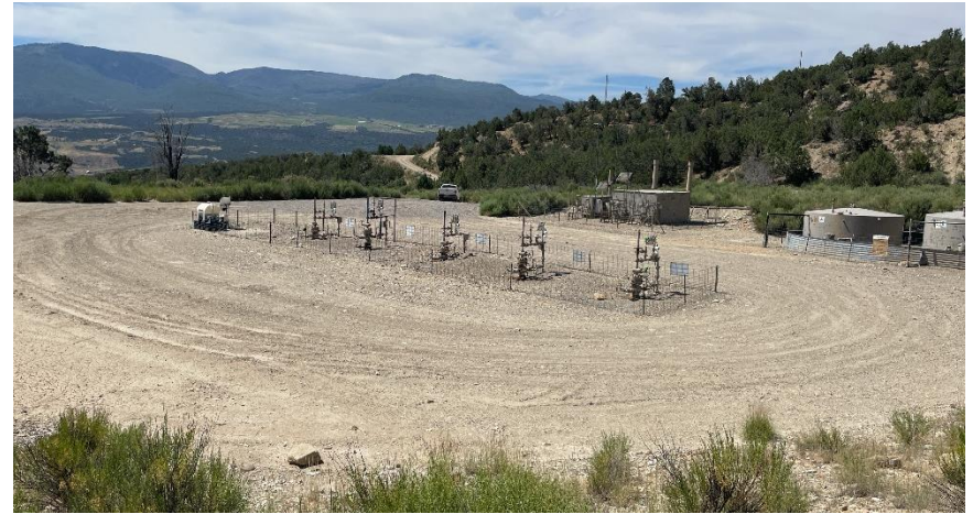
North East corner of location.