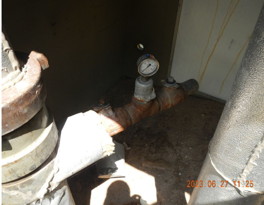
5. View of casing gauge.