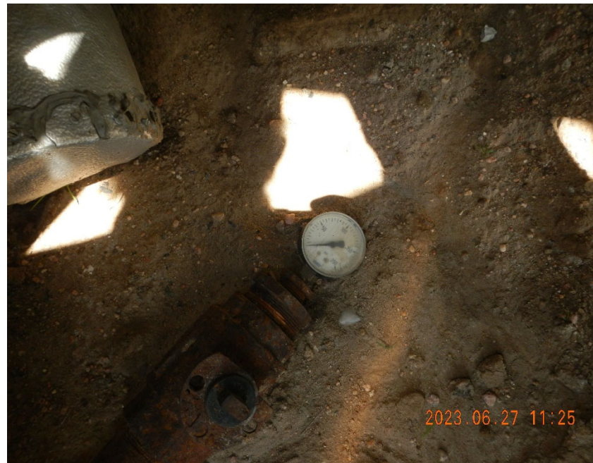
4. View of Braden Head gauge.