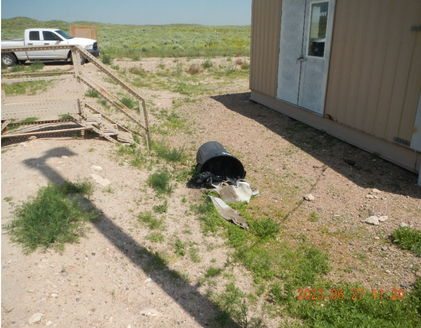
15. Tipped over trash can releasing trash and debris onto location.