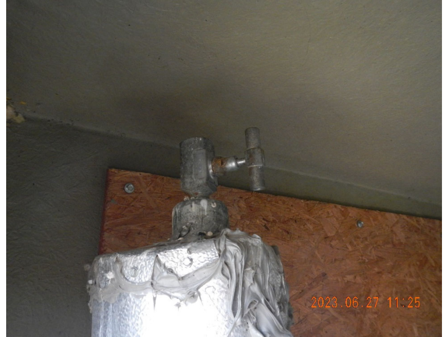
6. View of valve installed in tubing missing gauge.