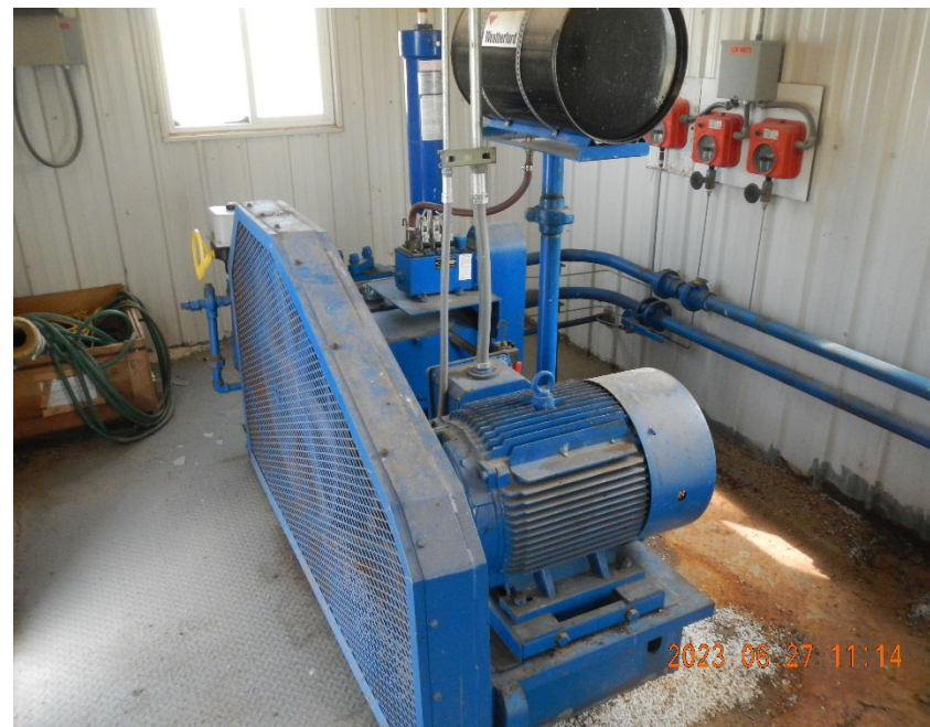
10. Injection pump.