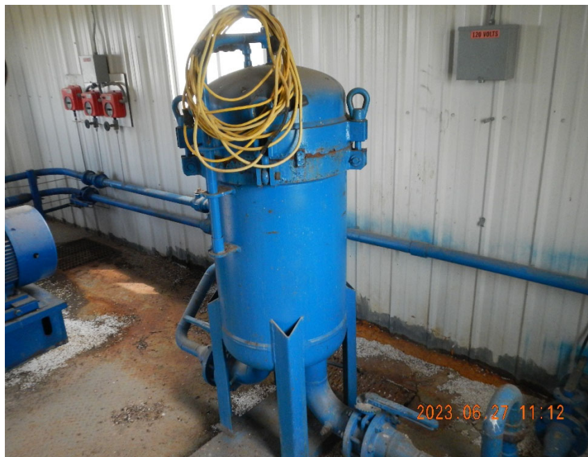
9. Produced water filter.