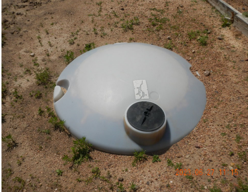
11. Tank located outside injection building with no signage. Note the lighter color at the crown of the tank. It is full.