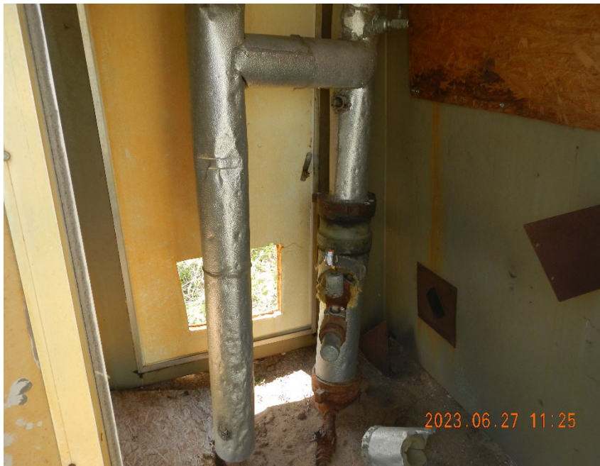
3. View of well inside building.