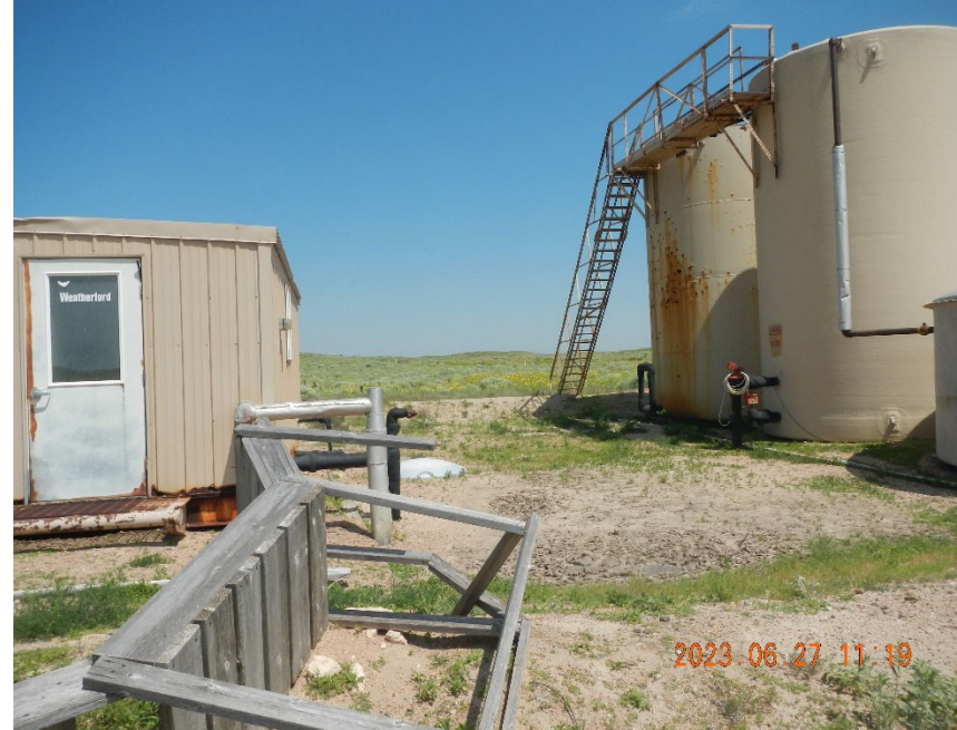
16. Intense storms in the area may have blown these over. Location needs to be monitored and checked after these weather events to ensure integrity of equipment, buildings, and resources.