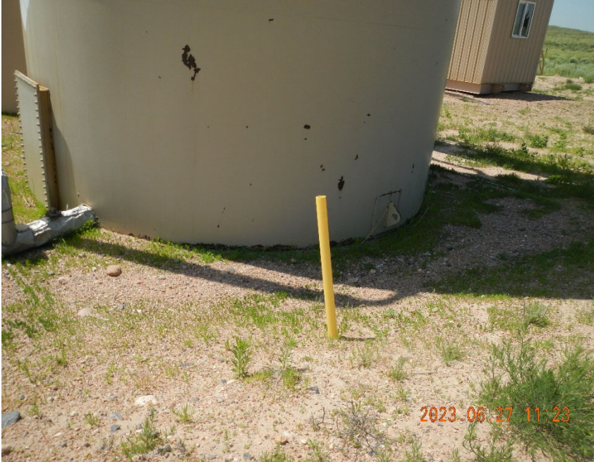
7. View of one of four located and marked deadmen.