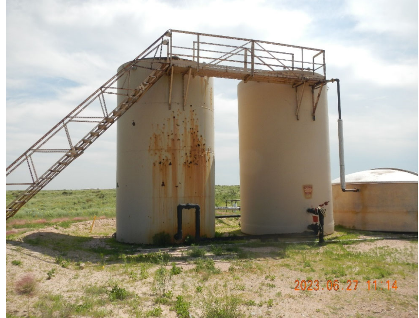
12. 400 BBL produced water storage tanks. One steel and one fiberglass. Note vegetation inside and on berms.