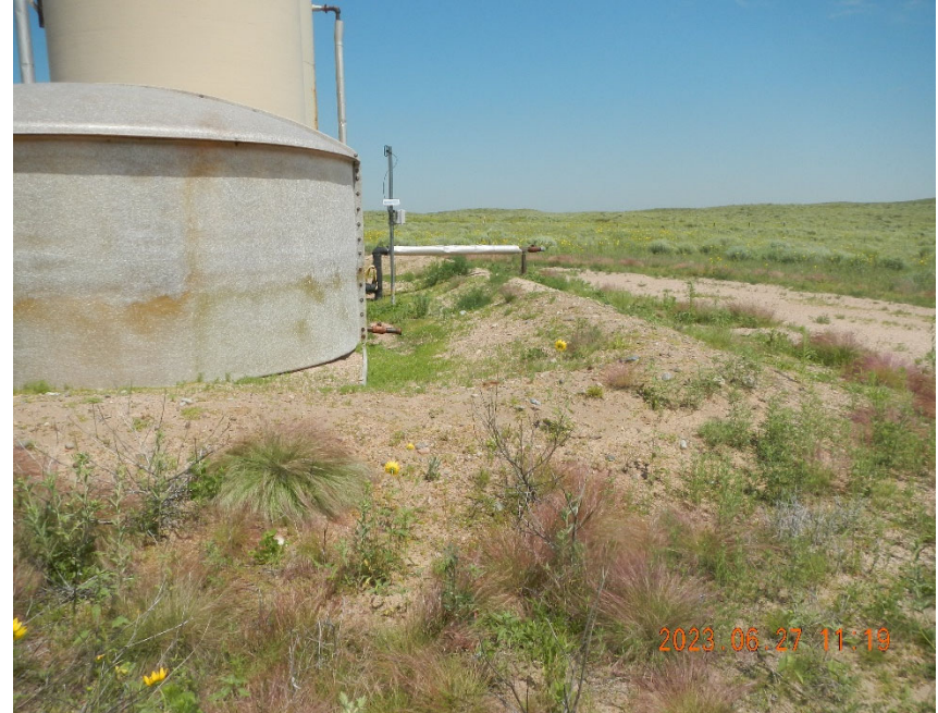
14. View of the backside of tank battery. Note vegetation.