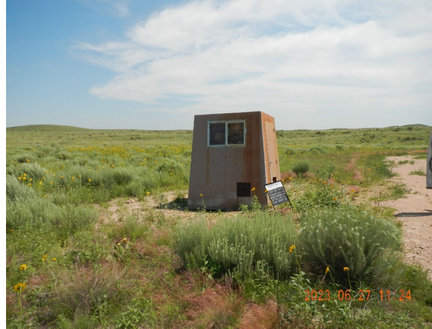
2. Insulated wellhead building.