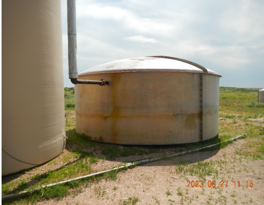
13. 210 BBL fiberglass storage tank.