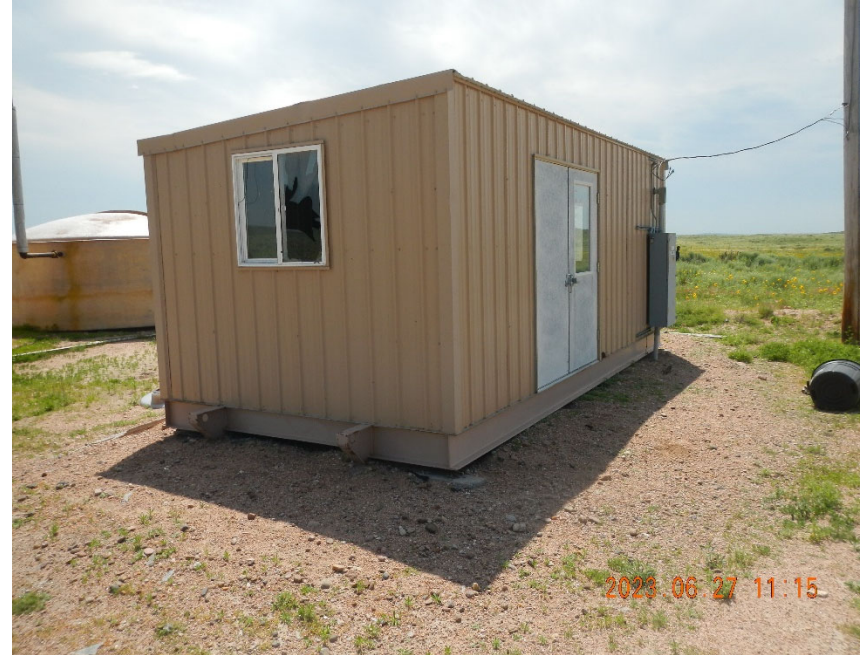
8. Metal building containing injection equipment.