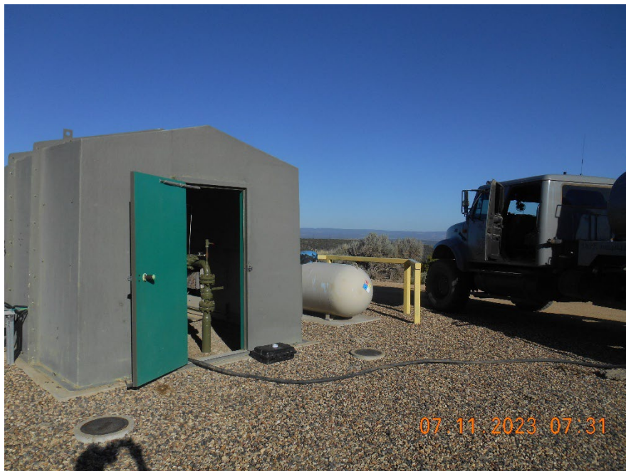
Injection wellhead during MIT