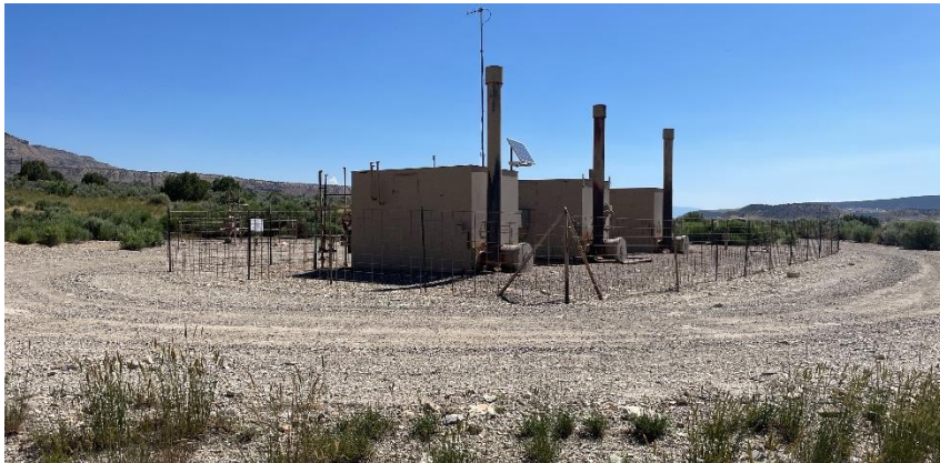
South West corner of location.