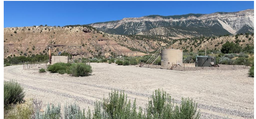
South East corner of location.