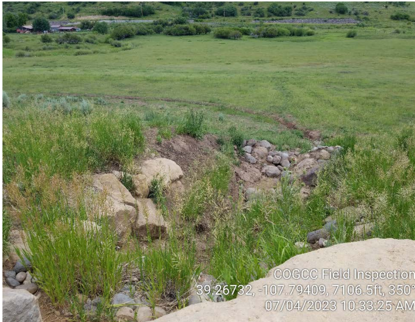
Photo #3 – Stormwater ditch leading off NE corner of pad was spill path for Spill/Release ID #483326.