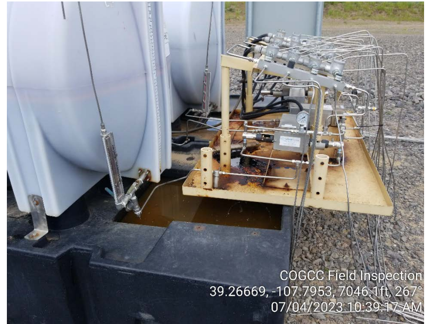
Photo #10 – Accumulation of oily waste inside of secondary containment device at wellhead day tank pump.