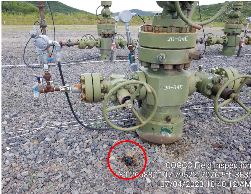
Photo #9 - Localized accumulation of oily waste beneath 20-04E wellhead.