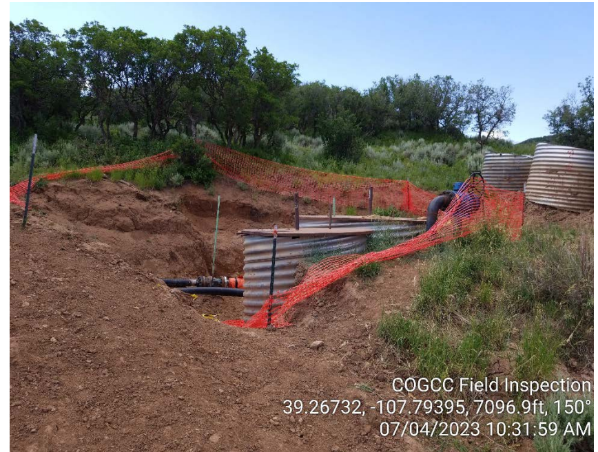
Photo #2 – Open excavation related to Spill/Release ID #483326 at NE corner of pad.