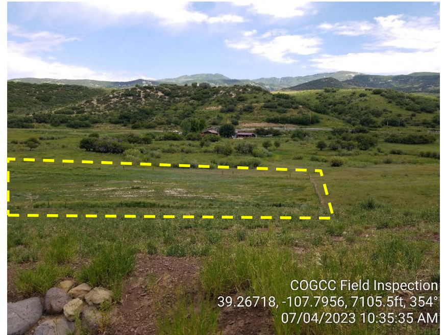
Photo #4 – Fenced area NW of pad was impacted by Spill/Release ID #483326 and is subject of Remediation Project #27161.