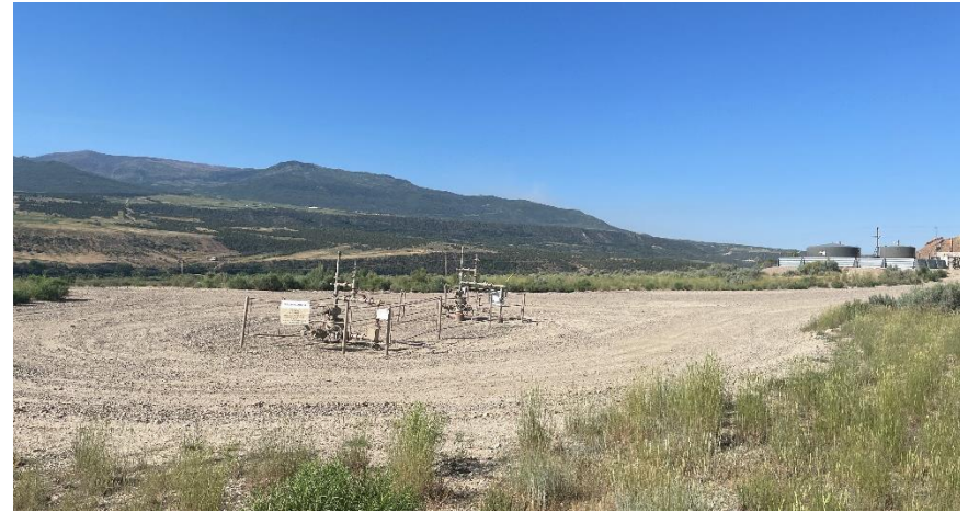
North East corner of location.