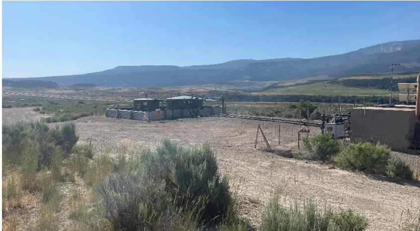
North West corner of location.