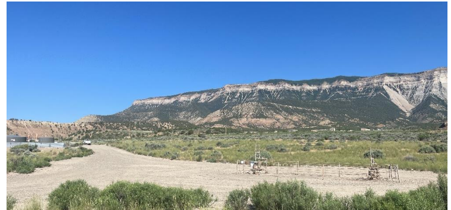
South East corner of location.