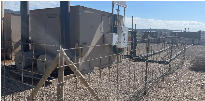
South West corner of location.