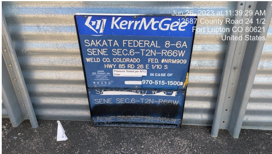
Photo 1. Photo taken of Location sign.