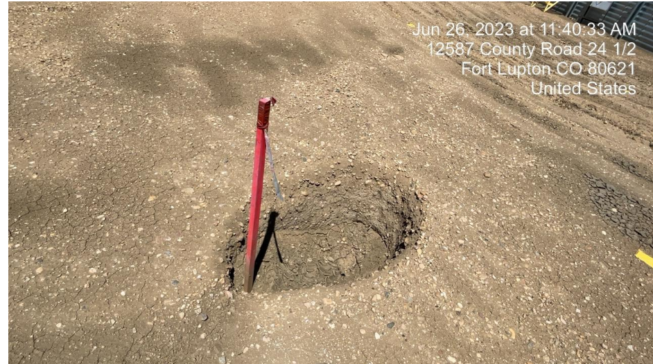
Photo 4. Photo of pothole onsite. .