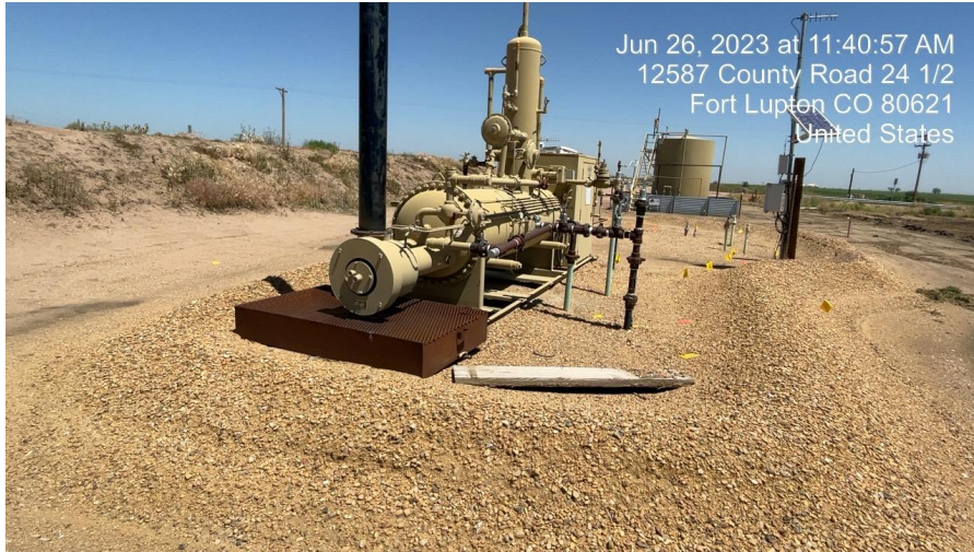
Photo 5. Photo taken of trash onsite