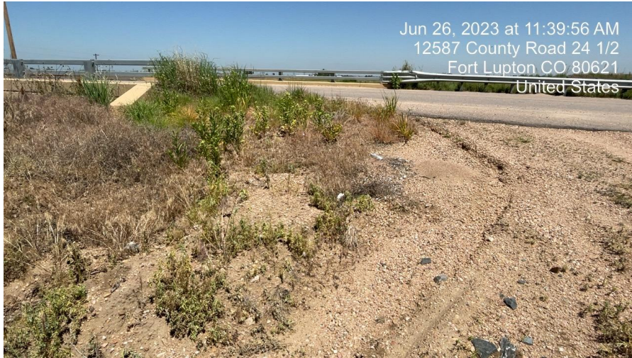
Photo 3. Photo taken of Weeds on site.