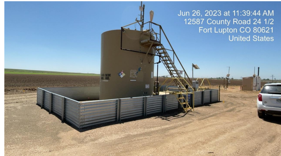
Photo 2. Photo taken of tank battery.