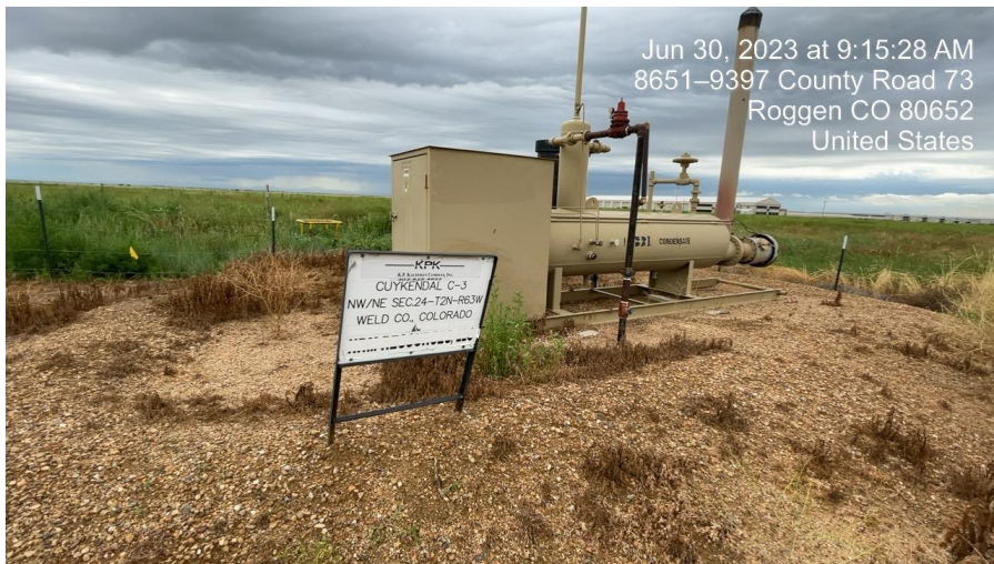
Photo 11. Photo taken of location sign at separator.