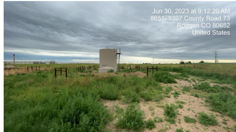
Photo 2. Photo of Weeds on site.