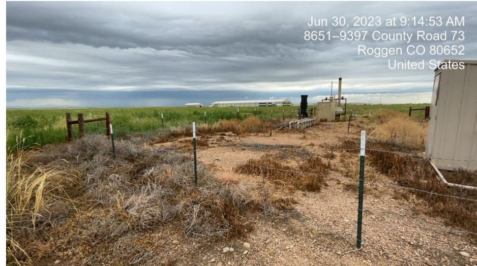
Photo 10. Photo taken of separator area.