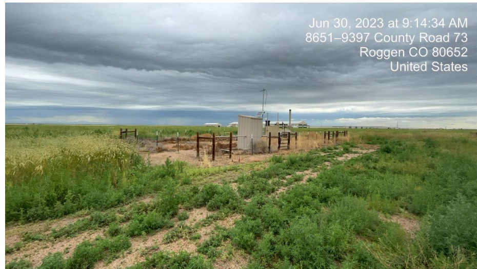
Photo 8. Photo taken of separator and access road weeds.