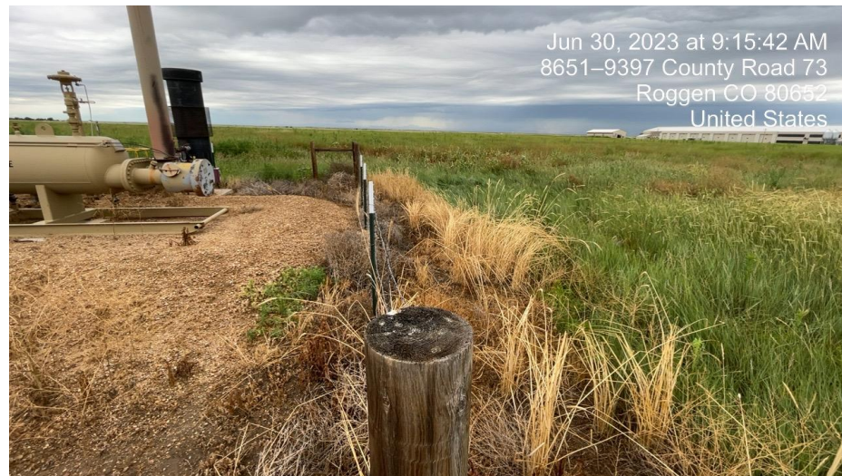
Photo 12. Photo taken of dead grass from over spraying.