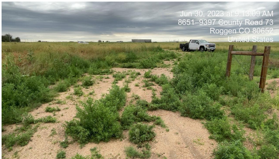
Photo 7. Photo taken of weeds in access road and reclaimed area.