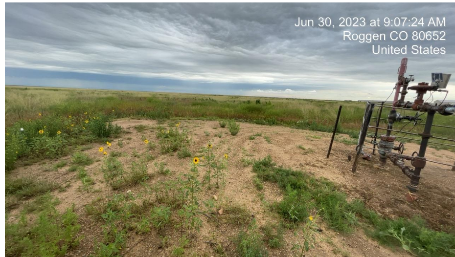
Photo 14. Photo taken of weeds around wellhead adn in reclaimed area.