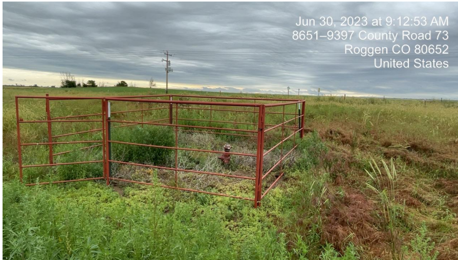
Photo 5. Photo taken of weeds in and around fenced in valves.