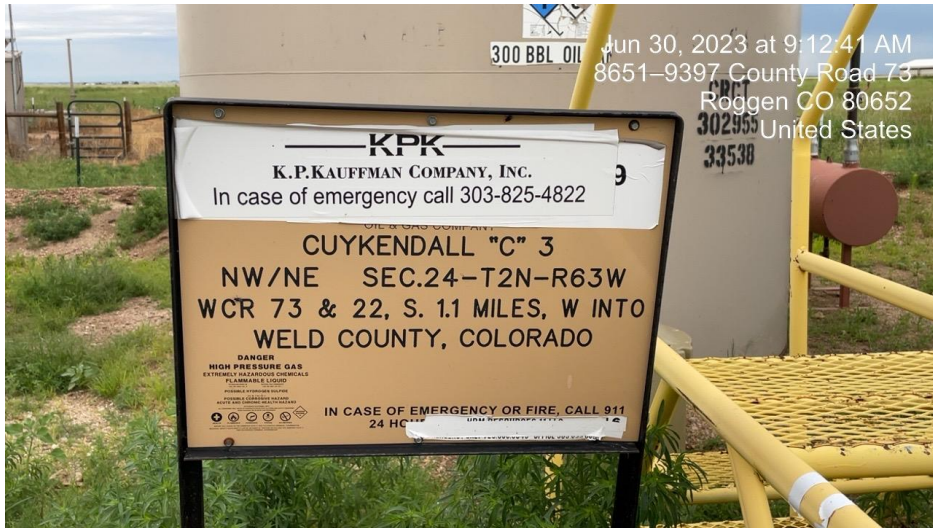
Photo 1. Photo of sign on site.