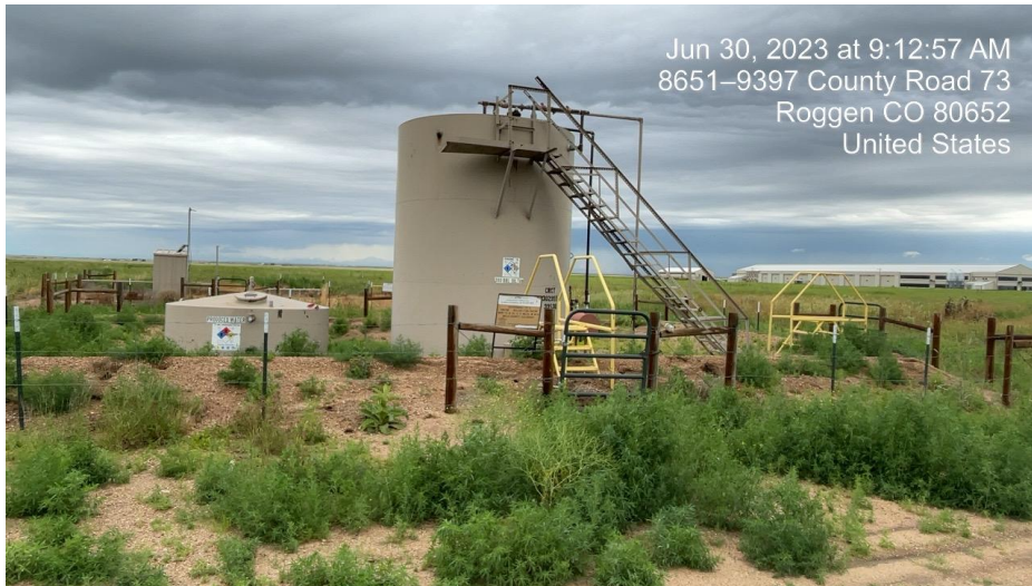
Photo 3. Photo taken of weeds in and around tank battery