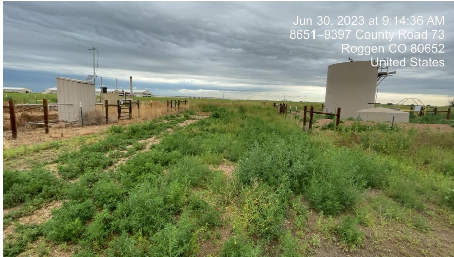
Photo 9. Photo taken of weeds throughout site and equipment.