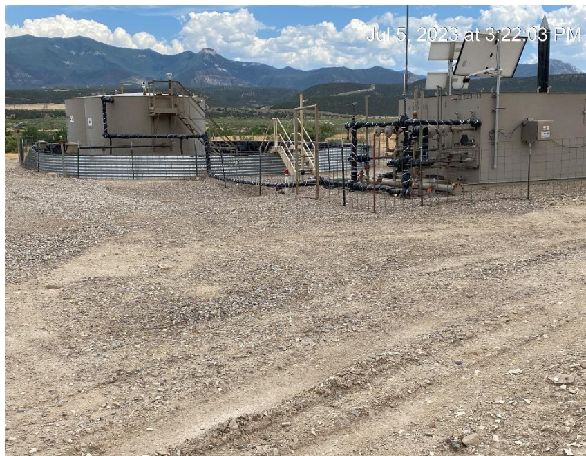
Separator and tank battery