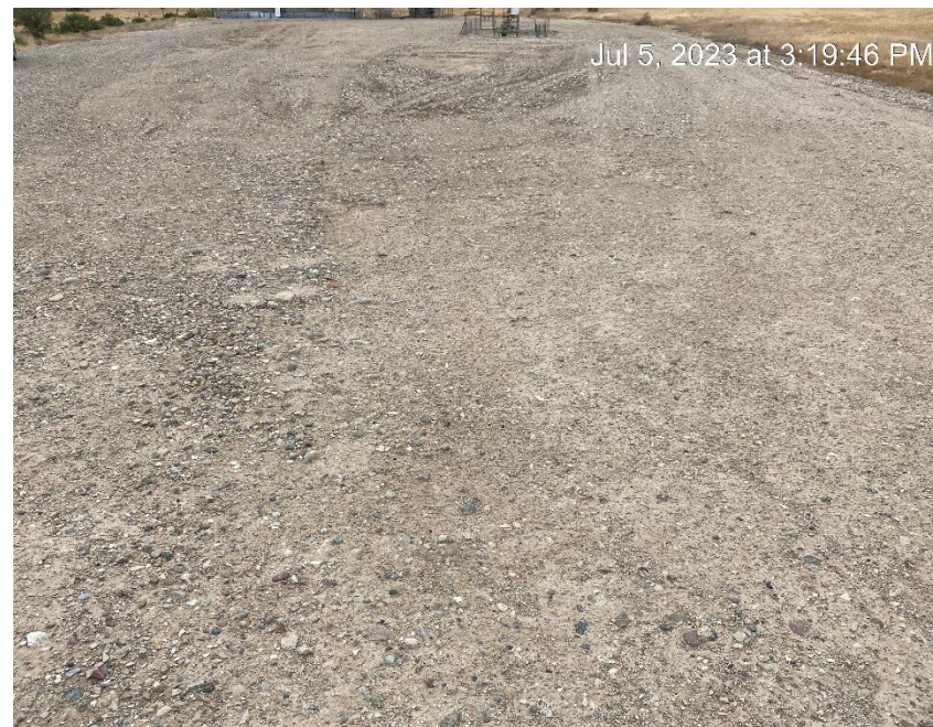
Entrance to location