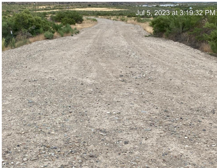
Access road at entrance to location