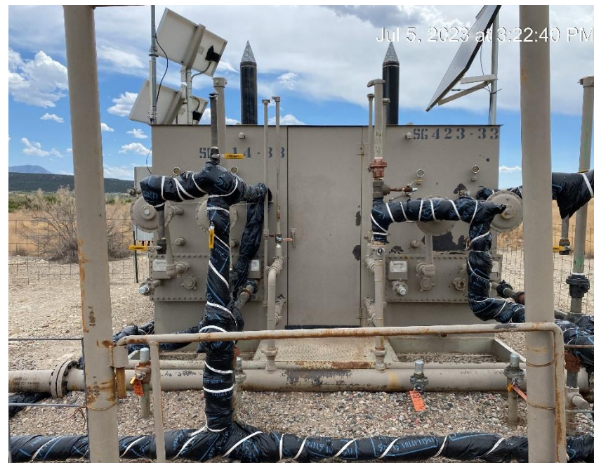
Gas meter calibration not visibly displayed