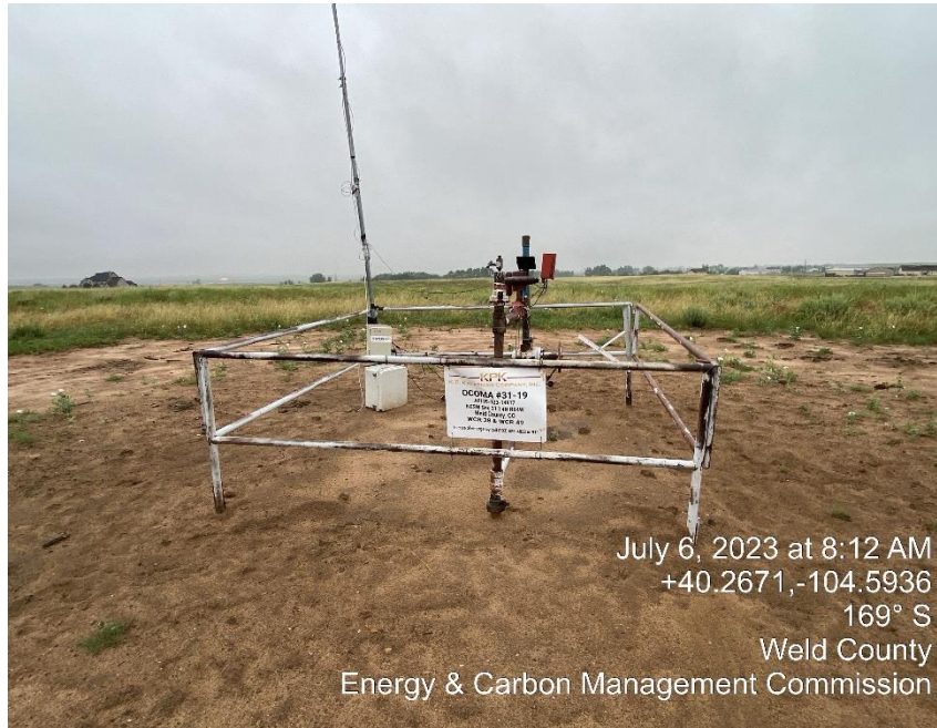
Well & Sign