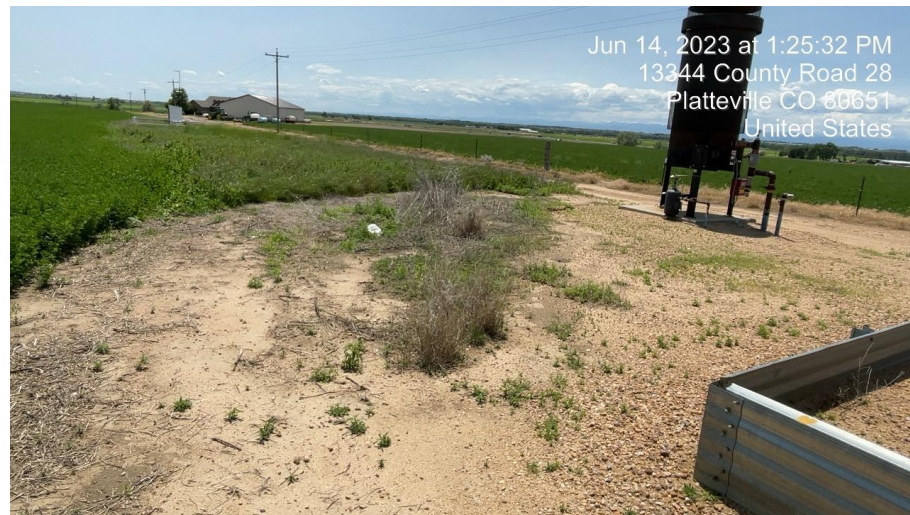
Photo 4. Photo of weeds on site.