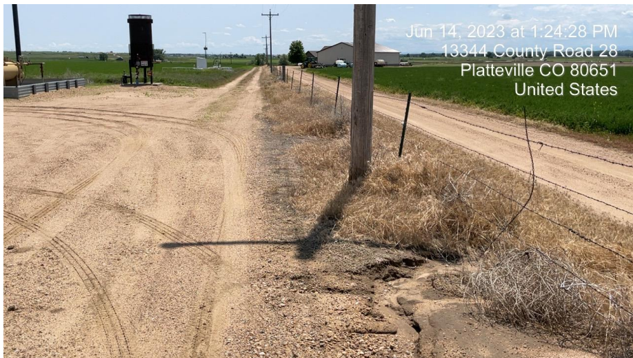
Photo 3. Photo taken of stormwater erosion on site.