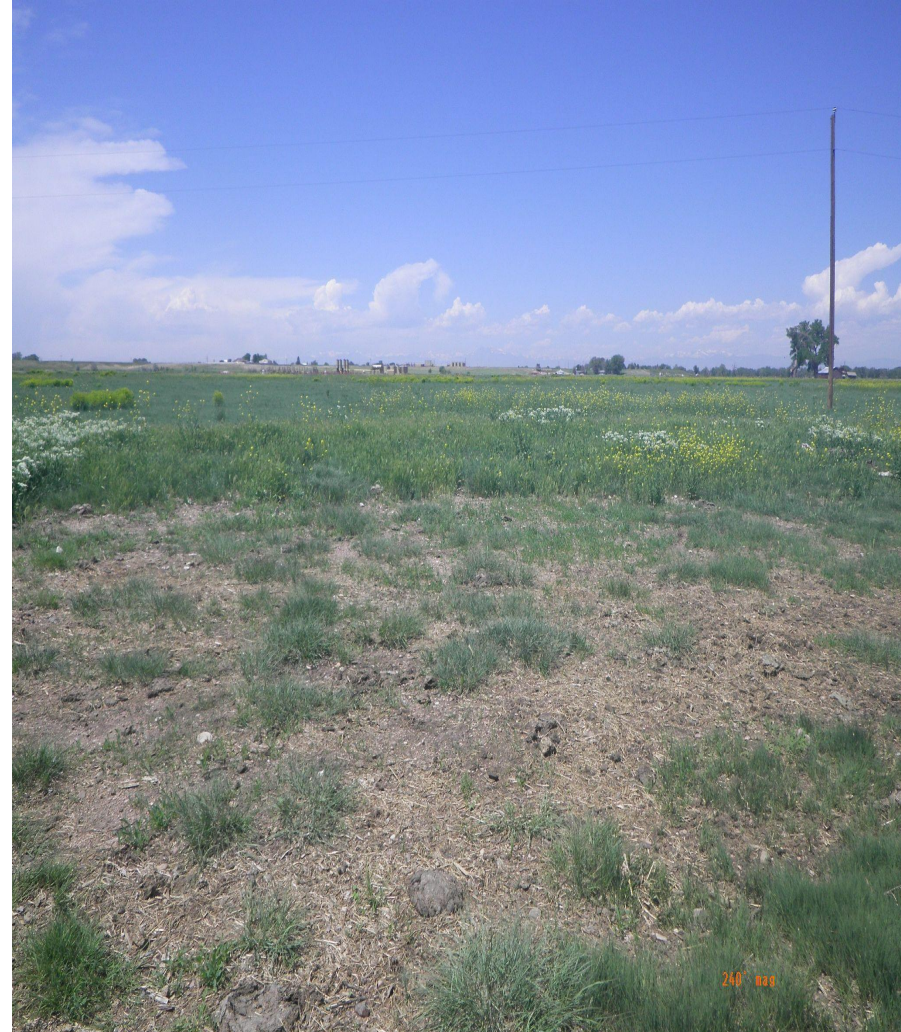
Photo 4. Cardinal photos taken from the middle of the well pad. Left photo facing south, right photo facing west. Note: well pad falls within a large pasture filled with cattle. Area has been trampled by cattle, bare area does not appear to be related to oil and gas operations/reclamation.