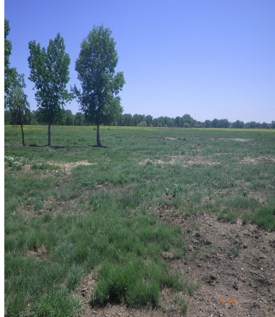
Photo 3. Cardinal photos taken from the middle of the well pad. Left photo facing north, right photo facing east.