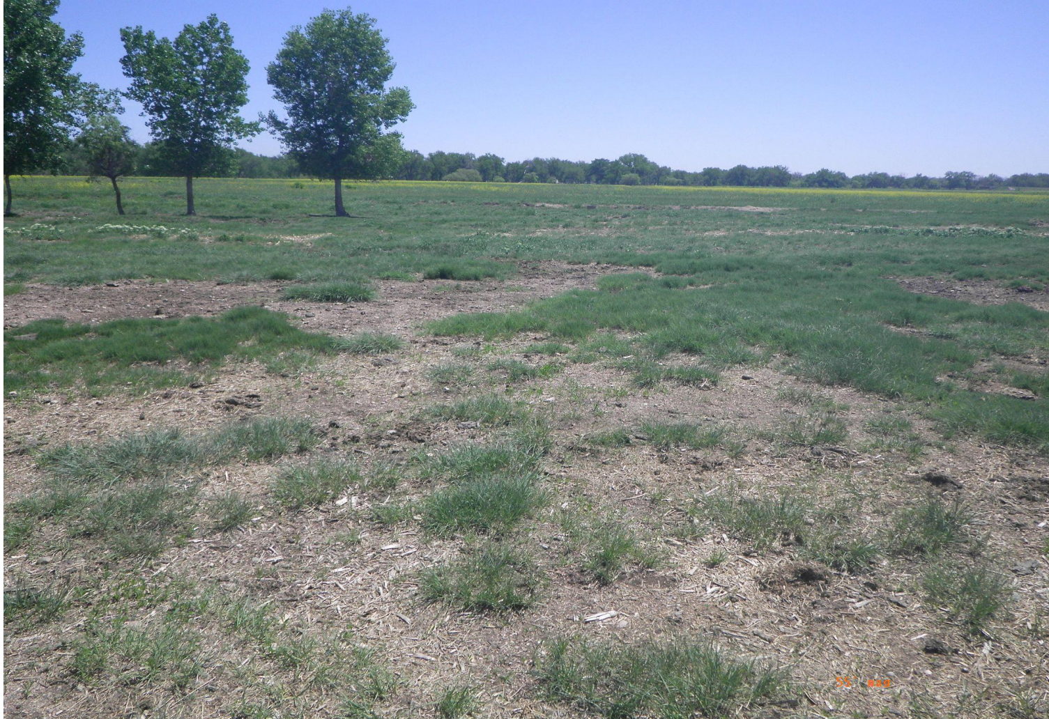
Photo 2. Overview photo of the well pad taken at ground level from the western edge facing east.