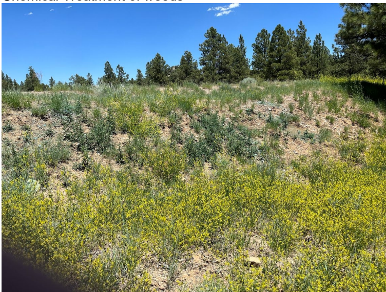
Chemical Treatment of weeds