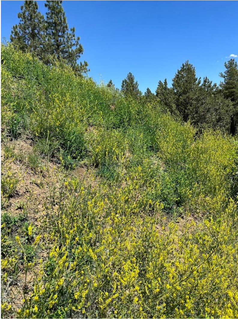
Chemical Treatment of weeds