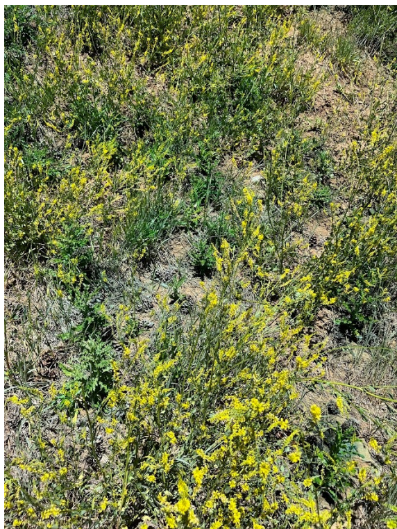
Chemical Treatment of weeds