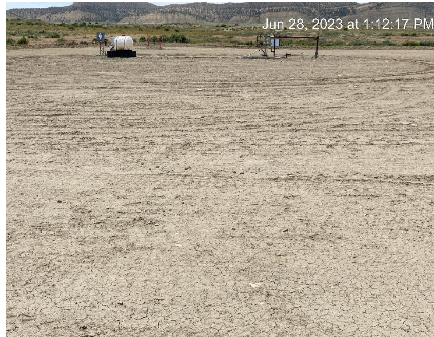
Location view from Northeast corner