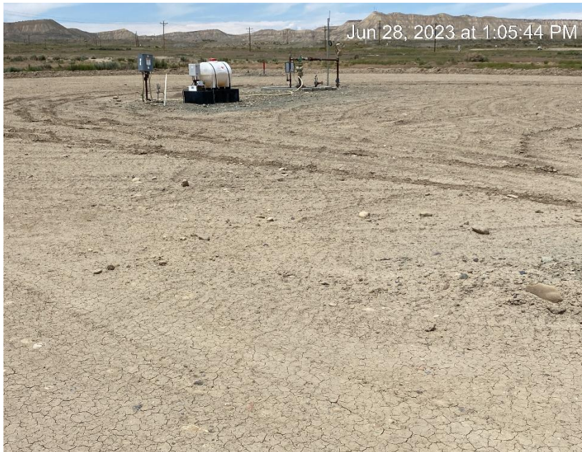
Location view from Southeast corner