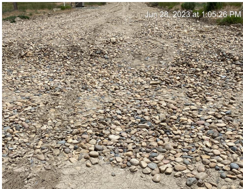
Tracking pad installed since last inspection.