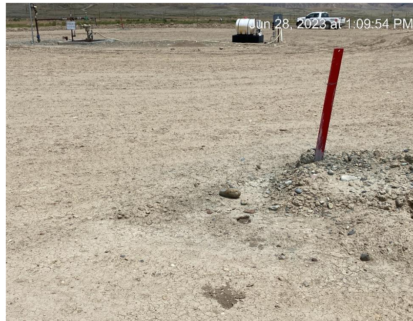
Location view from Southwest corner