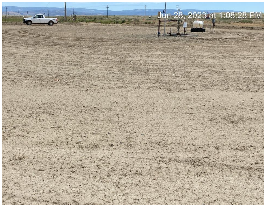
Location view from Northwest corner