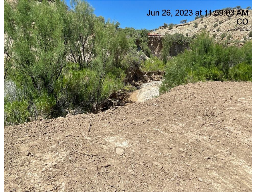
Photo # 1954 Dirt blocking path of creek & dry creek bed in the background