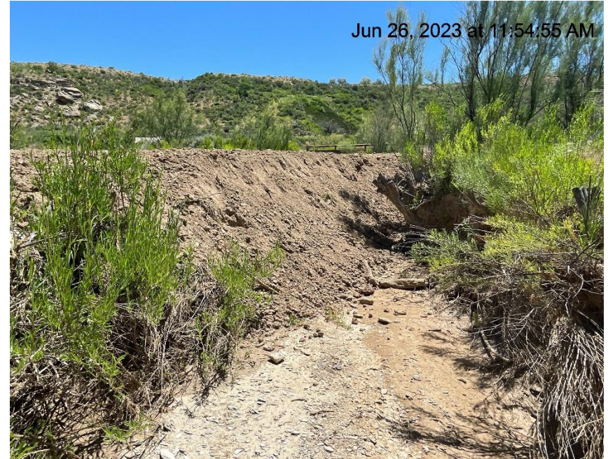
Photo # 1941 Dirt blocking/diverting path of creek & dry creek bed