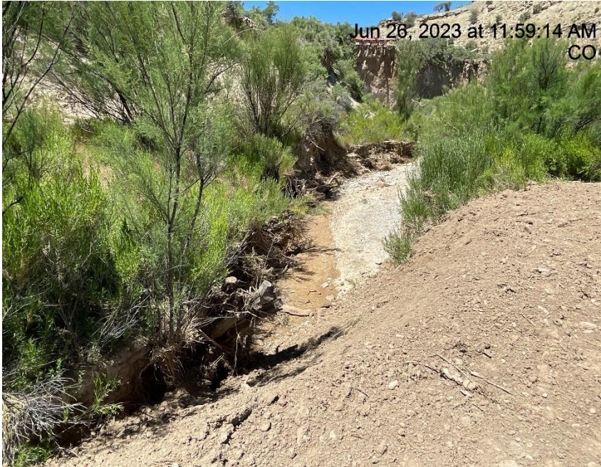
Photo # 1955 Dirt blocking/diverting path of creek & dry creek bed

Location Name: TEP ROCKY MOUNTAIN LLC BRYNILDSON ACCESS ROAD