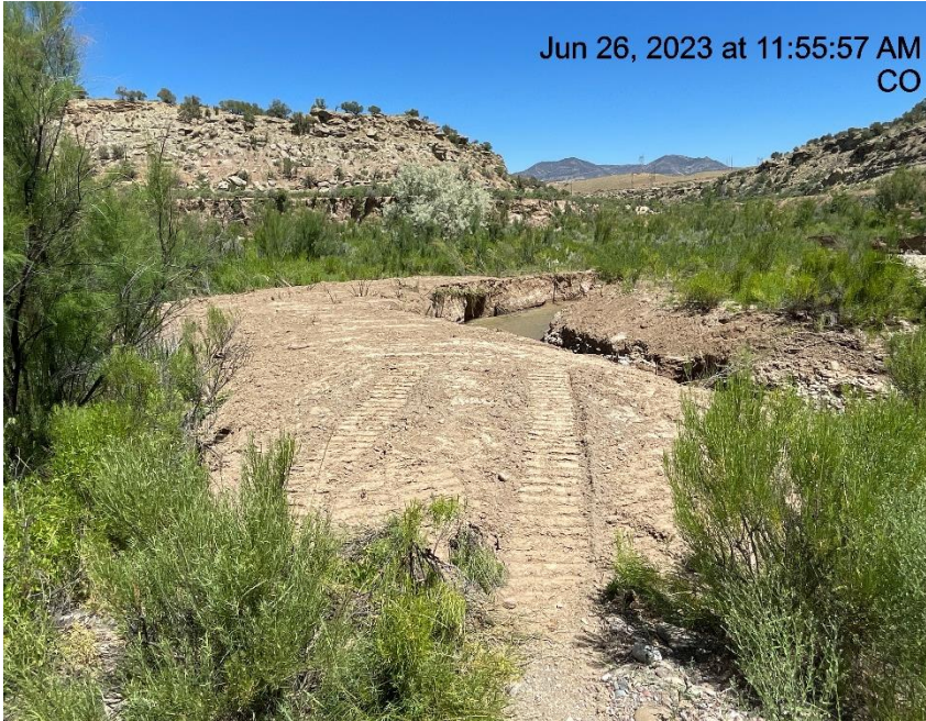
Photo # 1942 What appears to be heavy equipment tracks & dirt used to divert Mamm Creek

Location Name: TEP ROCKY MOUNTAIN LLC BRYNILDSON ACCESS ROAD