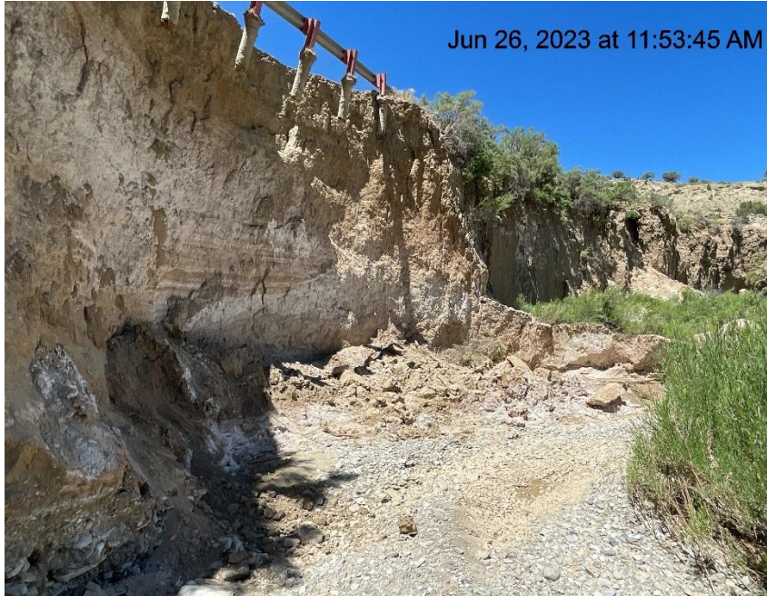
Photo # 1933 Below access road in the creek bed/destabilization of area supporting access road

Location Name: TEP ROCKY MOUNTAIN LLC BRYNILDSON ACCESS ROAD