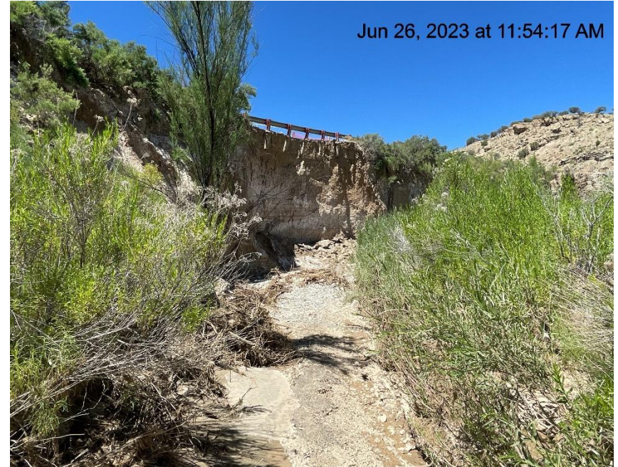
Photo # 1937 Below access road in the creek bed/destabilization of area supporting access road