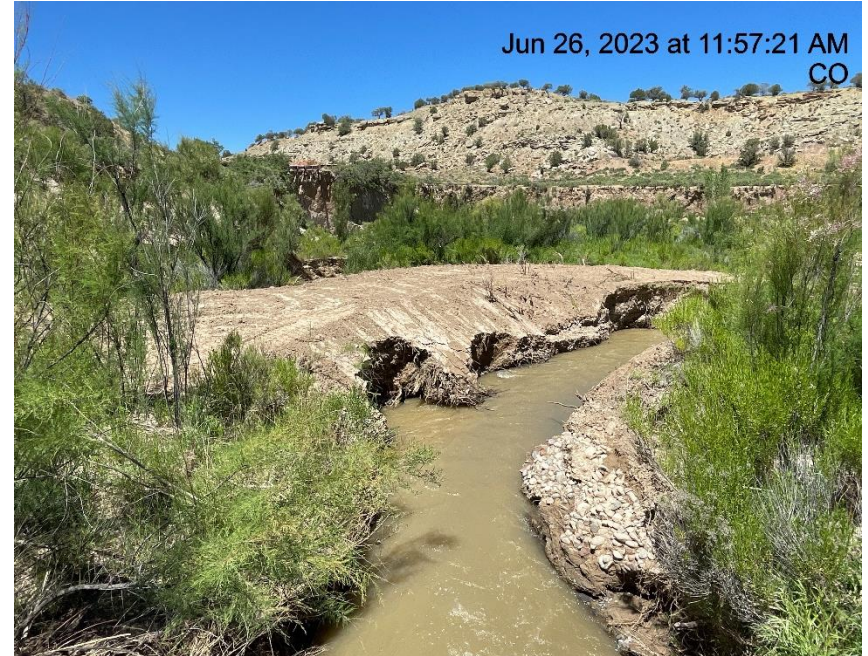
Photo # 1947 What appears to be the new path of Mamm Creek & dirt brought in to divert it