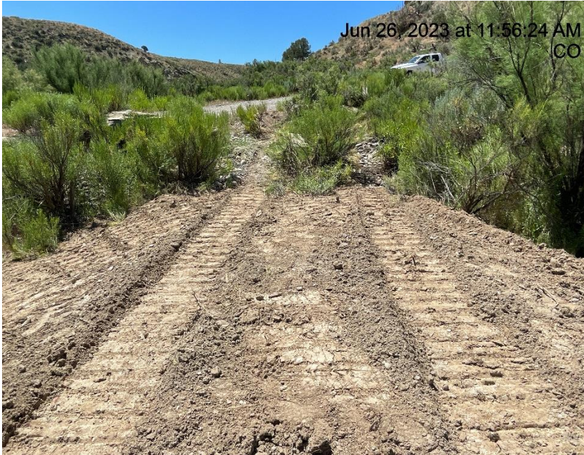
Photo # 1946 What appears to be heavy equipment tracks & dirt used to divert Mamm Creek

Location Name: TEP ROCKY MOUNTAIN LLC BRYNILDSON ACCESS ROAD