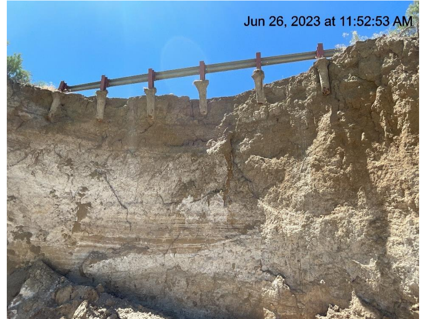
Photo # 1931 Below access road in the creek bed/destabilization of area supporting access road