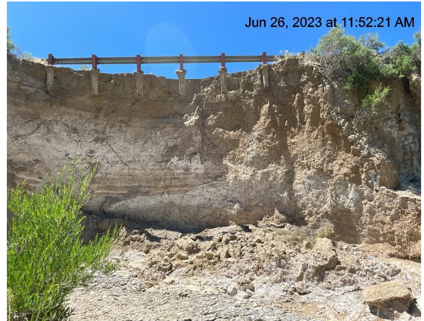
Photo # 1929 Below access road in the creek bed/destabilization of area supporting access road