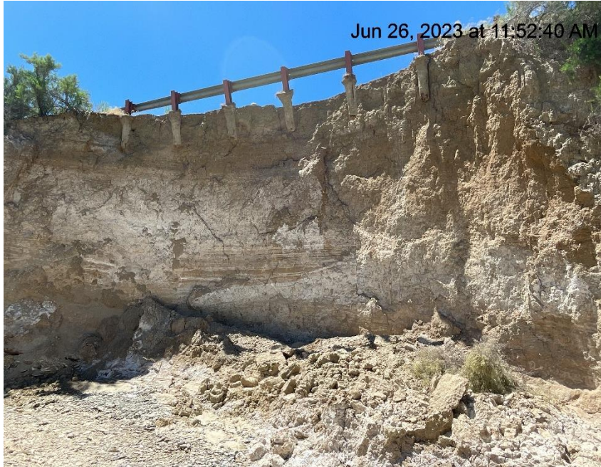
Photo # 1930 Below access road in the creek bed/destabilization of area supporting access road

Location Name: TEP ROCKY MOUNTAIN LLC BRYNILDSON ACCESS ROAD