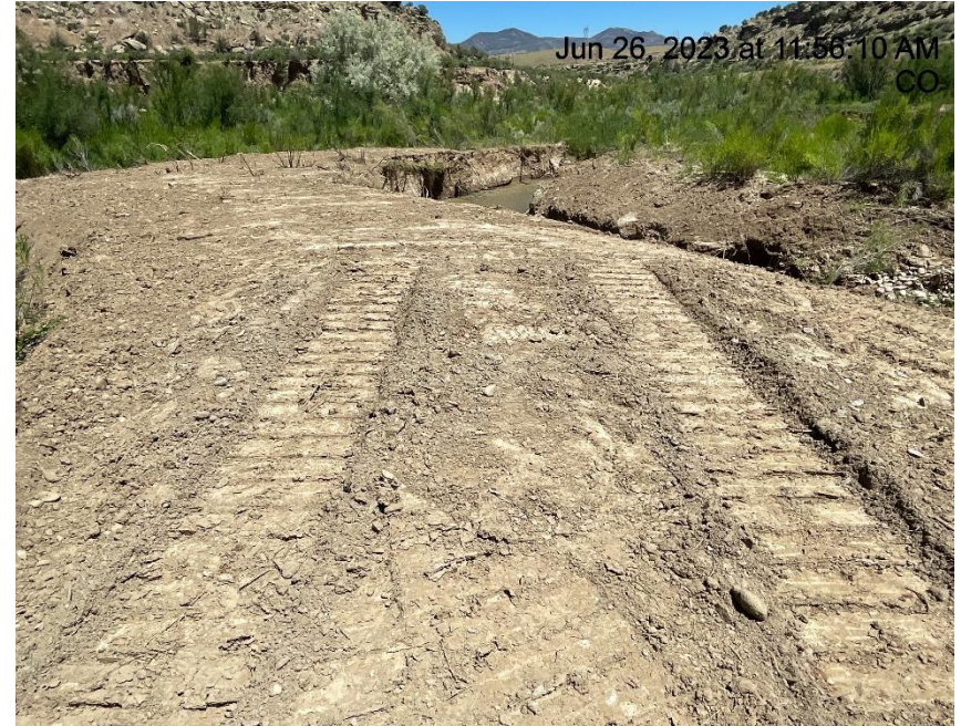
Photo # 1944 What appears to be heavy equipment tracks & dirt used to divert Mamm Creek