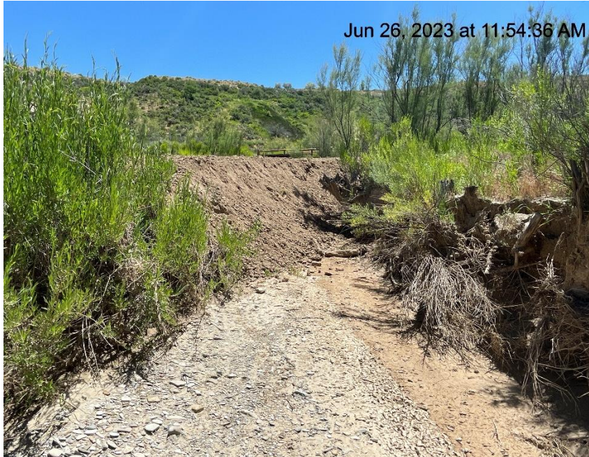
Photo # 1939 Dirt blocking/diverting path of creek & dry creek bed

Location Name: TEP ROCKY MOUNTAIN LLC BRYNILDSON ACCESS ROAD