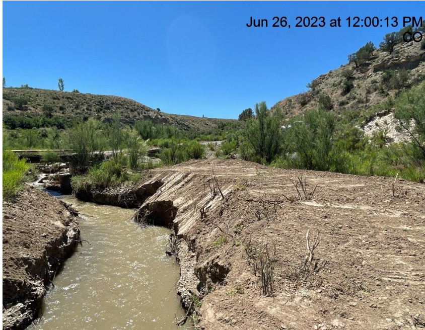
Photo # 1958 What appears to be the new path of Mamm Creek & dirt brought in to divert it

Location Name: TEP ROCKY MOUNTAIN LLC BRYNILDSON ACCESS ROAD