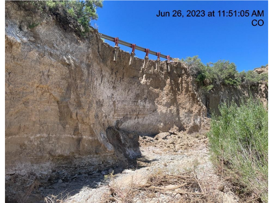
Photo # 1927 Below access road in the creek bed/destabilization of area supporting access road