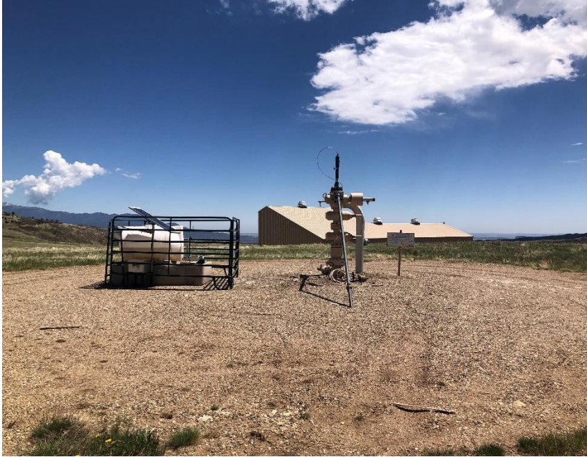
Blowdown line rigged up to Sheep Mountain Unit #8-2-P.