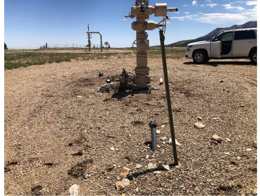
SHEEP MOUNTAIN UNIT 7-35-L (Api 05-055-06106) Unused riser.