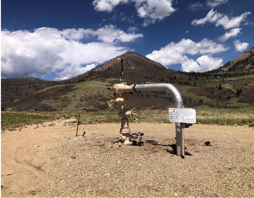
SHEEP MOUNTAIN UNIT 7-35-L (Api 05-055-06106) Unused riser.