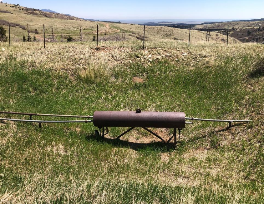
DRILL SITE #5 NORTH PIT Facility ID: 483531