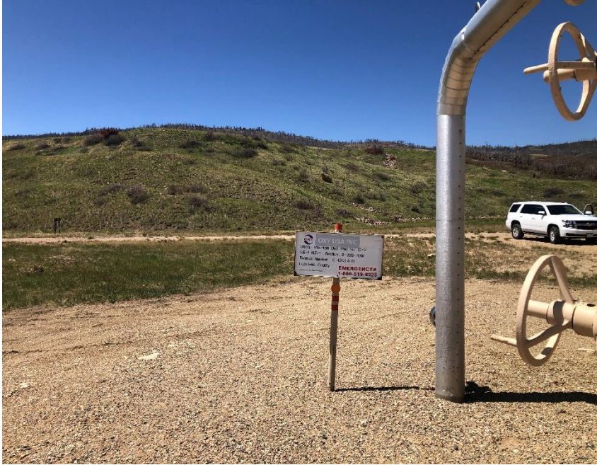
SHEEP MOUNTAIN UNIT 10-2 (Api 05-055-06035) Unused riser.