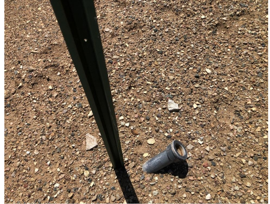
SHEEP MOUNTAIN UNIT 10-2 (Api 05-055-06035) Unused riser.