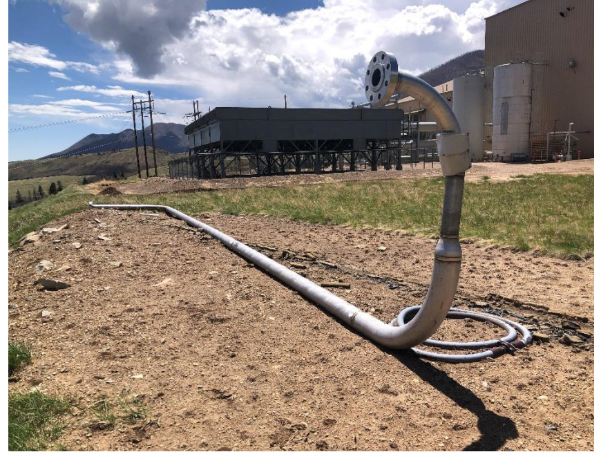
Unused equipment flowline laying behind compressor station NWNW128S70W compressor facility # 442259